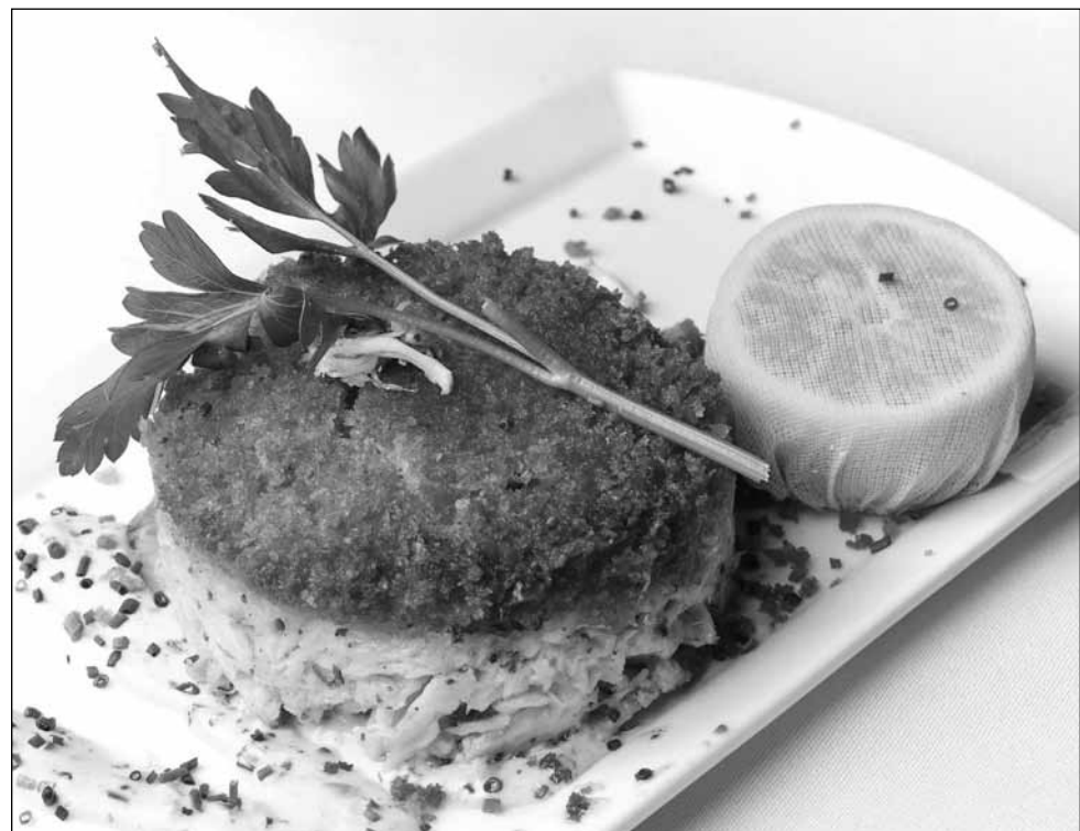
Panko covered crab cake