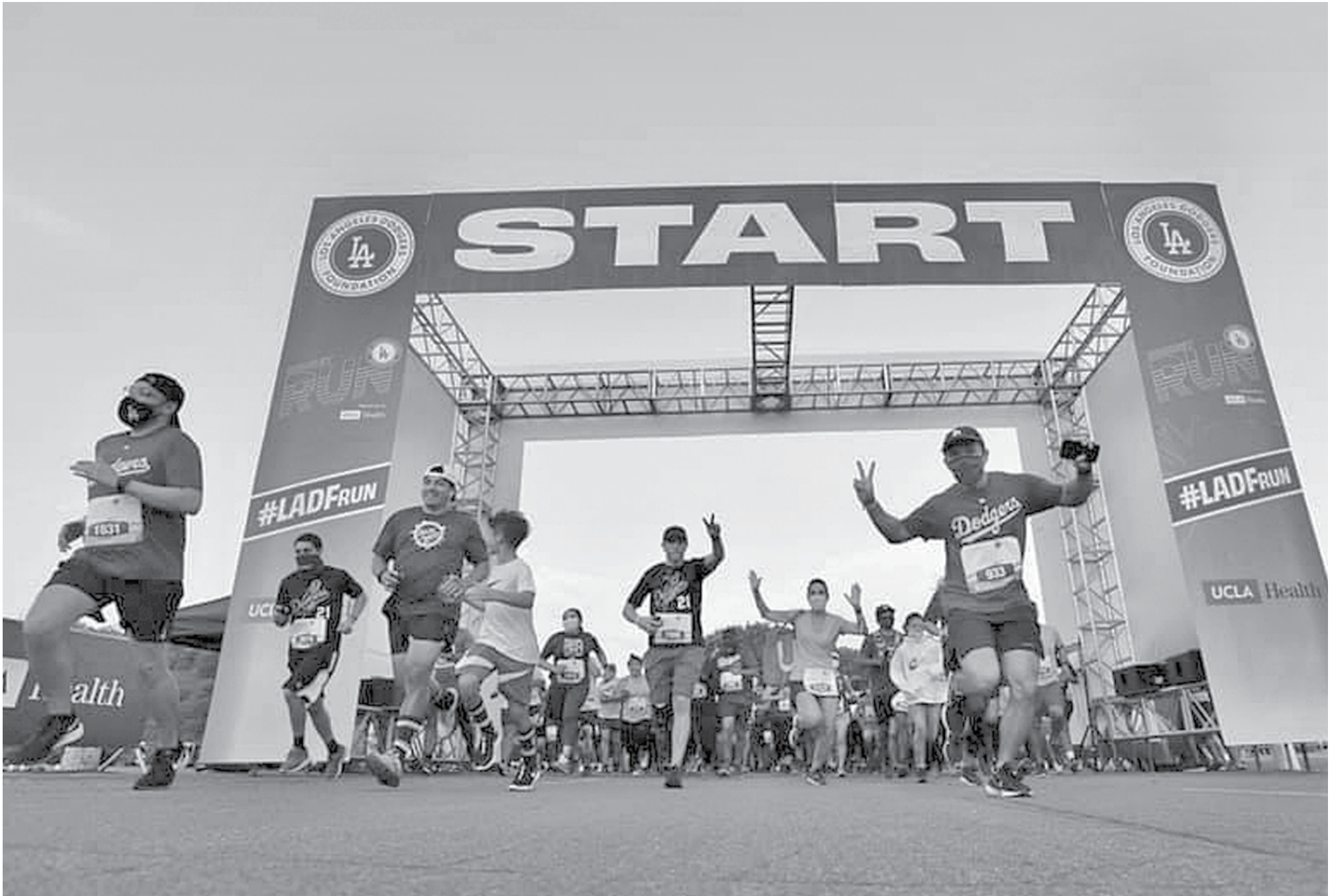
The return to Dodger Stadium last weekend featured a new 5k course in Dodger Stadium with evening breathtaking views of the Downtown L.A. skyline, the newly renovated Centerfield Plaza, and a cool-down lap around the Dodger Stadium warning track. Participants had the choice of either an in-person or virtual run. The Los Angeles Dodgers Foundation envisions a city where everyone regardless of zip code has the opportunity to thrive. They are tackling the most pressing problems facing Los Angeles with a mission to improve education, health care, homelessness and social justice for all Angelenos. Thank you UCLA Health and the Los Angeles Dodgers Foundation for helping to improve our South Bay communities.