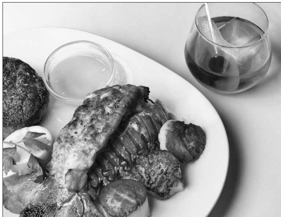
Steak, lobster and scallops

"Working here, it feels like what I'm called to do," says Gonzales. "My goal is to work in upper management, and maybe one day open a location in Tokyo. I speak fluent Japanese now. That would be a dream come true." •