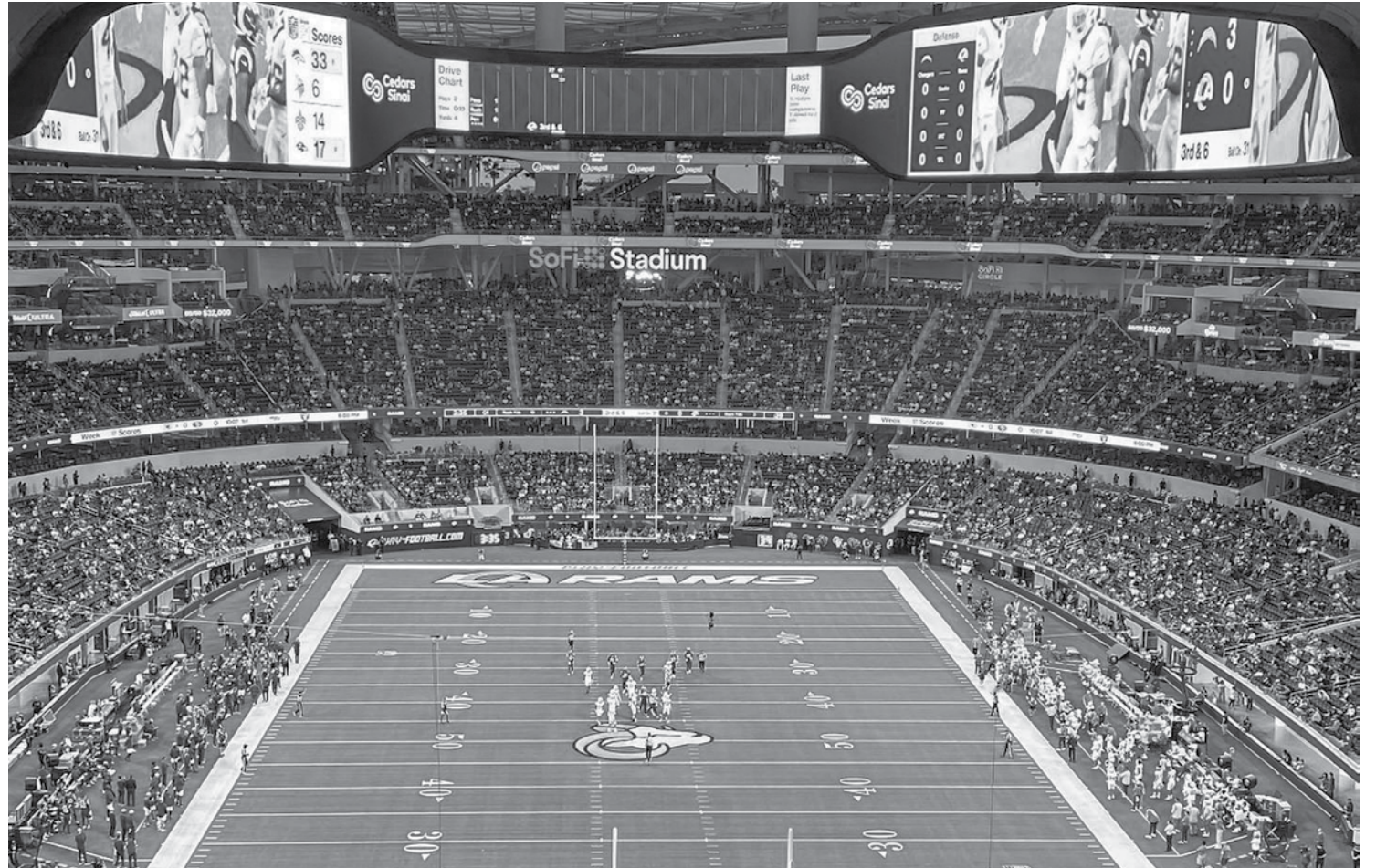
The first preseason game between the Los Angeles Rams and the Los Angeles Chargers was this past Saturday. We love seeing our fans in the building.