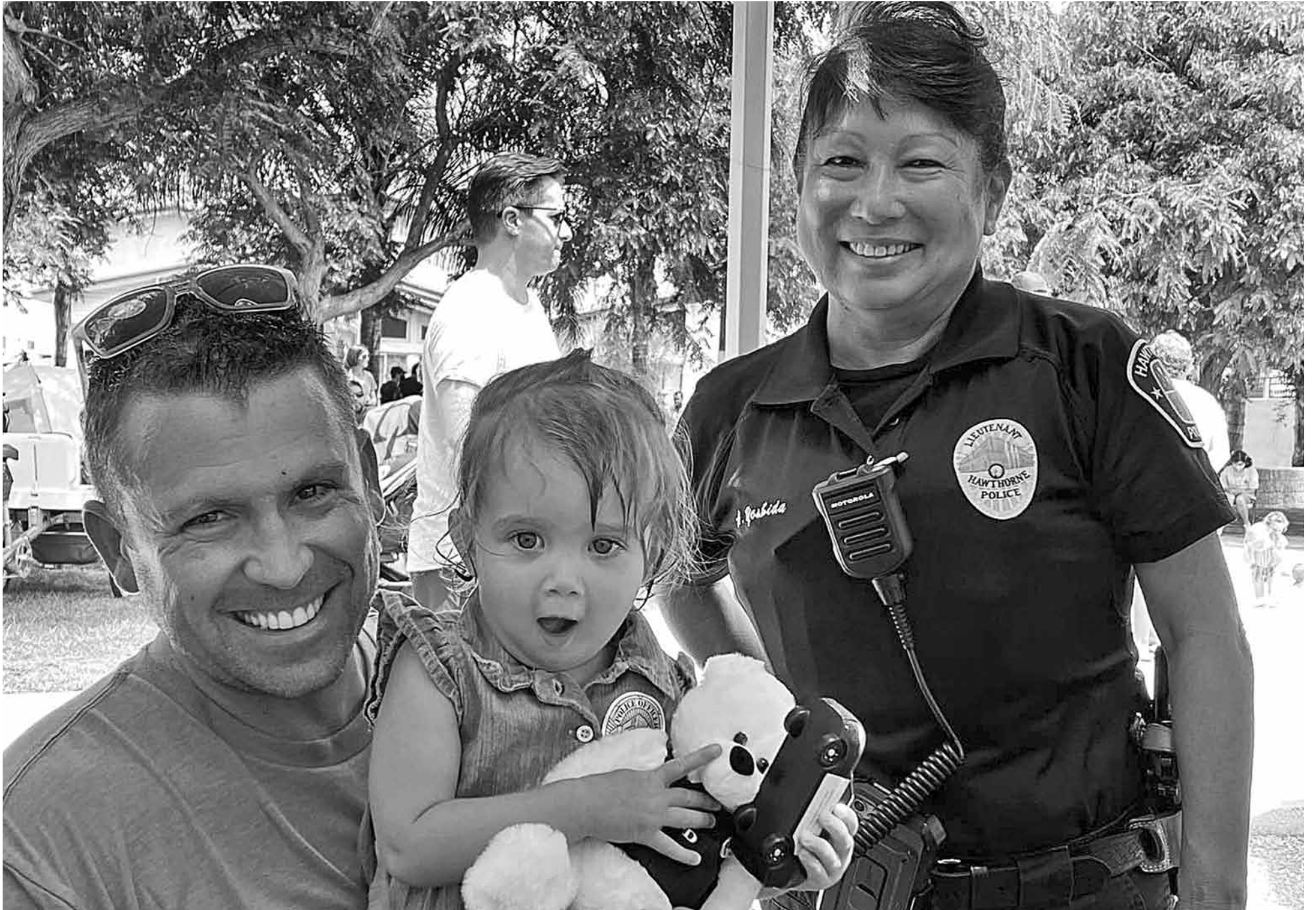
A great time was had at the Holly Glen community picnic this past Saturday. It's nice to know that our wonderful community strives to bring neighbors together.