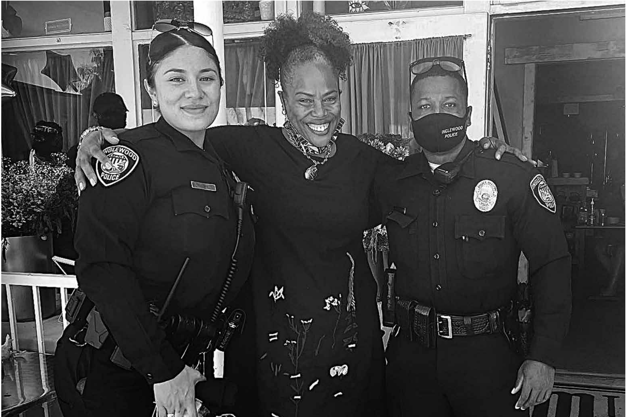
Mingles Tea Bar brought the Inglewood community together with Food, Games, Face Painting, Music, Vendors and Giveaways. They have a large selection of premium loose leaf teas that could be enjoyed there or to take home by the cup or the ounce. Mingles Tea Bar educates their customers on the various teas they carry as well as the health benefits they provide. Thank you for hosting such a fun event. Visit them and experience the flavor.

“If you are cold, tea will warm you; if you are too heated, it will cool you; If you are depressed, it will cheer you; If you are excited, it will calm you.”