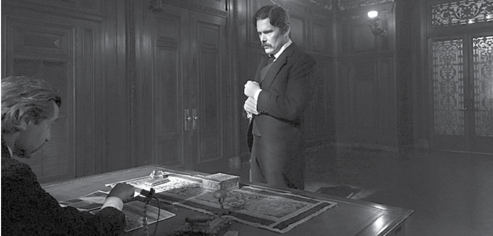
Tesla courtesy IFC Films.

Festival) to be perceived as a typical biopic. The freewheeling and neon-soaked nature of the film is the main draw, and it plays much like an extended episode of Comedy Central's 'Drunk History.' However, there are scenes that seem disassociated with this otherwise unique style which throws off the balance of the film. Had the surreal moments carried consistently throughout, there's no