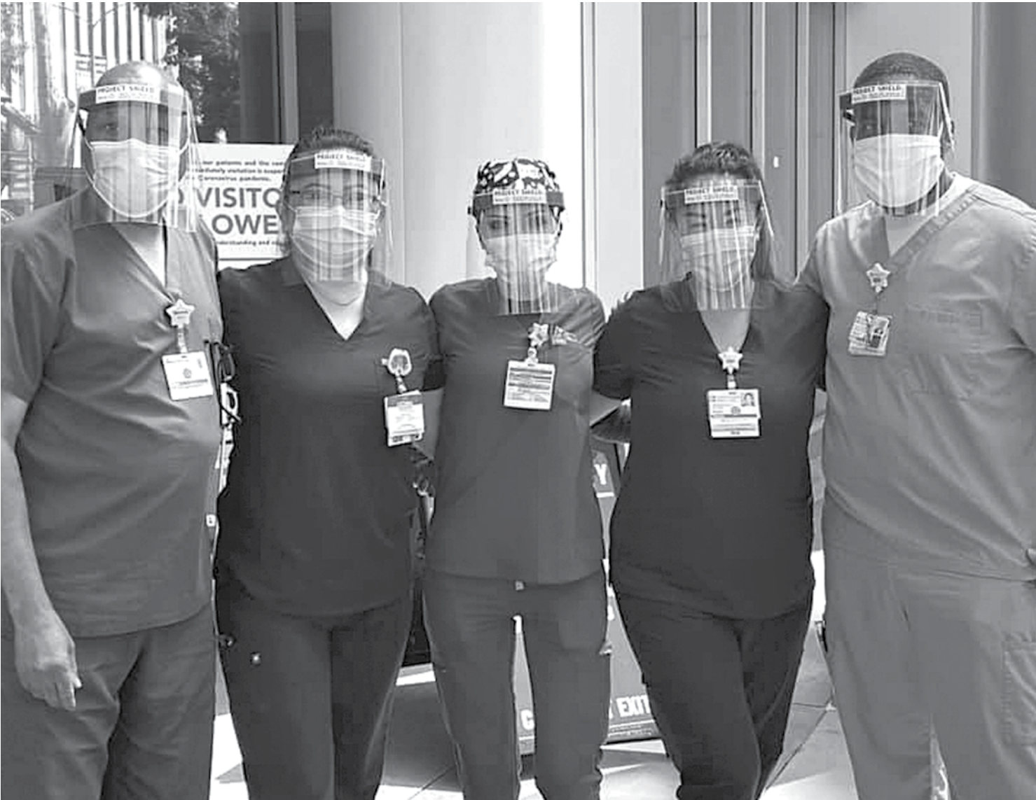
The Hawthorne Rotary Club generously donated four-hundred and thirty face shields. This will help our healthcare workers stay safe in the fight against COVID-19. Thank you Hawthorne Rotary Club.