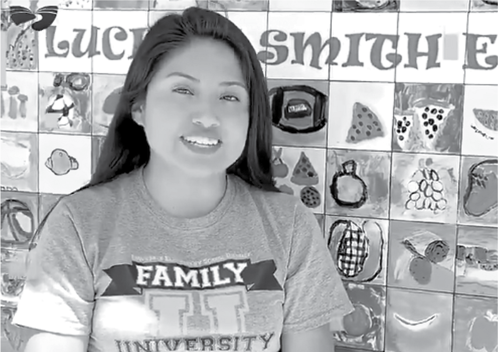
If you haven't been able to attend our past live Family University Parent Workshops, we have amazing news. Our workshops are now available for you to see whenever you want at lawndalesd.net/famuvirtual . Here you can learn how to use Zoom for distance learning.