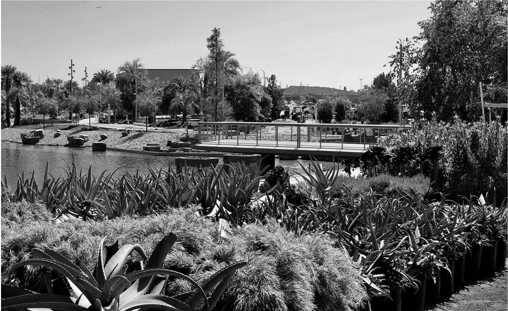
Planting around the park includes collections from the Mediterranean biome. Some of the plants include a rare double trunk Brachychiton populneus (Bottle Tree) from Australia, Jubaea chilensis (Chilean Wine Palm), Araucaria araucana (Monkey Puzzle Tree), Cyphostemma juttae (Wild Tree Grape) and several Aloes in the Cape Collection.