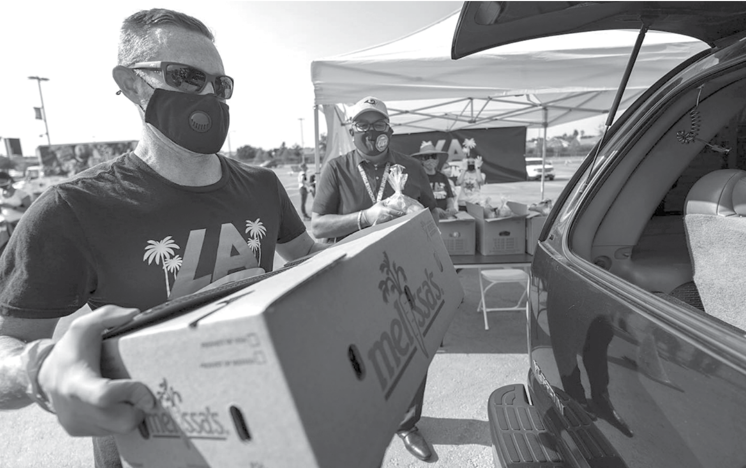
Since 2001, One For All has provided backpacks, school supplies and scholarships to Inglewood and families to prepare students and their families for the academic year. LA Bowl, a yearly college football bowl game planned to take place at SoFi Stadium, has partnered with One for All to provide support in One For All's initiatives throughout the year. In addition to donating school supplies, LA Bowl has donated 200 boxes of fresh produce, which along with the school supplies were handed out to 200 pre-registered families identified by One For All.