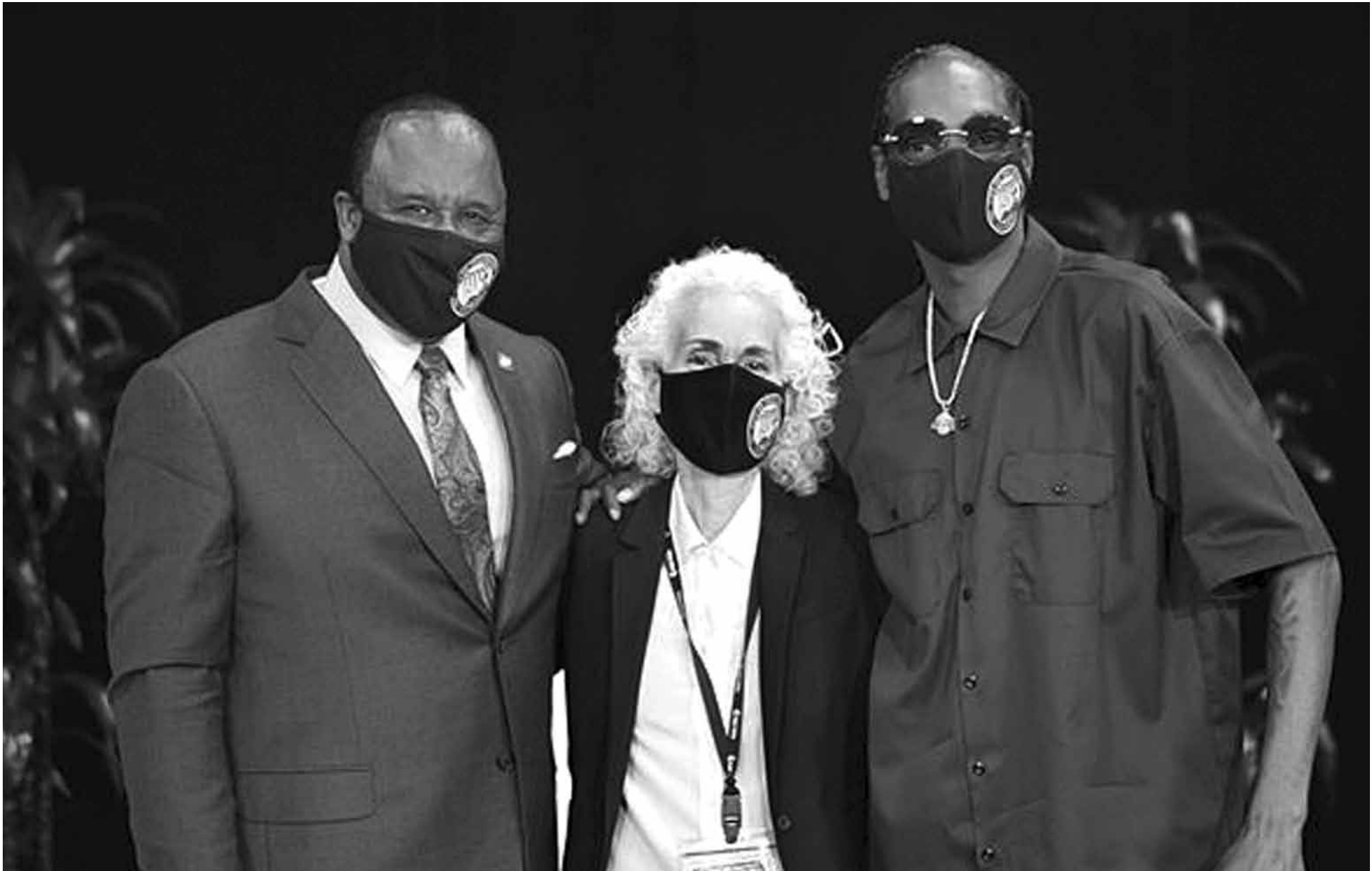
Mayor James T. Butts, Snoop Dogg and Dr. Barbara Ferrer will discuss the impacts of COVID-19 on the City of Inglewood and offer insights on a path forward. The COVID-19 panel discussion will premiere on the City of Inglewood’s Facebook Live so be sure to tune in at 6:00 pm on August 27, 2020.