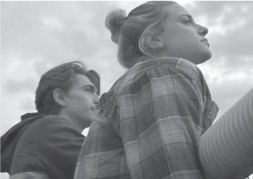
Chemical Hearts , courtesy Amazon Studios.

Although the stereotypical teenage clichés are sprinkled throughout, Chemical Hearts