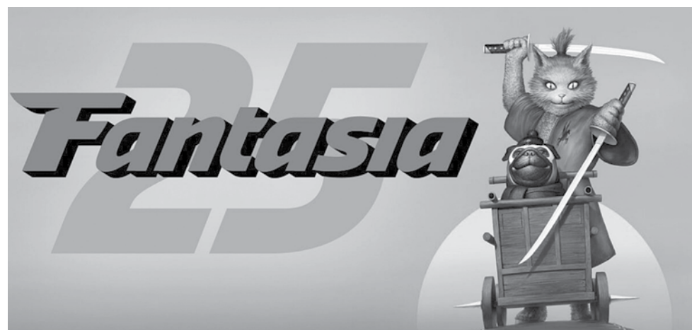
Fantasia 2021, courtesy Fantasia Film Festival.

Watching this ensemble of amateur actors is like watching a Christopher Guest film