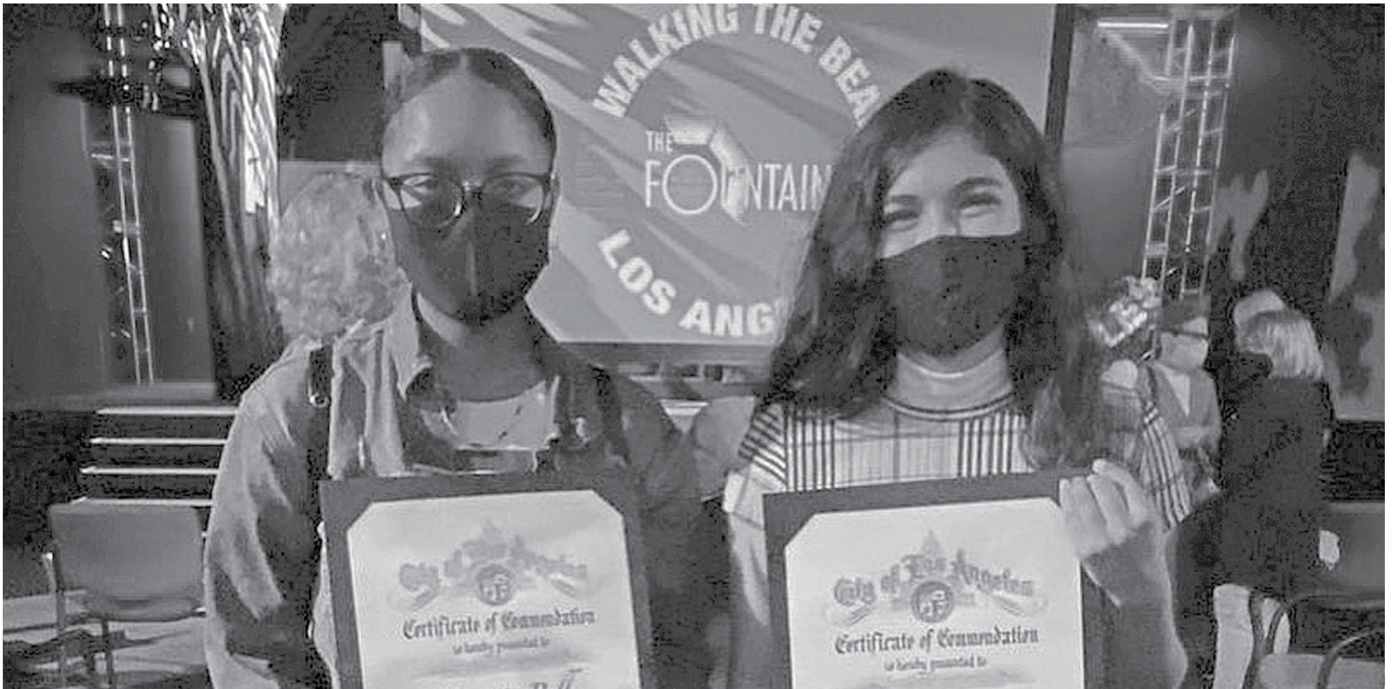
Both girls were chosen to participate in a summer program called Walking the Beat. They were able to use their voices and make art with meaning that promotes change and growth. Thank you Theodore Perkins and the Walking the Beat staff, for creating such an amazing program to aid in helping us bridge the gap and reach the youth in the community.