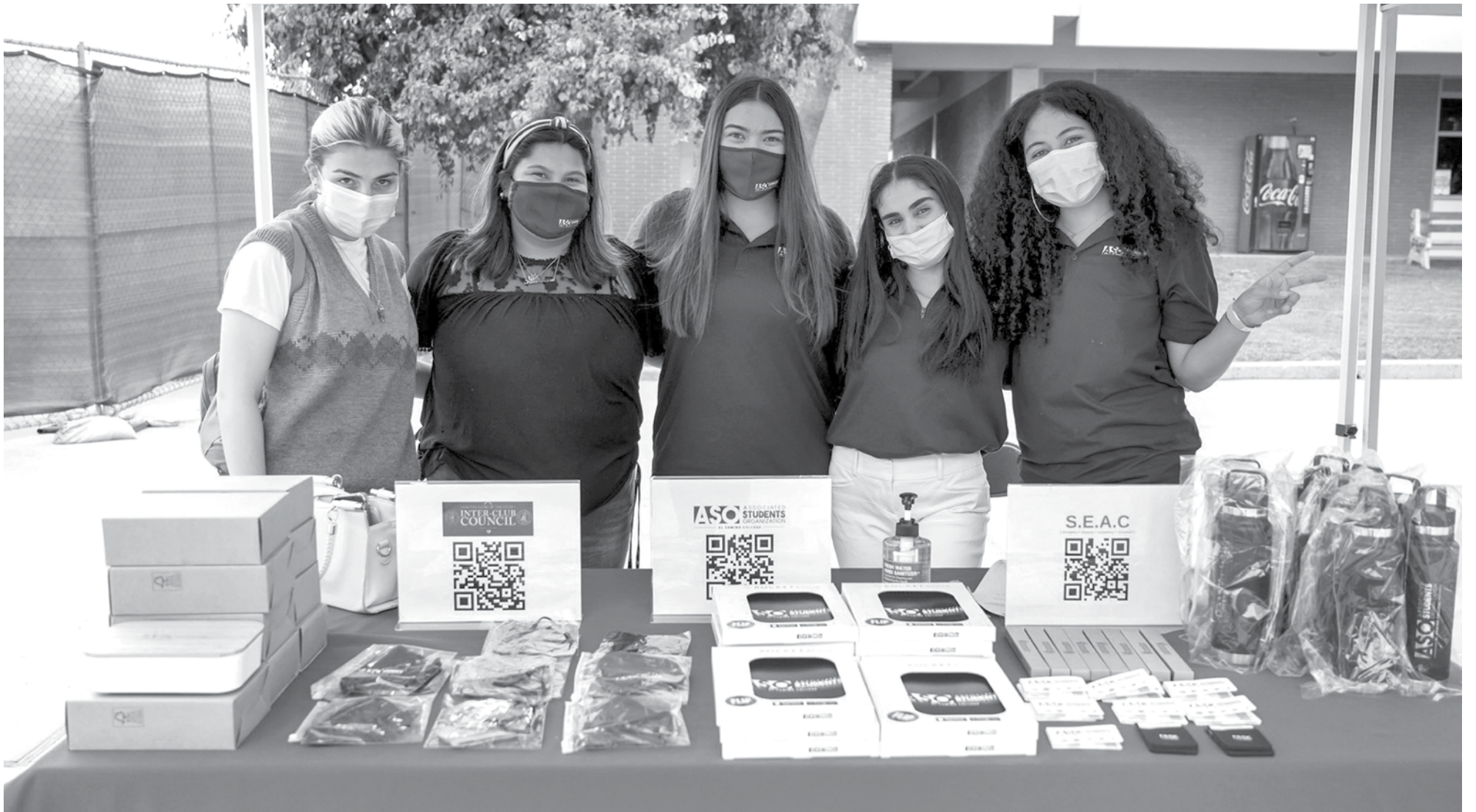
The Warrior Family got a bit bigger with lots of students registering and enrolling for the upcoming fall semester.