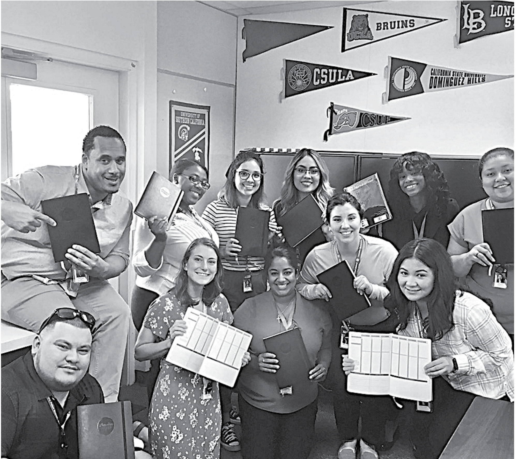
The Lawndale Elementary School District (LESD) thanks Passion Planner for donating planners to the new cohort of social work and counseling interns, and marriage and family therapy trainees who serve the local community from various graduate programs and universities!