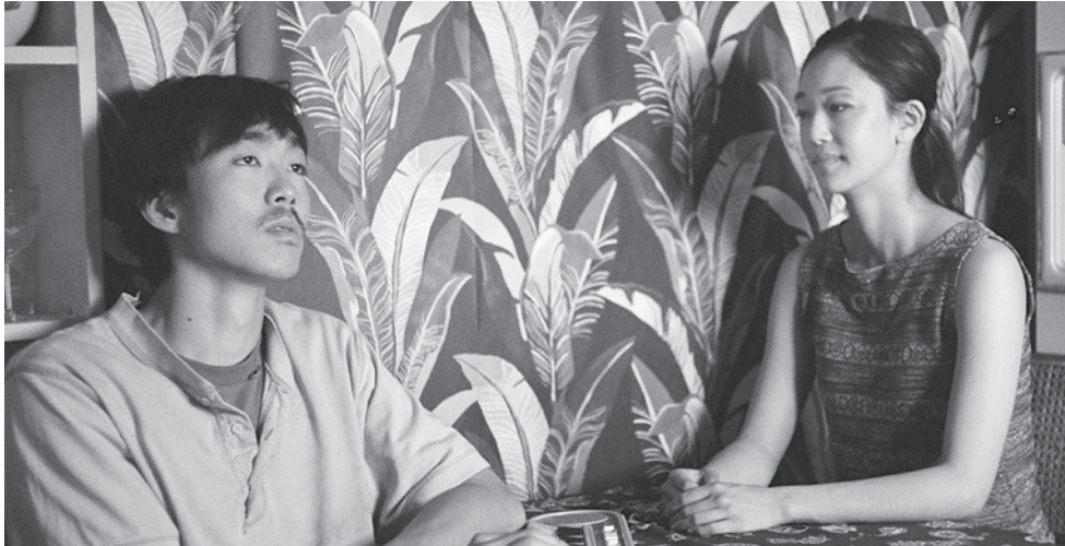
Ms. Purple