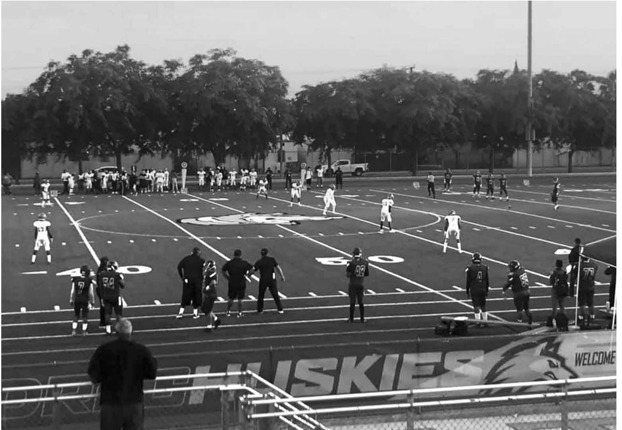
After shutting out Legacy 41-0 the previous weekend at home, the Hawthorne High Cougars defeated Diego Rivera 40-0 on the road on Sept. 6. It was another strong showing on both sides of the ball.