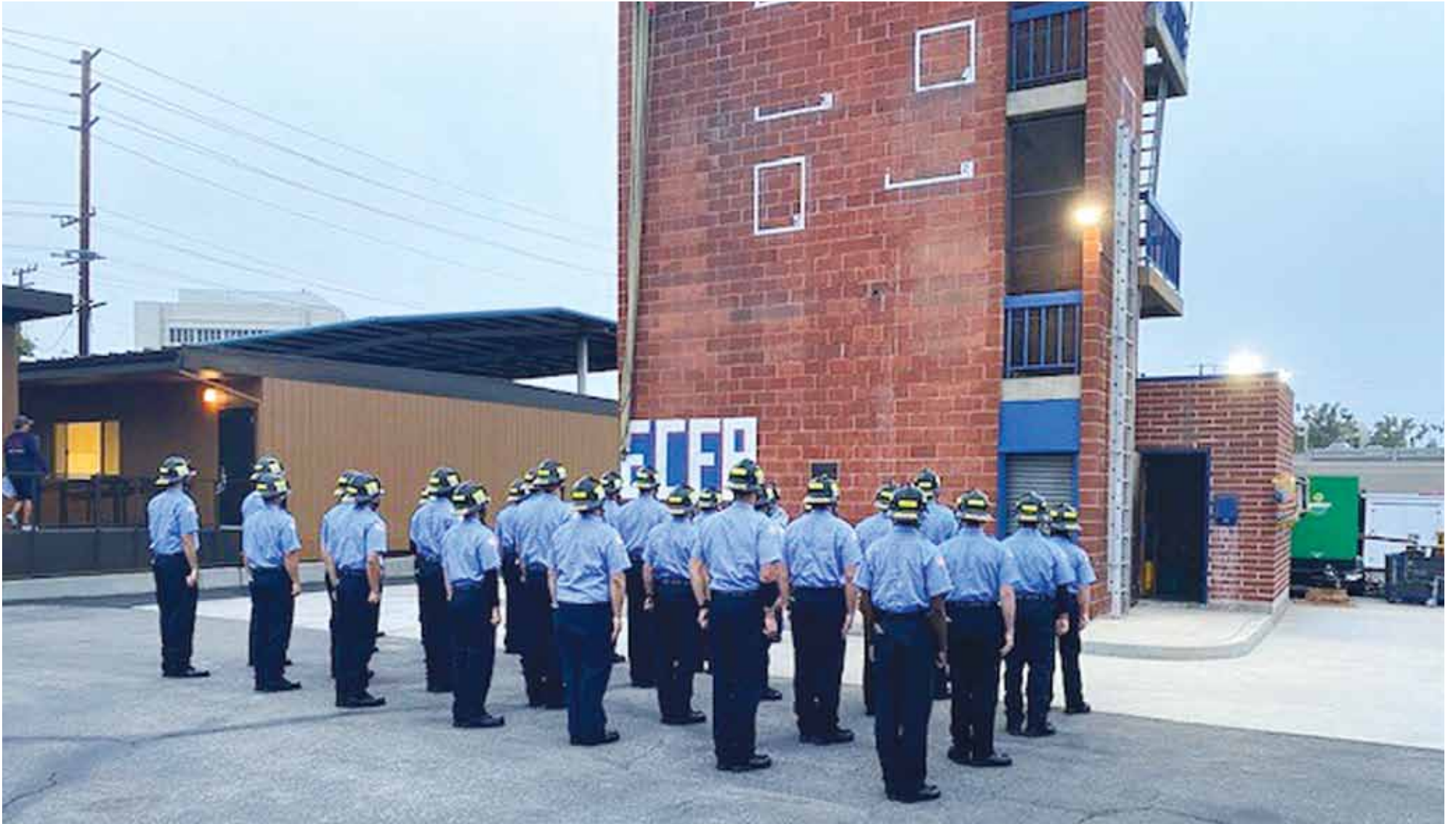
In honor of those who lost their lives on September 11, including the 343 brave members of the New York City Fire Department, El Camino College Fire Academy's Class 157 and several past graduates performed a memorial tower climb. Individuals climbed 110 stories, the same height as the World Trade Center, at the ECC Fire Academy. The recruits started the climb in full turnouts, with some on air, while slowly peeling off gear until completion, approximately one hour and 30 minutes later.