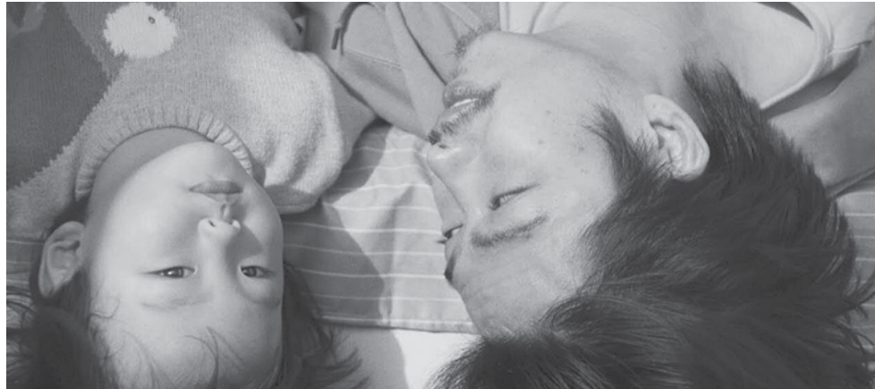
The Year of the Everlasting Storm

Perhaps the simplest entry (and my personal favorite) is the observational closing film from Thai master Apichatpong Weerasethakul. His films always stay true to the present moment and