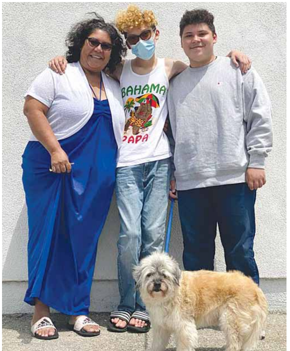
Congratulations to Gambit and his new family.

to take him home and he's doing great in his new environment. spcaLA is very thankful to all our adopters and the updates they send us! •