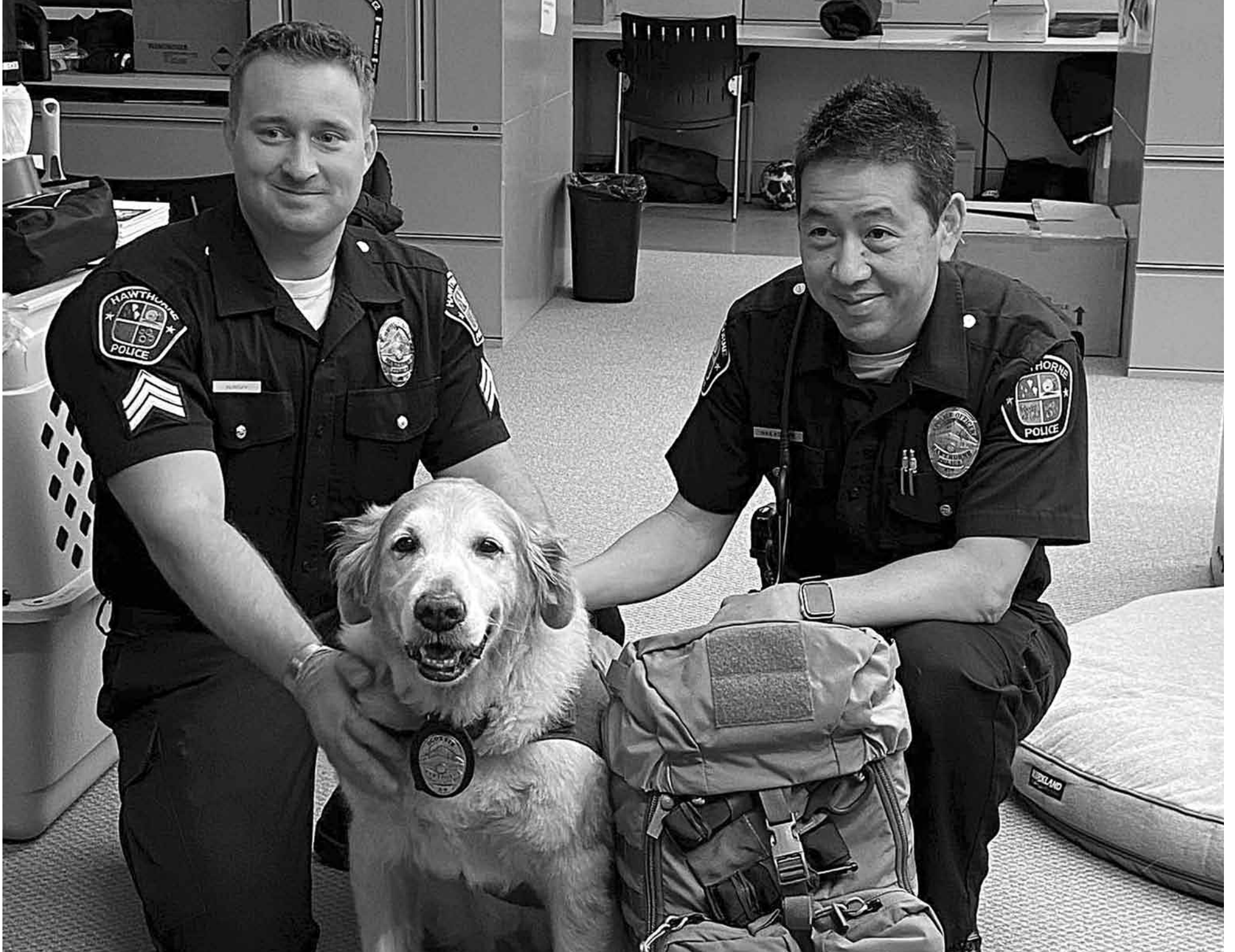
Scottie had a Lipoma removed from his side. With the help from his veterinarian, and his best buds from the Hawthorne Police TacMed Team, he got his bandages changed everyday, and all the love a pup can handle. Scottie is doing fine, thank you guys for all the love and support.

“I think dogs are the most amazing creatures; they give unconditional love. For me, they are the role model for being alive.”