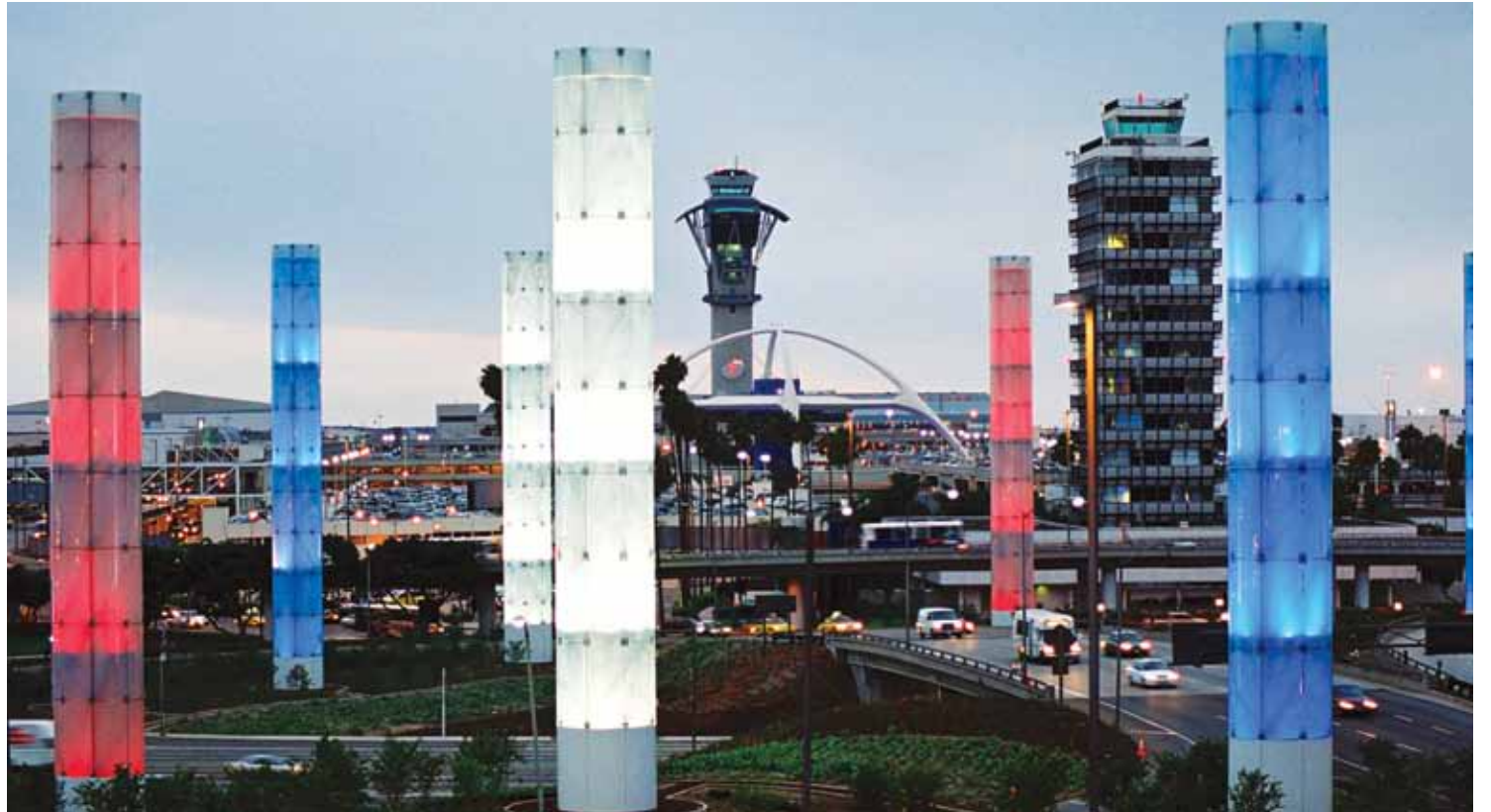
The LAX pylons were lit in red, white and blue last weekend as we remembered the somber 20th anniversary of the 9/11 attacks.