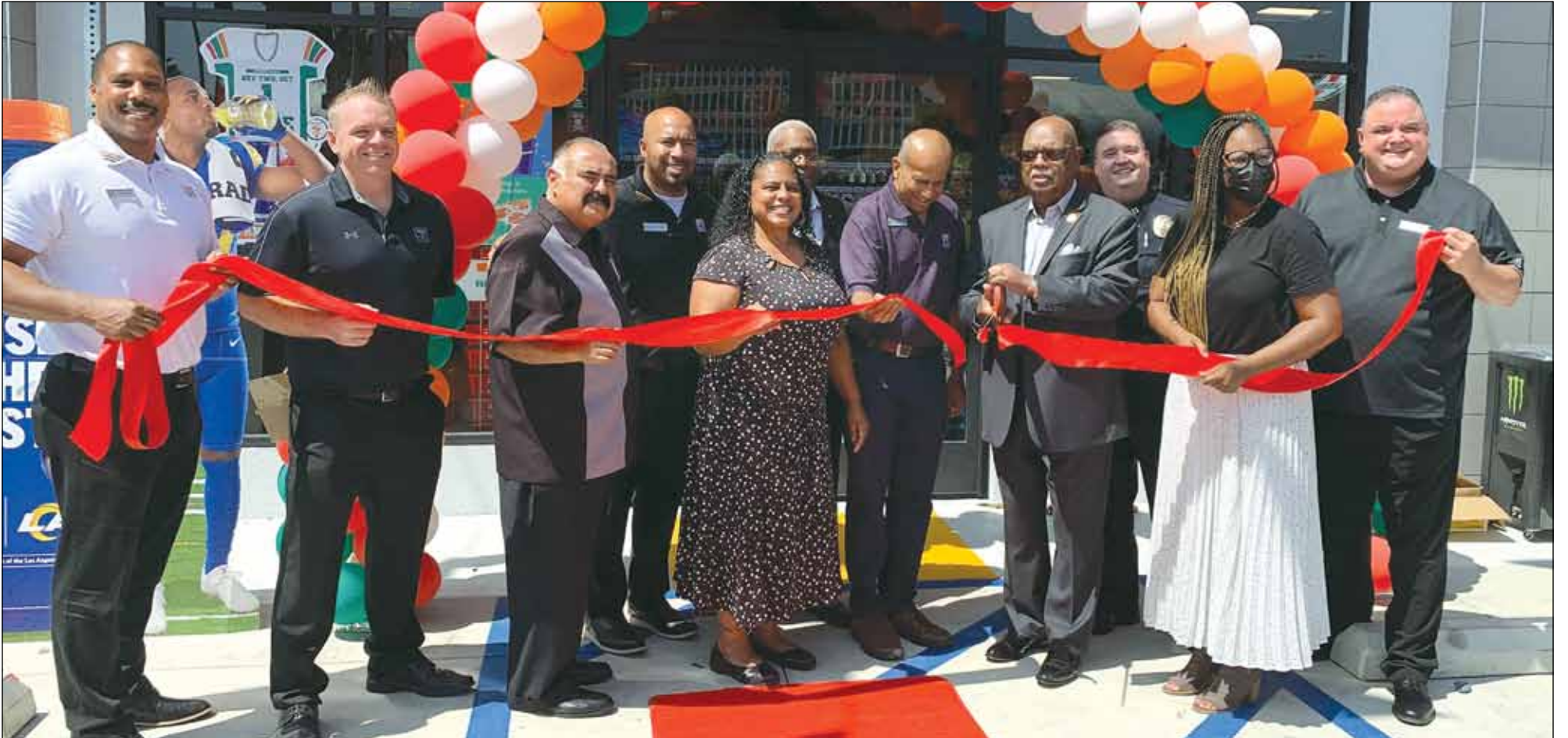
7-Eleven opened their newest location at the intersection of Prairie and Arbor Vitae. Celebrations included a Ribbon Cutting Ceremony, words from City Officials and Grants to local schools.