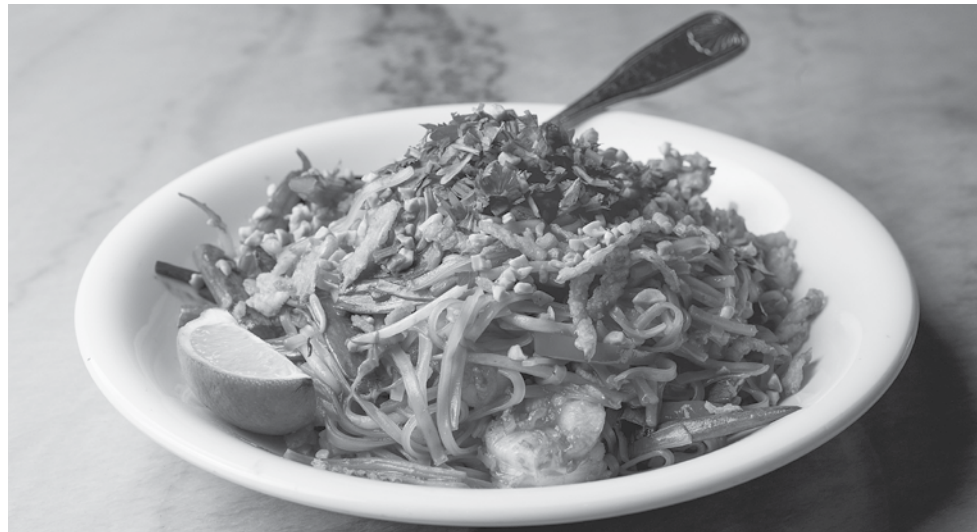
The Pad Thai is served with pork and shrimp, topped with crushed peanuts and green onion.