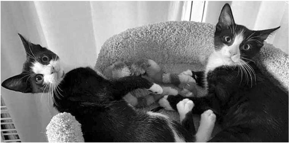
Mo and Slim

Saving one animal won't change the world, but the world will surely change for that animal. •