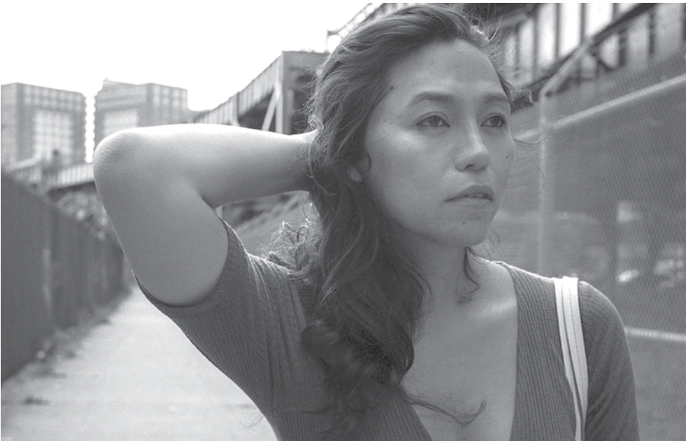
Lingua Franca

speakers whose native languages are different. Nothing could better describe the relationship between Olivia and Alex. In the beginning, their interactions are focused on Alex learning Olga's routine and how to care for her, and grows into a genuine interest in Olivia and her culture. As they become more intimate, they find their language but the secrets between them only continue to grow.