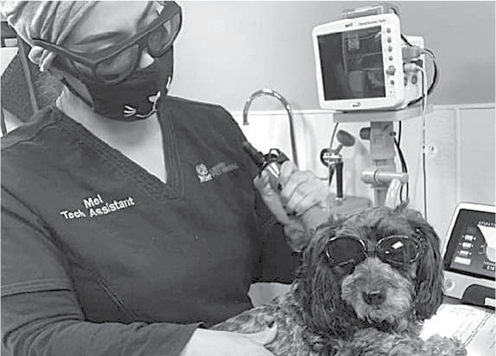
Veterinary laser therapy provides a non-invasive, pain-free, surgery-free and drug-free treatment used to treat a variety of conditions, and can be performed in conjunction with existing treatments. Laser treatment for dogs employs deep penetrating light to promote a chain of chemical reactions known as photobiostimulation. This process helps relieve pain through the release of endorphins, and it stimulates injured cells to heal at an accelerated pace.

“A dog can snap you out of any kind of bad mood that you’re in faster than you can think of.” — JILL ABRAMSON