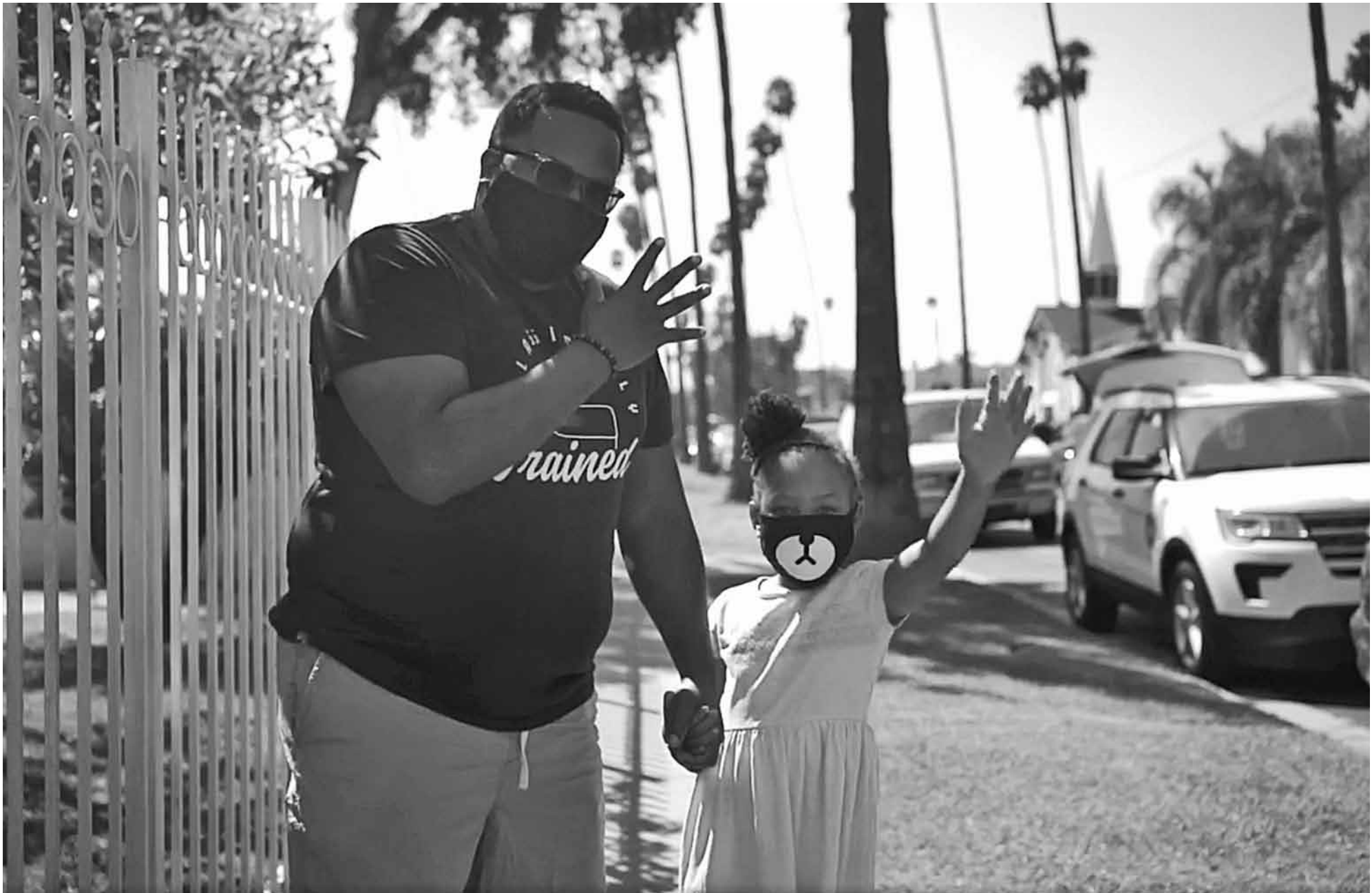
Inspired by the 7x platinum hit by rapper Future, The City of Inglewood puts a public health spin on the song to urge everyone in the community, to KEEP THAT MASK ON while in public. Mask On is a cover song intended for non-commercial, educational purposes under Fair Use, as we believe that it adds new expression or meaning to the original song. The City does not claim to own any rights to this song. To see the video, go to the City of Inglewood’s Facebook page.