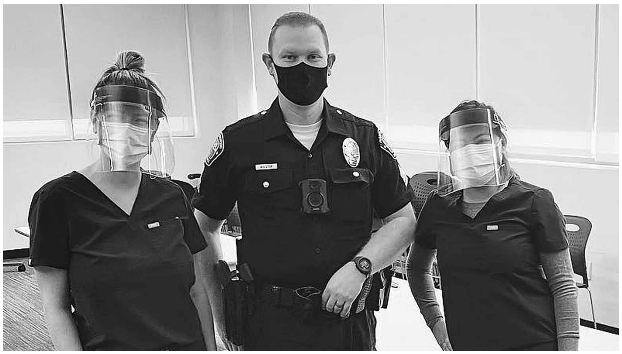
Dr. Paul's Immediate Care stopped by the Hawthorne Police station to administer flu shots and b12 shots for the department personnel. You and your staff are much appreciated for taking the time to keep our police healthy and safe.