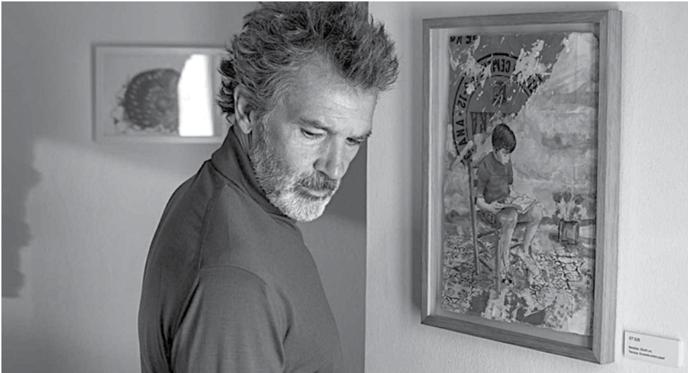
Pain and Glory

The film skips through three periods of Salvador’s life: His childhood in the ‘60s, when he and his impoverished parents lived in caves in Valencia, Spain and he fell for a neighborhood laborer; his adulthood in ‘80s Madrid when his great, though tragic love affair occurred; and the present, where we see him become increasingly isolated and