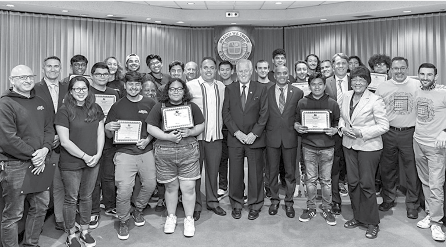
The Hawthorne City Council presented Certificates of Appreciation to the 23 Hawthorne High School Manufacturing & Engineering Students who graduated from the South Bay Workforce Investment Board's Aero-Flex Pre-Apprenticeship Program.