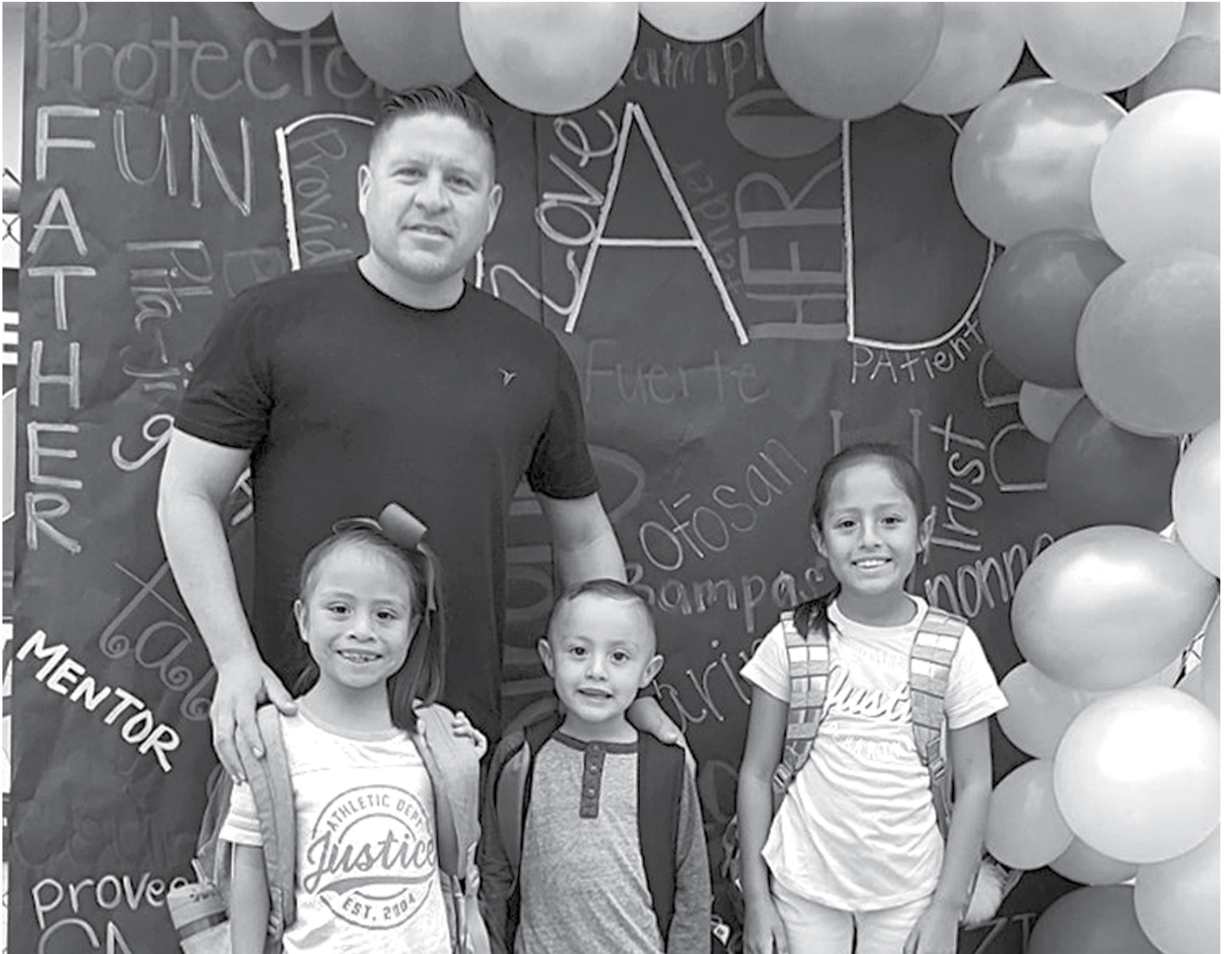
Last week, Billy Mitchell Elementary School recognized National Million Fathers March – an opportunity for fathers, uncles, grandfathers, brothers, mentors and family members to show commitment to the educational lives of local students. Mitchell families participated by walking their children to school.