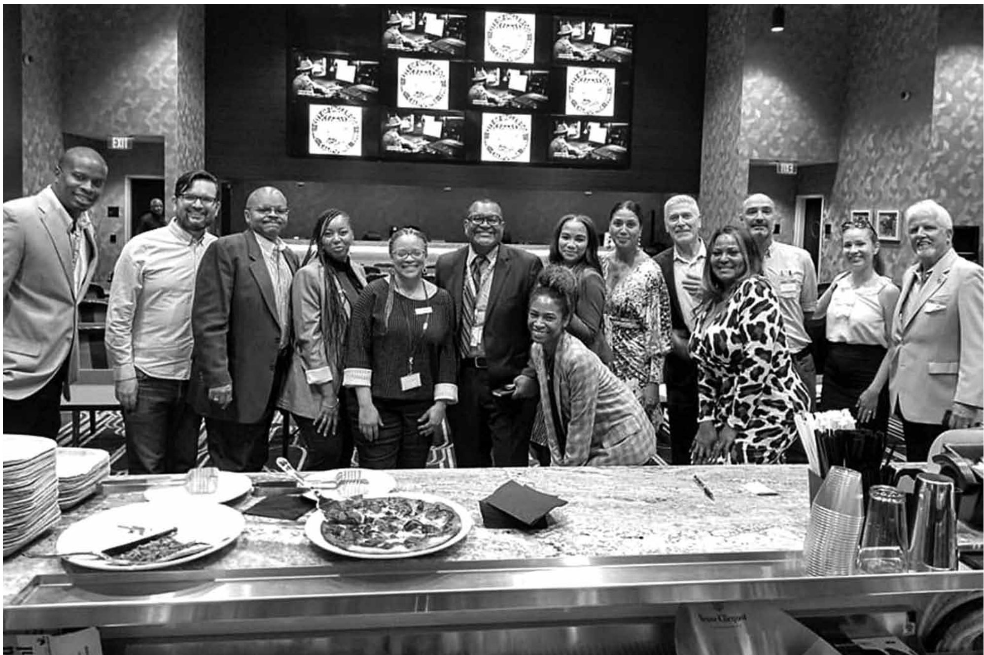
On Sept. 30, the City of Inglewood hosted commercial property agents, brokers and owners for a mixer at Hollywood Park Turf Club entitled "Location: Inglewood." The mixer served to inform and update this group on development activity in the City that could help them market their properties. The event will be repeated every six months.