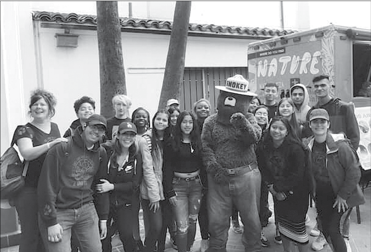
Hawthorne High School English language development students recently gathered to learn how to take the Metro and about nature conservation.