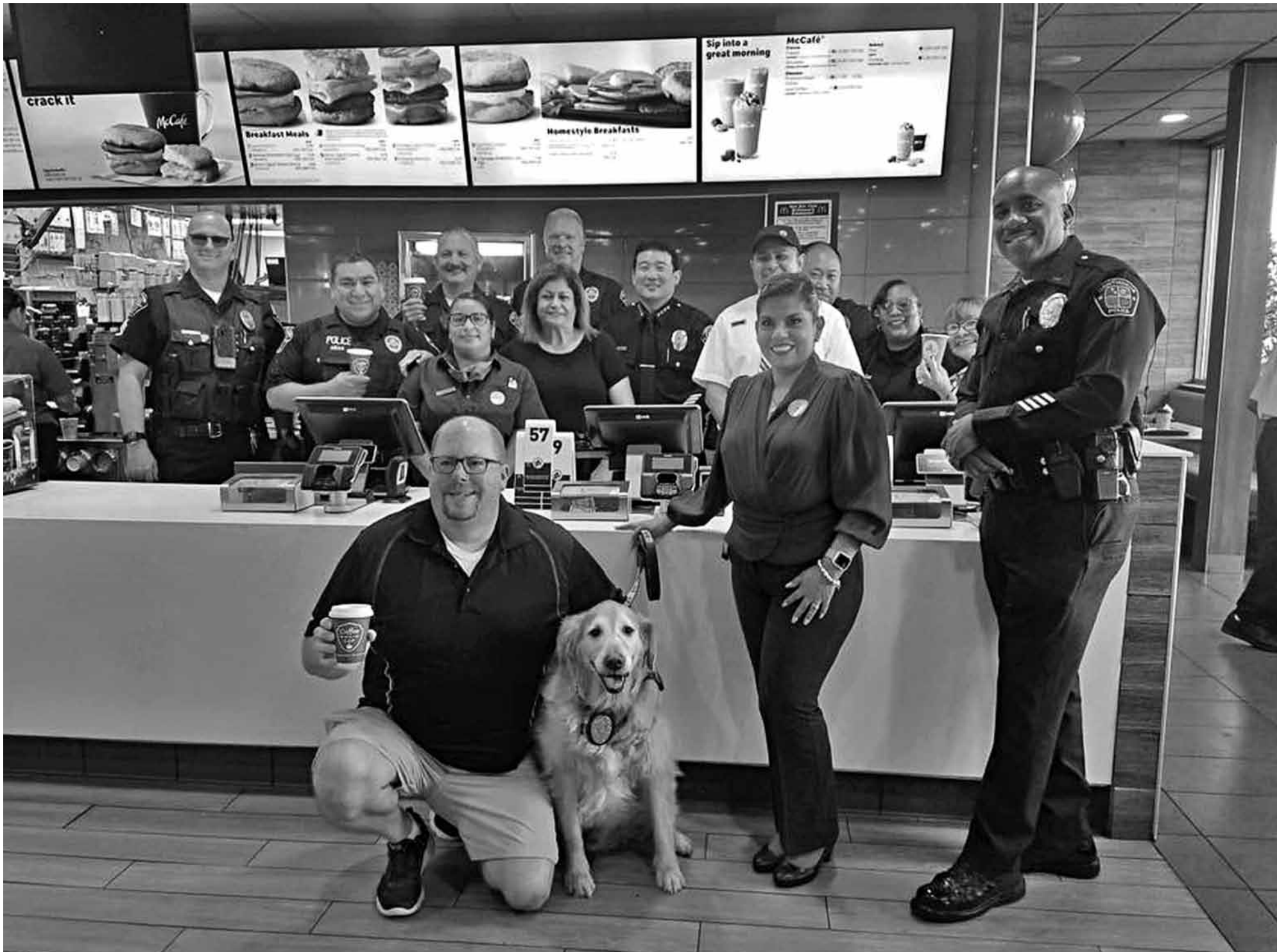
Last week, community members came out to take “mug shots” with Hawthorne PD officers during another well-attended Coffee with a Cop event.