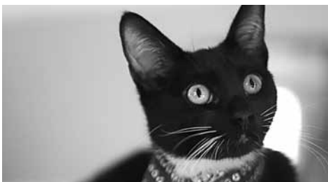
manages to find the softest and darkest place to nap in the whole house. She spends most of her day napping, though she's not above running around the house with other cats, or even sneaking up and sniffing the dog when the fancy strikes her. She gets along well with her cat friends and with a small relaxed dog at her foster home. Because she's a shy girl, she would likely thrive in a household where she can get most of the attention all to herself.

Dahlia just loves belly rubs. She loves them so much that she is likely to give you a dirty look when you stop. Dahlia is a mellow, relaxed, gentle and quiet kitten who always