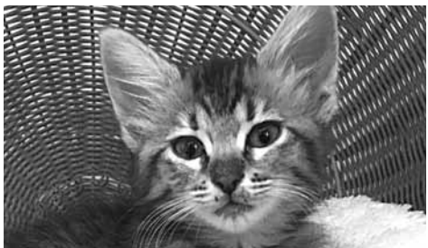
gentleman. He is both talkative and playful, and loves being the center of attention. Rufus is FIV positive, another likely legacy of life on the streets. Fortunately, FIV is not casually transmissible between cats. It requires a deep bite wound that is rather unheard of in a home setting and certainly not with a gentle love like Rufus. There's a fair amount of bad, superficial information floating around the Internet about FIV and the veterinary community typically takes an extremely risk-averse approach to it as it's simpler than explaining the nuances to their clients. If you're interested in meeting Rufus or in adopting him, or have any questions about FIV, please reach out to his foster dad. Rufus is such a special soul. We promise you will not regret it!

Rufus is a dapper, genteel creature who was rescued off the streets. He is the quintessential gentle tom cat: big cheeks and sweet demeanor -- and he gets along great with other cats so long as they are nice to him. Mostly what he wants is to follow you around for pets and head bonks. However, life on the streets did instill in him a profound dislike of dogs, and he is extremely aggressive with them. With friendly cats, people, children and/or kittens, Rufus is an absolute delight and a perfect