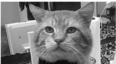
These kitties are available for adoption through Kitten Rescue, one of the largest cat rescue groups in Southern California. All our kitties are spayed/neutered, microchipped, tested for FeLV and FIV, dewormed and current on their vaccinations. For additional information and to see these or our other kittens and cats, please check our website www.kittenrescue.org or email us at mail@kittenrescue.org .

Your tax-deductible donations for the rescue and care of our cats and kittens can be made through our website or by sending a check payable to Kitten Rescue, 914 Westwood Blvd. #583, Los Angeles, CA 90024.