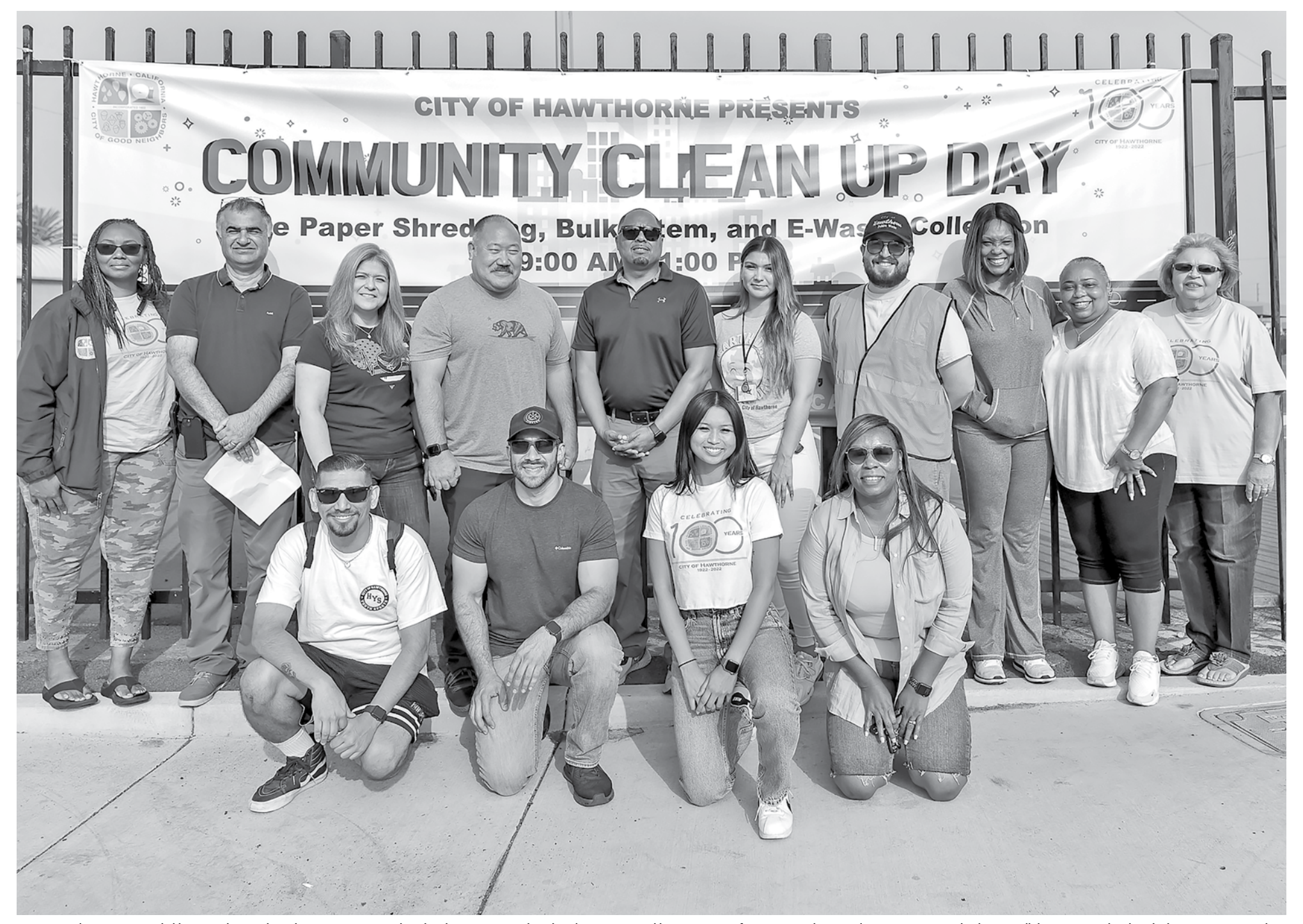
Community Clean-Up Day was held on Saturday, October 8th, 2022. Everyone gathered at the Betty Ainsworth parking lot to sign up and be sent to a specific area in Hawthorne to clean up our City. Big thank you to all that participated and made this event a success.