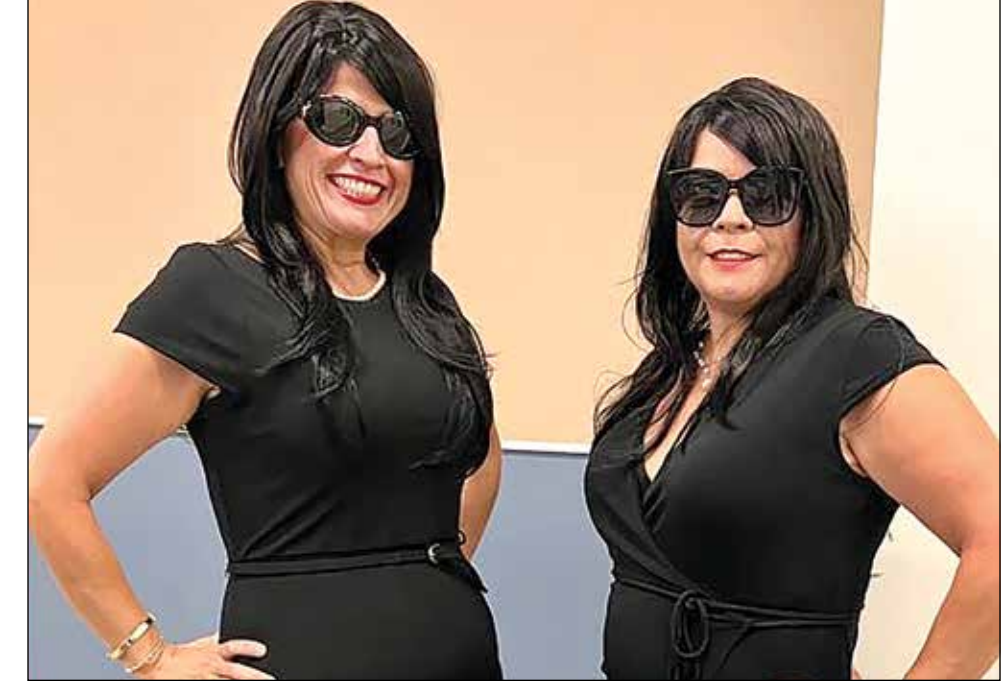
Cardinal ROCKStars looked great with their twins and groups. This was just one of the fun events during Spirit week.