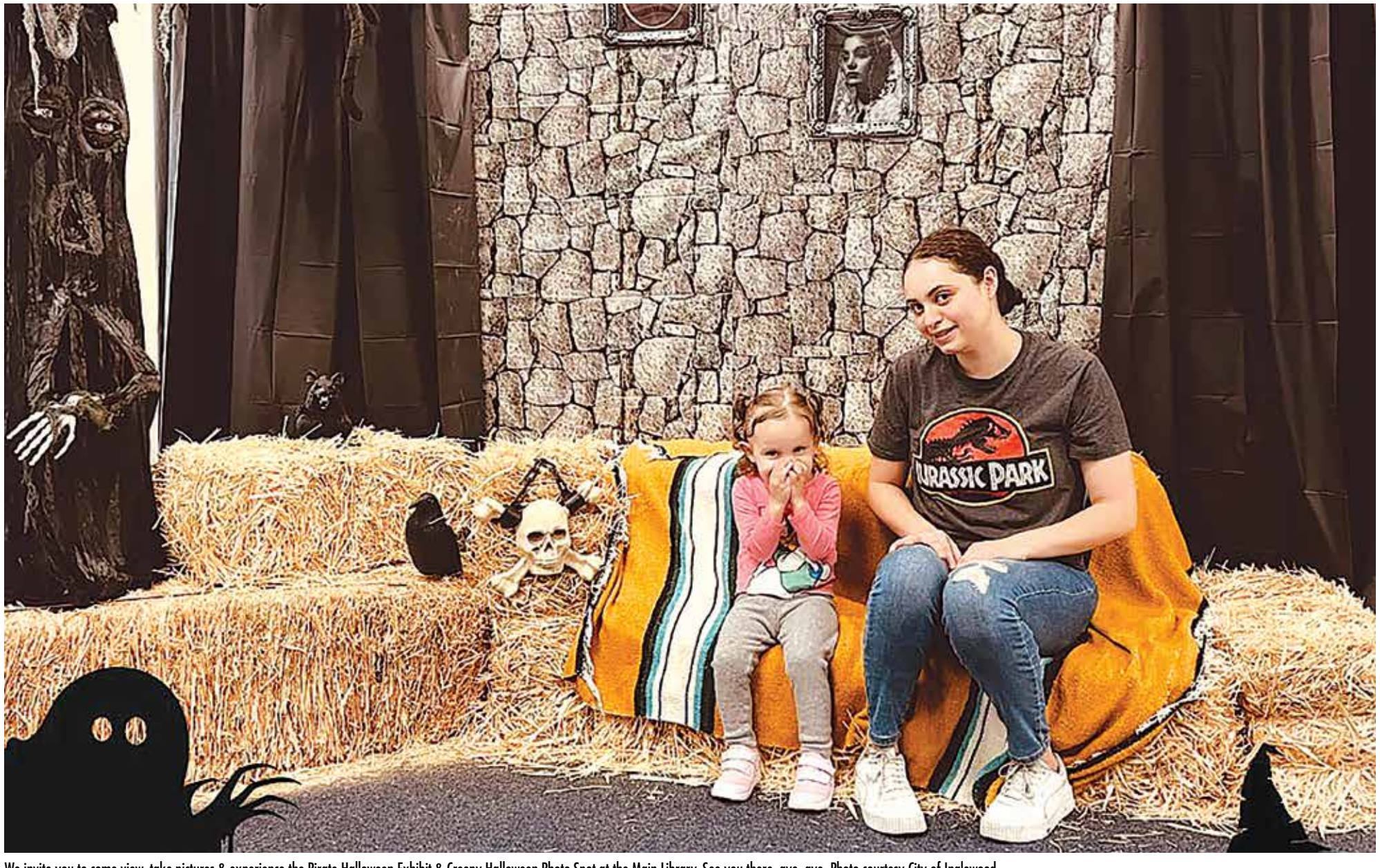
We invite you to come view, take pictures & experience the Pirate Halloween Exhibit & Creepy Halloween Photo Spot at the Main Library. See you there, aye, aye.