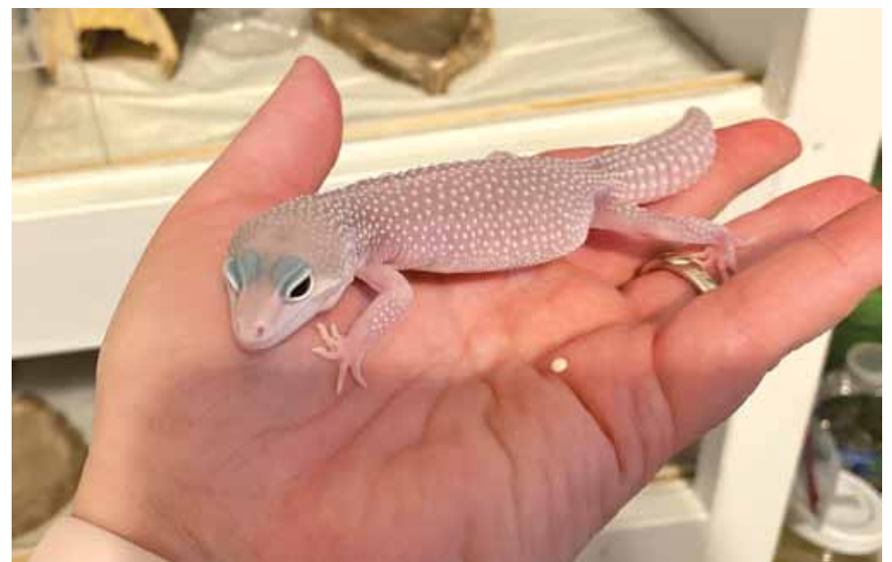
A pink leopard gecko in front of the rack system set up in her closet.

For all your leopard gecko needs here in El Segundo, Alyson Gibson is the person