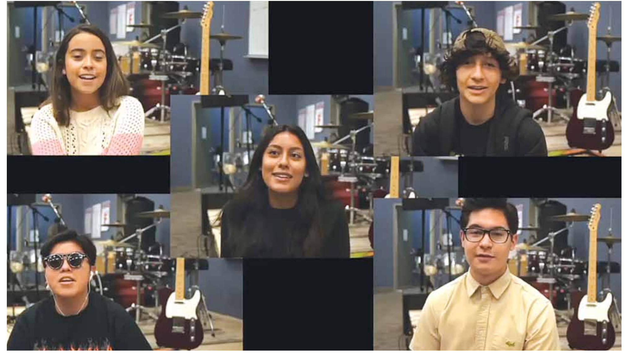
Through the Commercial Music Pathway, students will explore various careers in the modern music recording and live performance industries. By learning to use music as a communication tool, the pathway will teach students how to utilize sounds to convey specific emotions, understand music theory, and develop instrumental, technical, organizational, and managerial skills. All courses focus on Work Based Learning by taking a practical and hands on approach to instruction, the pathway will help students build competency in popular modern instruments (i.e. drum-set, keyboard, bass, and guitar) and gain experience presenting and performing in public.

"Music is a moral law. It gives soul to the universe, wings to the mind, flight to the imagination, and charm and gaiety to life and to everything."