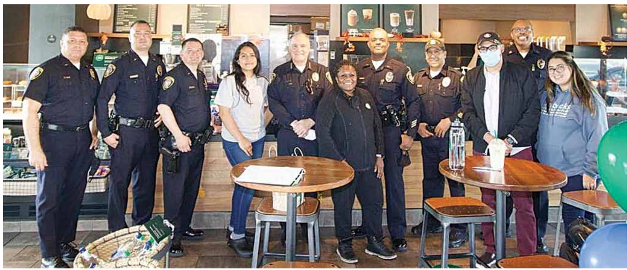
Thank you to those who got together for National Coffee with a Cop day. Our officers had a good time engaging with community members. Much thanks to Starbucks and their store managers for hosting a great event.