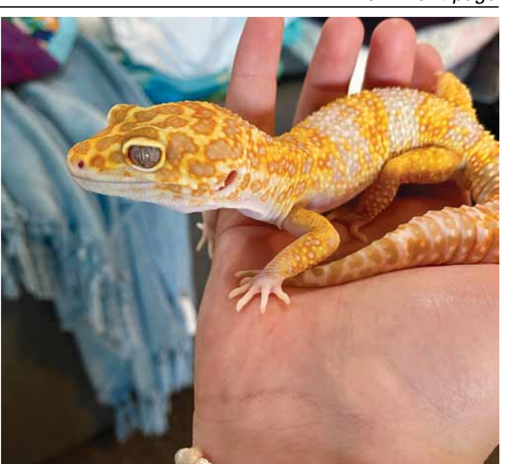
Leopard geckos can have brilliant colors and patterns.