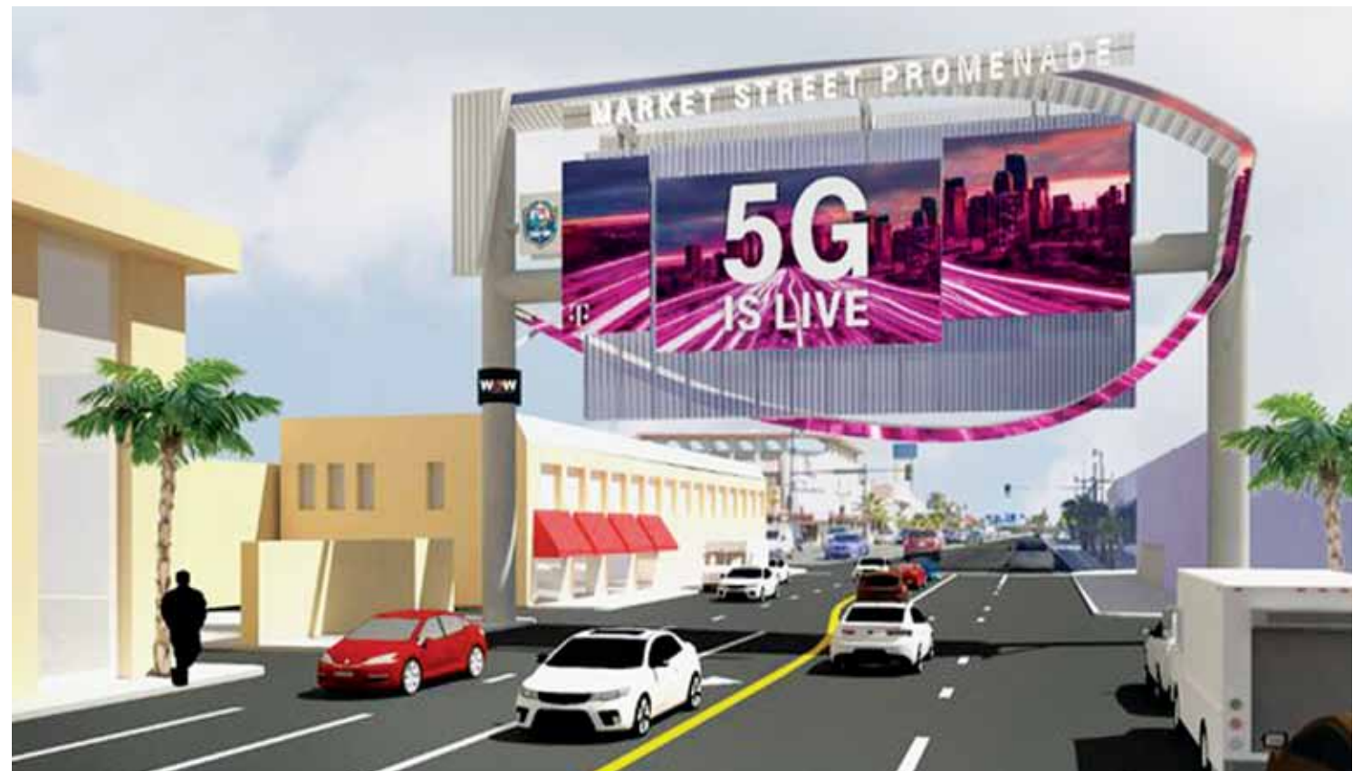
The billboard will consist of three individual offset display panels made of LED screens all warped within a curving ribbon of light-emitting diodes. The billboard will display the city of Inglewood seal along with City of Champions branding and will mark the entrance to Inglewood's Market Street Promenade.