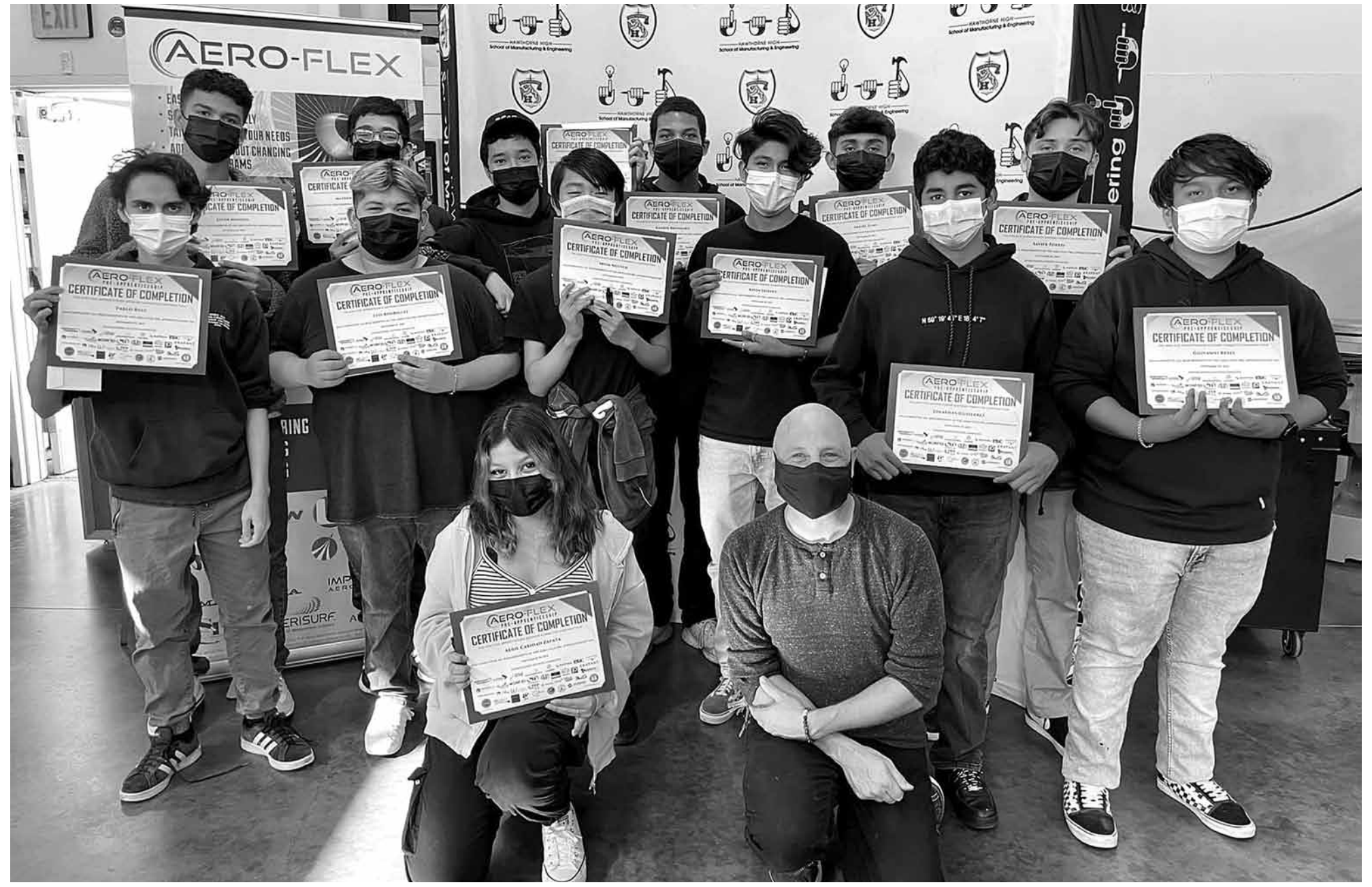
We are so proud of our Hawthorne High School of Manufacturing & Engineering students who completed the industry-recognized South Bay Workforce Investment Board - SBWIB Aero Flex Pre-Apprenticeship Program. These dedicated students are now prepared for an aerospace program in college or proceeding directly into an aerospace career after graduating high school.