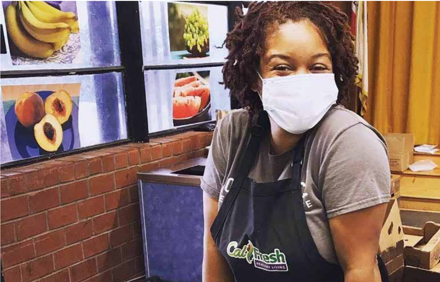
Through this new partnership with LA Public Health, the grant will help strive for food justice. During these times of COVID uncertainty, availability of healthy, affordable food and maintaining good health cannot be added to the list of worries.