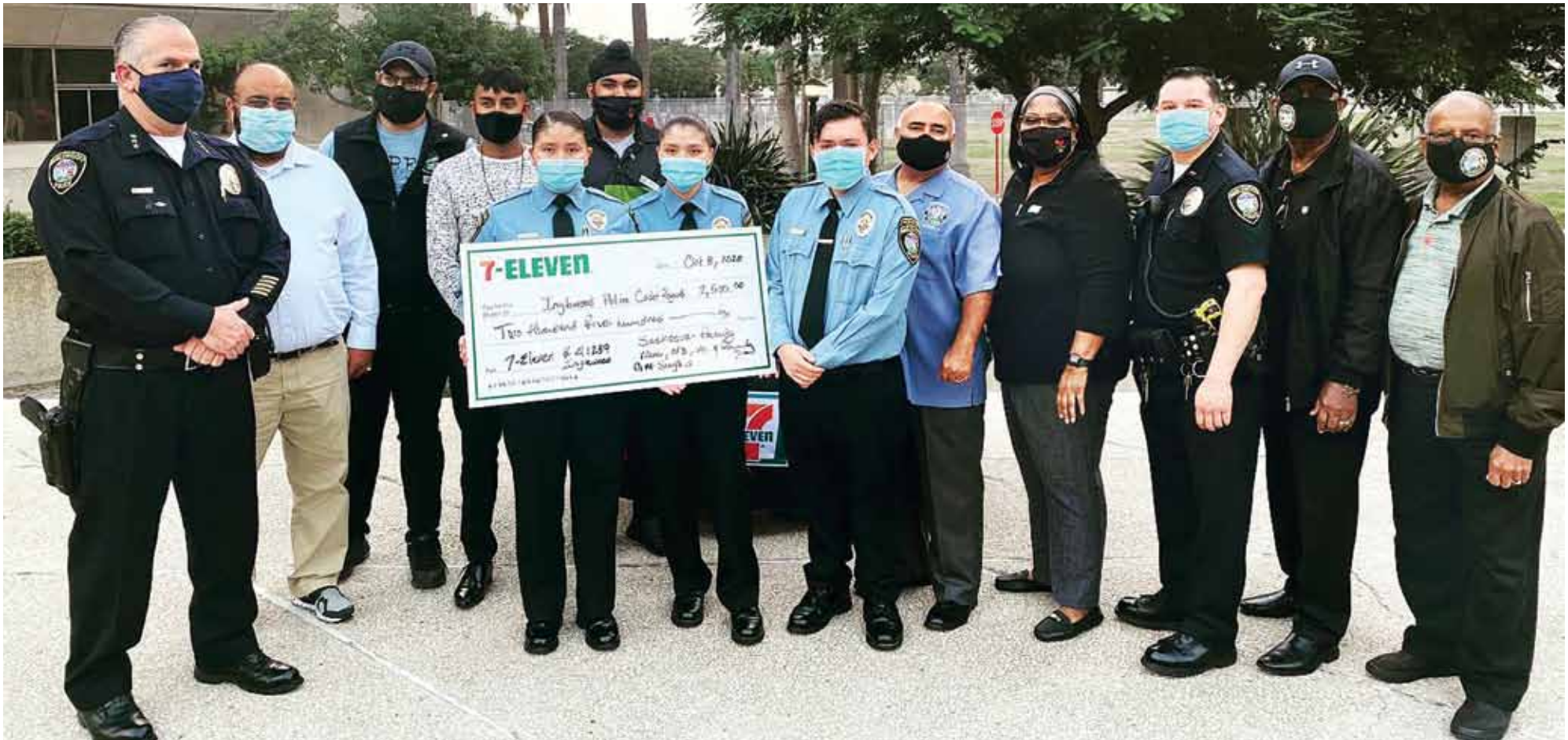
A big Thank You to the Sachdeva Family and 7-Eleven for their generous donation to the Inglewood Police Department's Explorer Program. Your donation will help youth make a difference in the community.