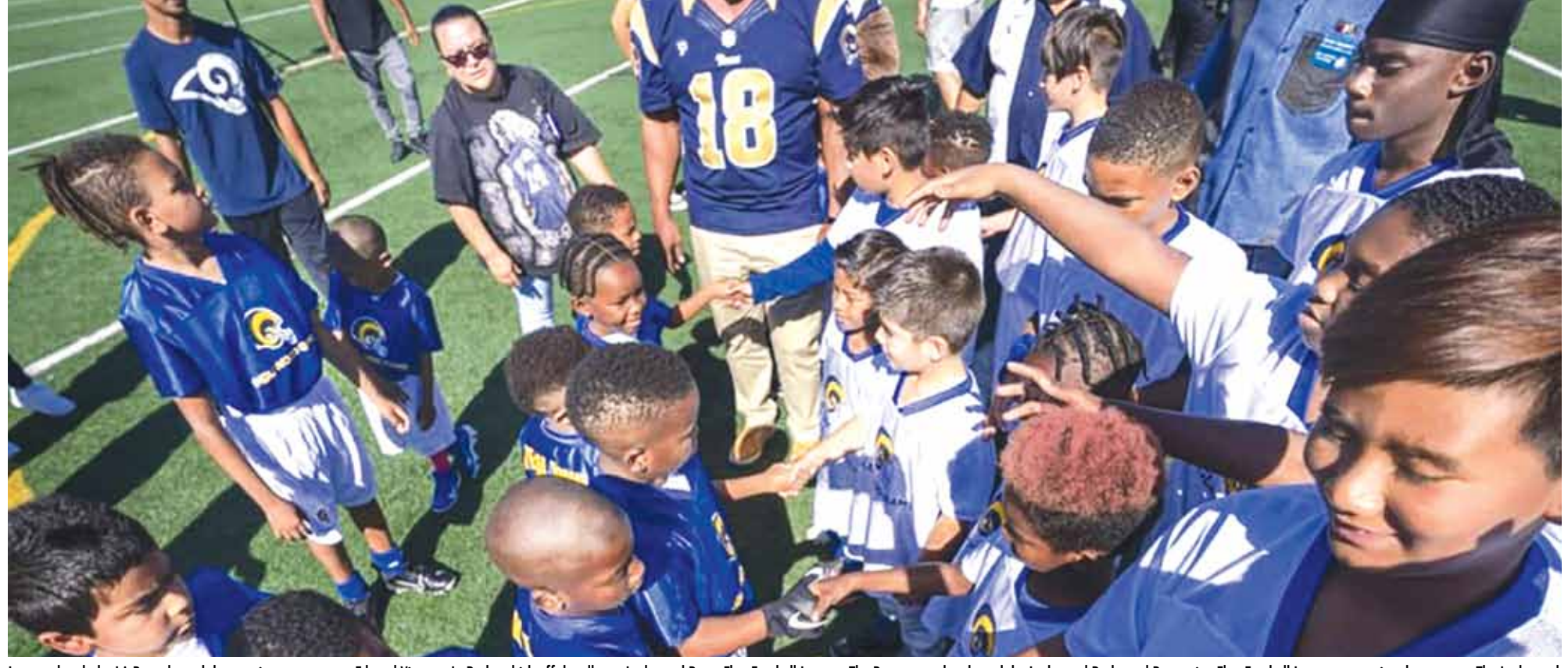
Last weekend, the LA Rams hosted the opening ceremony at Edward Vincent, Jr. Park to kick off the all-new Inglewood Rams Flag Football League. The Rams recently adopted the Inglewood Parks and Recreation Flag Football League, renaming the program The Inglewood Rams. The league will consist of 22 teams with more than 260 youth participants (ages 5-12). Additionally, the Los Angeles Rams will fund all football components of the Inglewood Rams program, including uniforms and equipment.