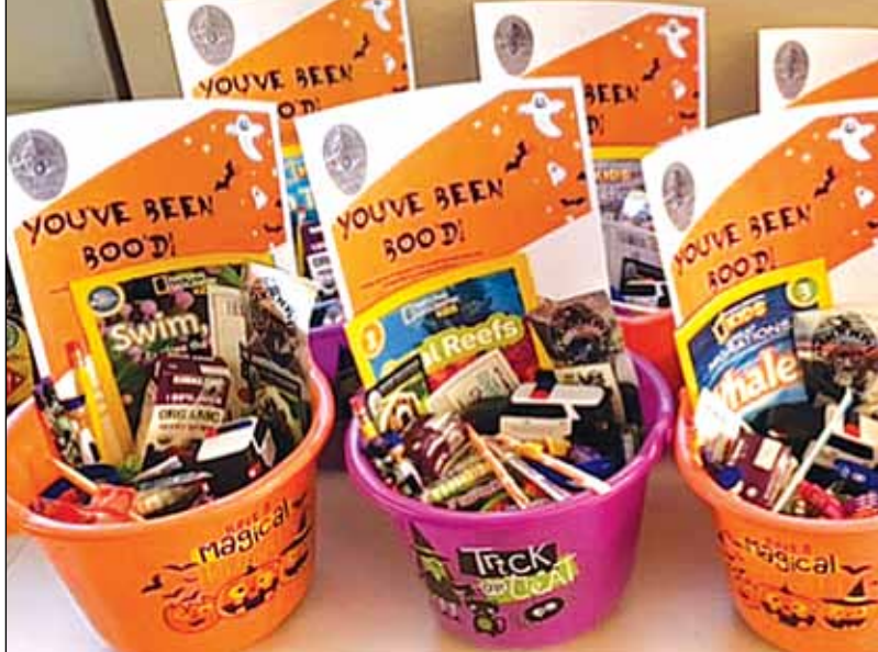
The Hawthorne Police Department will be doing the Halloween, "You've been Boo'd" challenge for 10 neighborhood kids in our city. We are recognizing kids with the help of your school principals and teachers. From good grades, attendance, etc. Look out for a basket of treats from the Hawthorne Police Department. We're also challenging other PD's. If we tagged you, you're it.