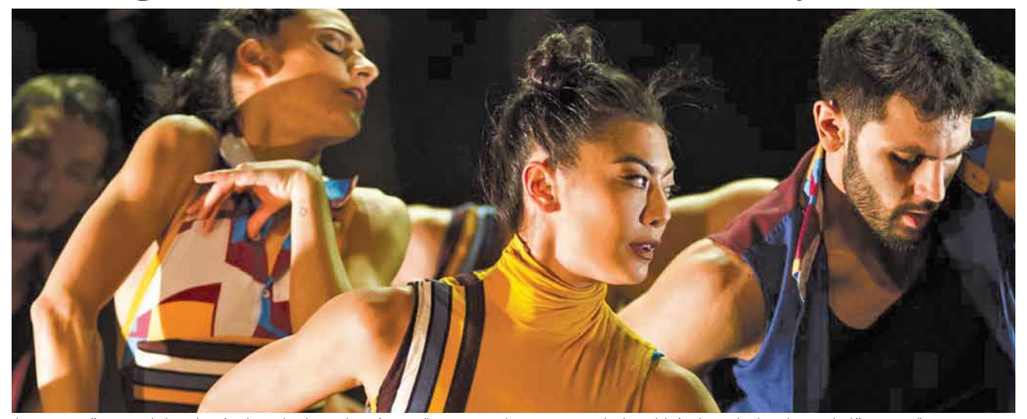
The Music Center is offering its second online production from their "Inside Look" series, this time featuring Ballet Hispánico's program is 34 minutes long but it includes four choreographies that can be presented at different times. Ballet Hispánico's program is relevant to Dance, Physical Education, Music, History/Social Studies, and Visual Arts. The works featured are a fusion of ballet and contemporary dance inspired by traditional arts forms such as Flamenco, Mariachi, and Afro-Cuban music and dance. Members of the company provide insights on the historical context as well as the creation of each choreography. At the end of the program, the Artistic Director teaches a fun Merengue routine that everyone can do at home (or in the office). This program is in alignment with our district-wide arts integration endeavor. It is an excellent program offered at no cost to teachers, students, and families. Enjoy. To watch the program go to: https://bir.ly/3oqXD9P.