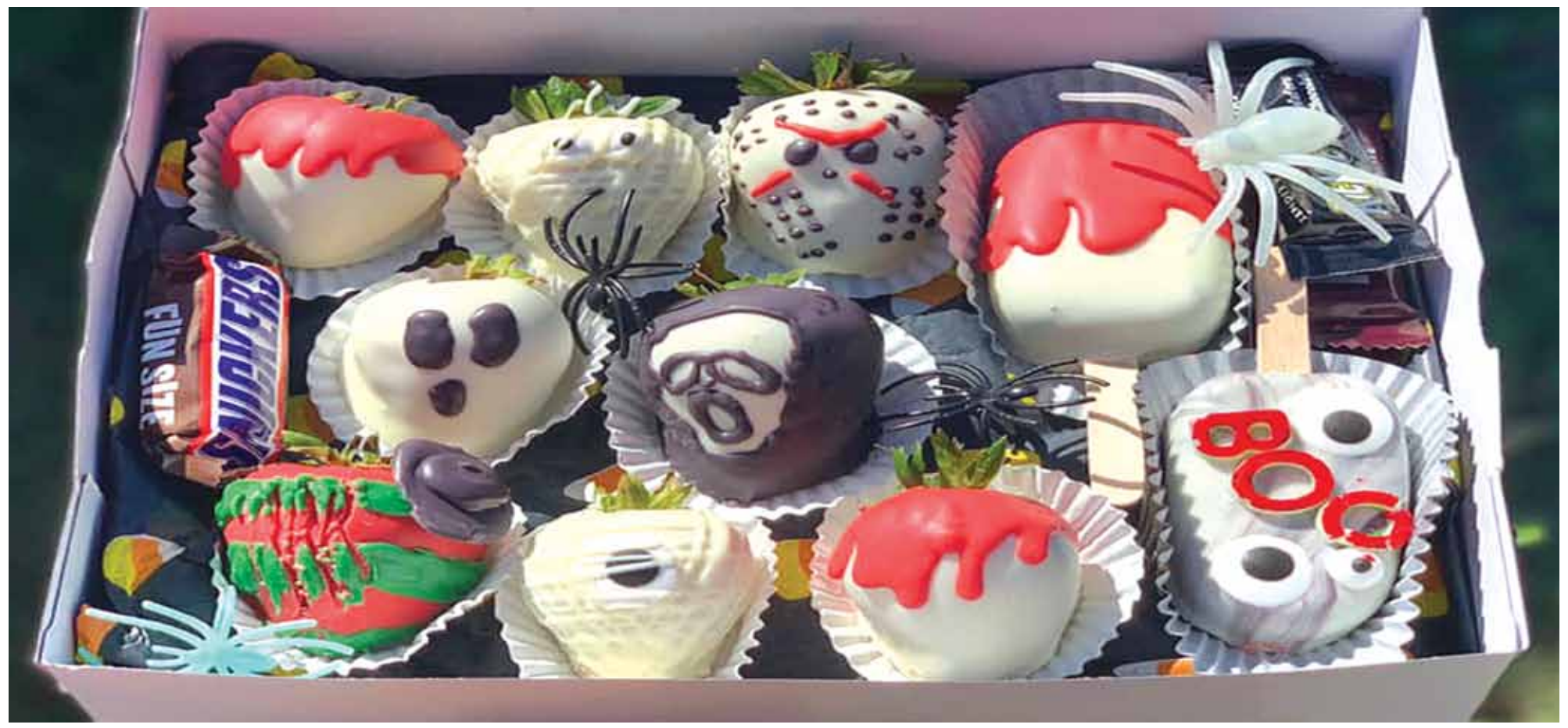
Kendollx Strawberries is creating "Spooky" arrangements for Halloween. What a fun, creative and healthy alternative to candy.