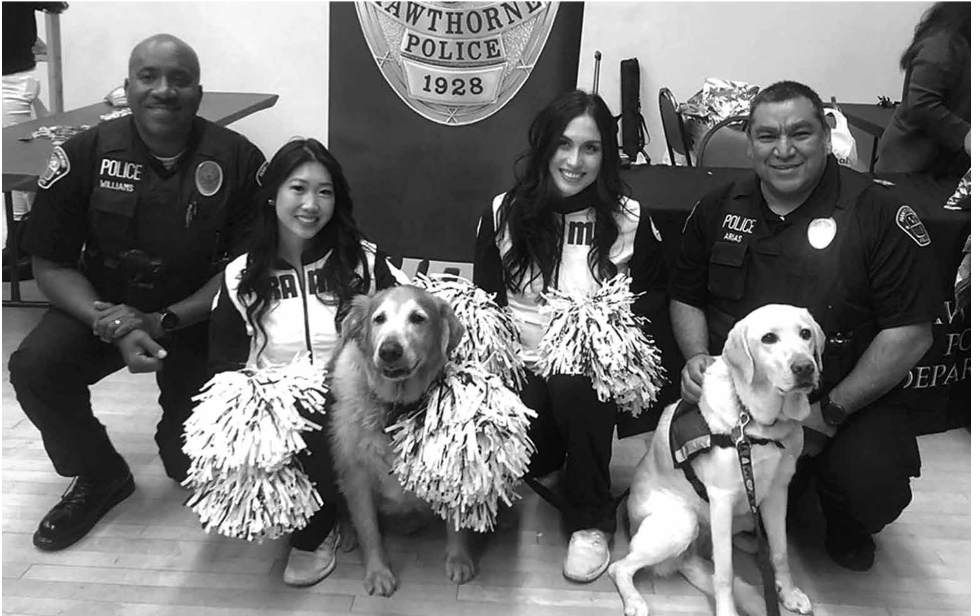
The Hawthorne Police Department said a big thank you to its community partners LA Rams Cheer and LA Kings Ice Crew for making the Halloween Safety event a huge success!