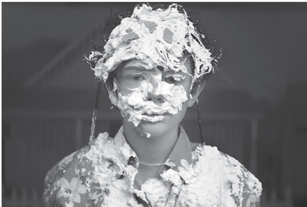
Honey Boy

Young Otis, whom we first encounter as he is harness-strapped in the middle of an action stunt, is the lead on a children's television show. But this success doesn't extend to his personal life, where he is raised by an erratic father (Shia LaBeouf), whose mile-a-minute mouth is either teasing, goofing or berating his son in the close quarters of the extended-stay motel where they live. As young Otis,