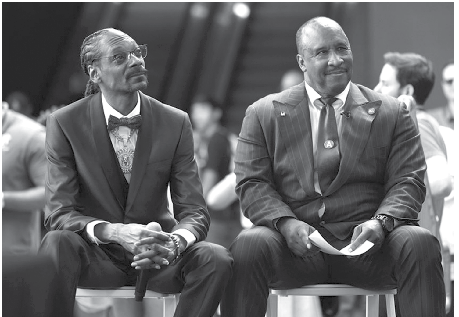
On Saturday, Nov. 2, the Los Angeles County Metropolitan Transportation Authority (Metro) celebrated the completion of the $350 million New Blue Improvements Project. Inglewood Mayor James T. Butts, who was sworn in as the new Metro Board Chairman, hosted the kickoff of the new A Line Station with Hip Hop icon Snoop Dogg.