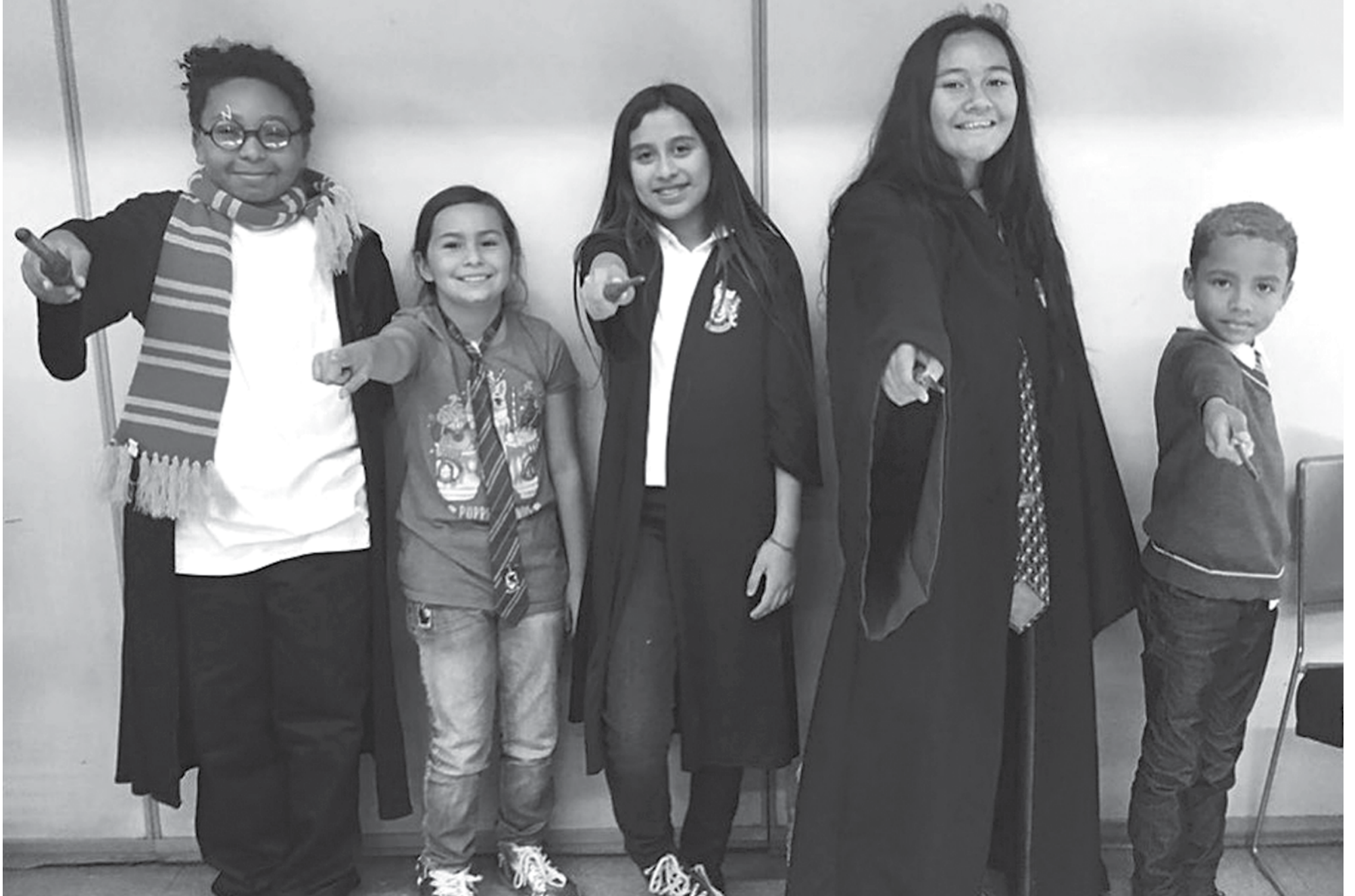
The witches and wizards at Lucille J. Smith Elementary School had a magical time celebrating Halloween in the RAP before and after school program.