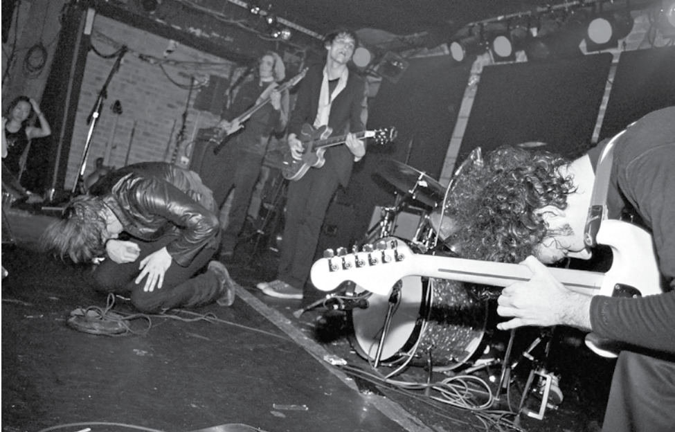
Meet Me In Bathroom.

feelings, traveling back in time. There are no modern day interviews spliced in, which feels totally transportive to the era. With incredible never-before-seen footage, we see what it was to live in New York on the cusp of the new millennium, pre-internet and pre-9/11. As the doc shows, a few bands—looking for a new kind of rock music—emerged with a “new cool” rock aesthetic, born out of the true indie music scene. The Moldy Peaches, Yeah Yeah Yeahs, and of course, the band that would almost single-handedly explode the scene, The