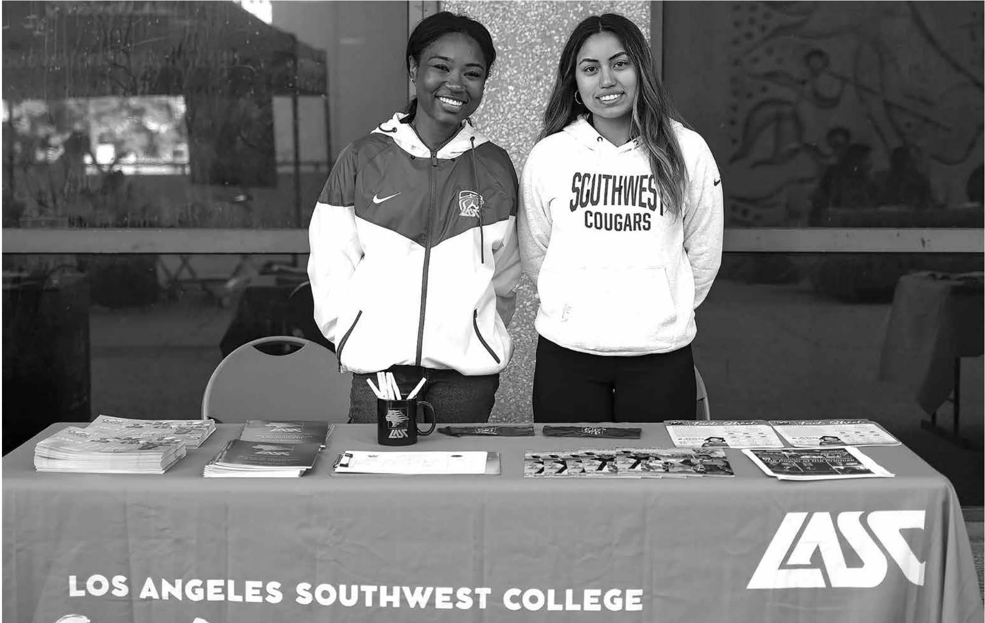
Super shout out to our community partners Grow Ready Org (GRO) and AADAP's Youth United in Creative Action (YUCA) for their commitment to empowering our young people. Our Champions for College Fair at Inglewood Public Library was a success.