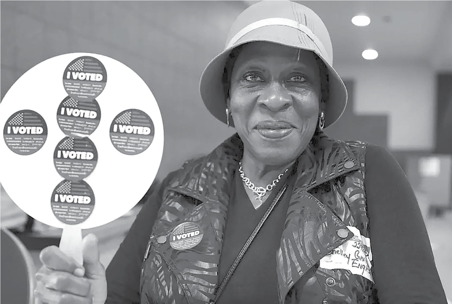
General Election Day '22 finally arrived on Tuesday, November 8. The citizens of the South Bay Cities have made their voices heard. Thank you to everyone who came out to vote.