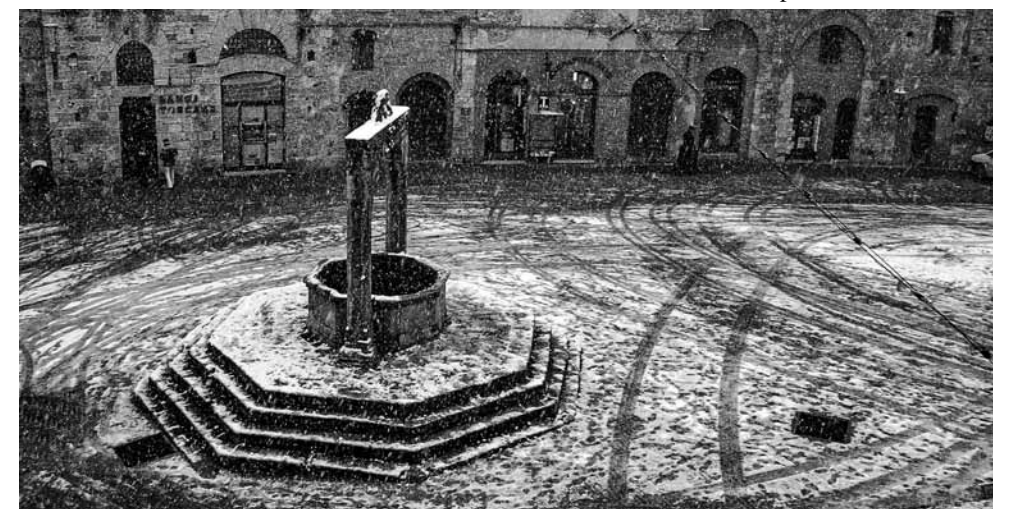
Storm of the century — piling on the snow New Year 's morning in San Gimignano.

The best part of the trip was that we never had to wonder again if either of us could roll with the punches. It didn't hurt that we were