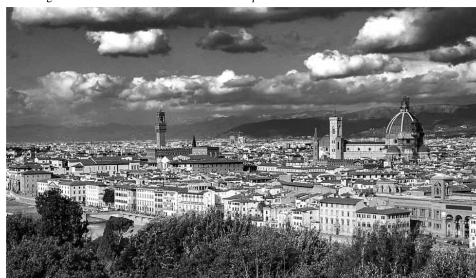
Firenze: Henry Moore meets Michelangelo in the legendary view from the Belvedere.