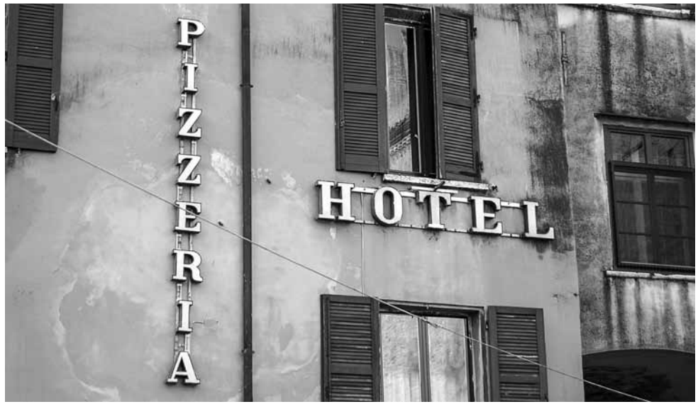
Mantua: A bed is a bed is a bed. Or is it a pizza?