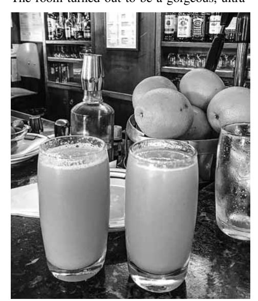
Venezia: Peaches and Prosecco—the original Bellini waiting on the original Harry's Bar.

San Gimignano: Arrived late at the height of the storm to find all but two hotels closed and exactly one room left in the entire town. The room turned out to be a gorgeous, ultra-