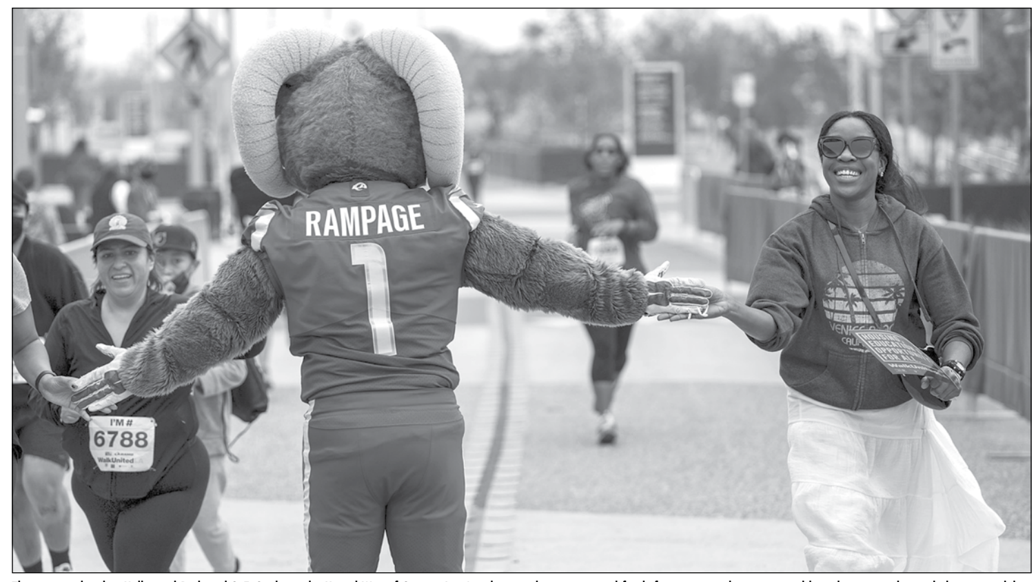
This past weekend at Hollywood Park and SoFi Stadium, the United Way of Greater Los Angeles raised awareness and funds for programs that aim to end homelessness and provide housing stability, quality education, and economic mobility. We are so proud of all the participants and sponsors.