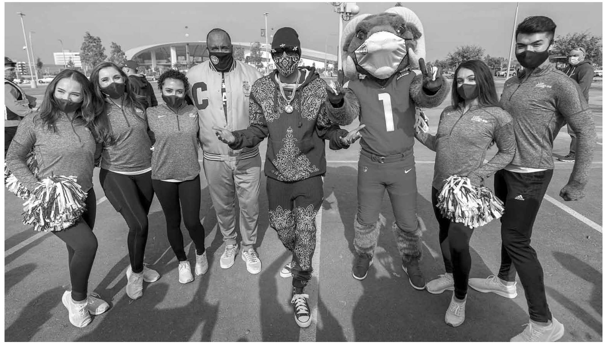
Thanks to Pepsi and Snoop Dogg over 2000 Inglewood families received a Free Thanksgiving Turkey and trimmings for their holiday meals last year. The City of Inglewood Turkey Giveaway Presented By Pepsi will host its annual Free Thanksgiving Drive-Thru Giveaway with Snoop Dogg on November 23, 2021 at Hollywood Park CA. To register to receive a turkey, visit https://bit.ly/3jX4m18