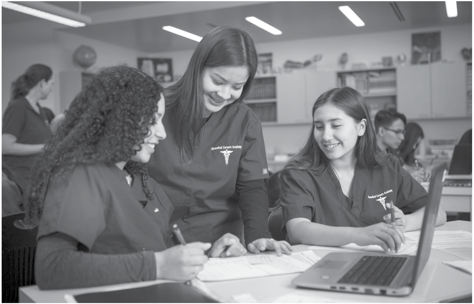
The Biomedical Careers Academy at Lawndale High School strives to provide students with the experience, skills, and knowledge necessary to pursue a career and/or further education in the biomedical sciences after high school. What a great way to jump start your future career.