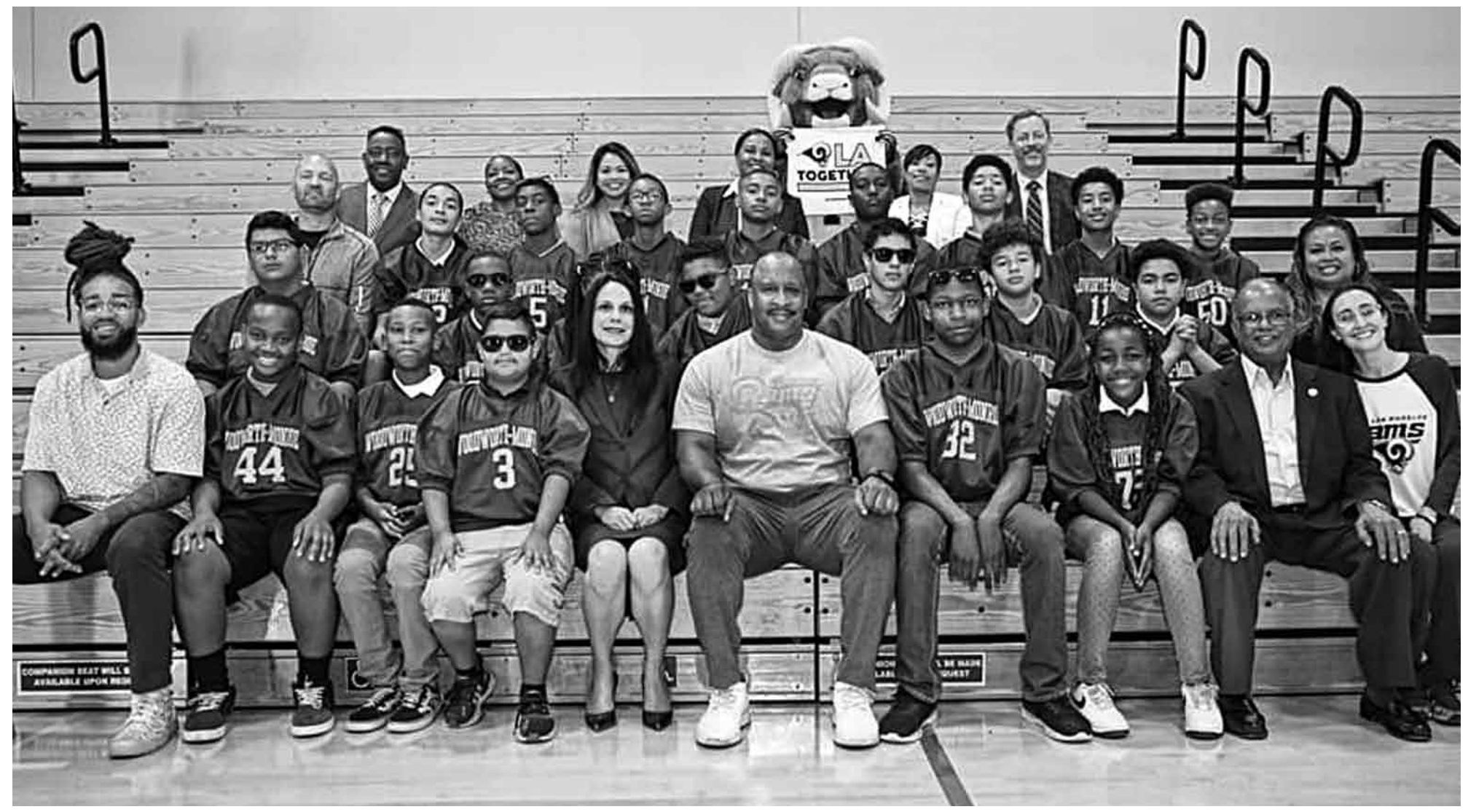
The City of Inglewood in partnership with the Los Angeles Rams donated brand new football uniforms last week to the Monroe-Woodworth flag football team.