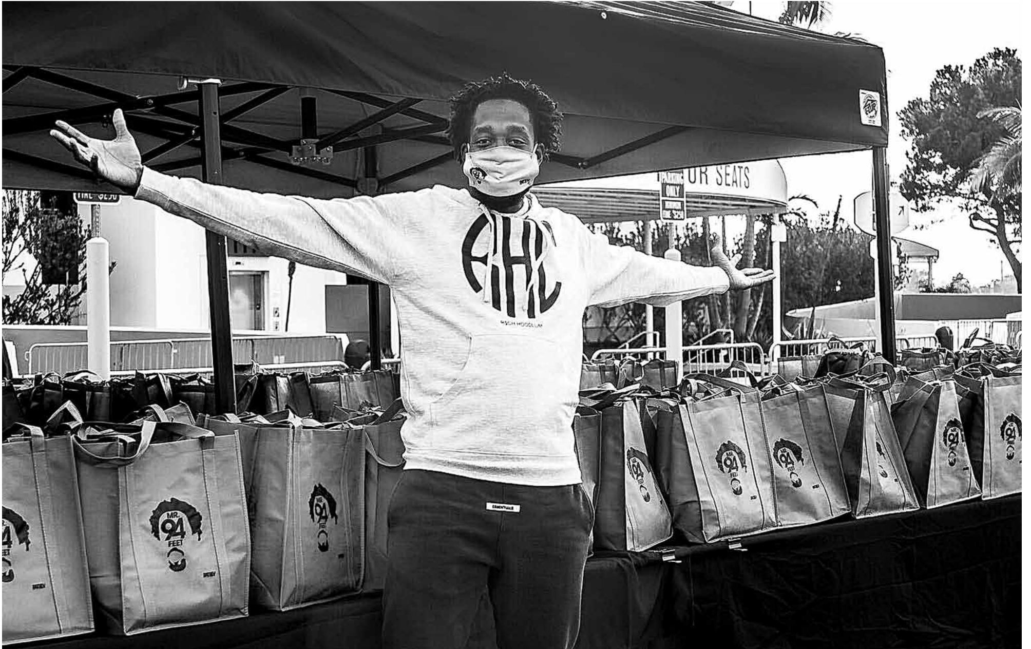
Man of the people, L.A. Clippers' Patrick Beverley, handed out 200 turkeys in a drive-thru giveaway to local families for Thanksgiving. Thank you to Patrick Beverley and the Forum for helping our community.