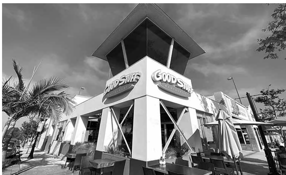
Good Stuff Restaurant Located at 131 W Grand Ave. in El Segundo