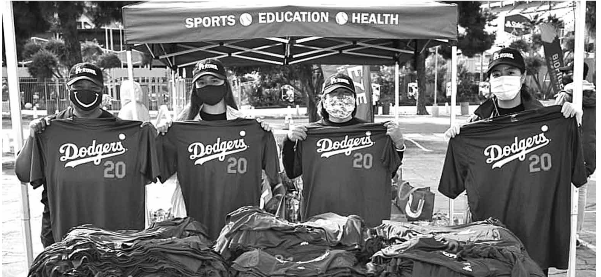
The Los Angeles Dodgers Foundation helps tackle the most pressing problems as they go the distance to improve education, health care, homelessness, and social justice for all Angelenos. All runners this year received a Dodgers '20 tech shirt, finisher medal, and Limited Edition Dodger Run Bobblehead prior to race day at a special drive-thru packet pick-up at Dodger Stadium.