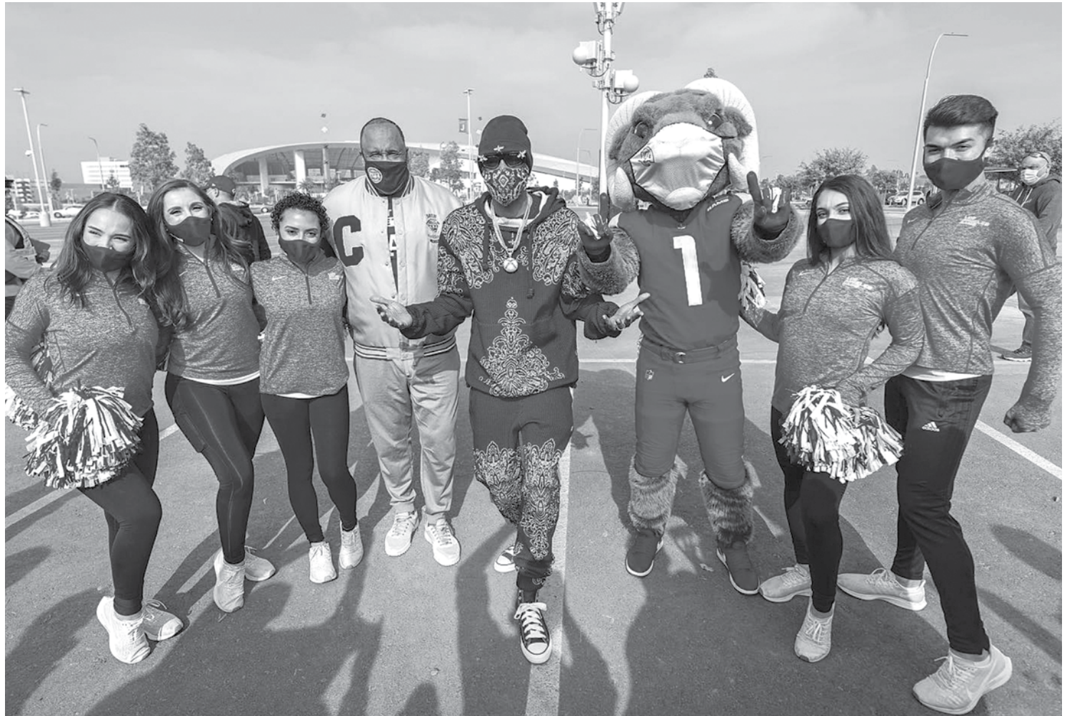
The City of Inglewood Turkey Giveaway was presented by PepsiCo at SoFi Stadium. Special thanks to our beloved Snoop Dogg for always showing love to the City of Champions. The drive thru event provided holiday meals for over 2000 families. Thank you to all the partners and volunteers who made this event happen.