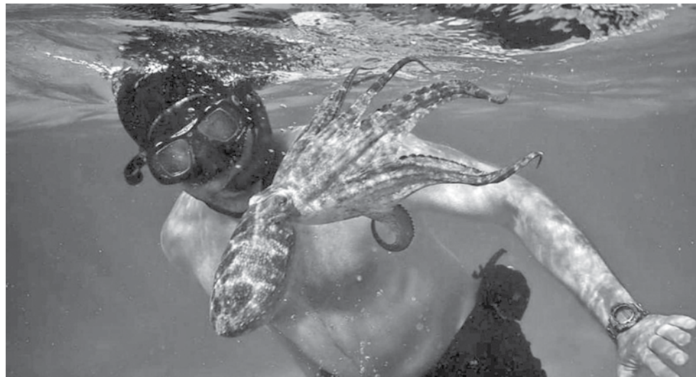
My Octopus Teacher

technologically-advanced time in history, we're turning for answers from silent ocean-dwellers (although its intelligence may rival our own—octopi have a brain in each of its eight tentacles!). My Octopus Teacher rings so powerfully at a time when some of our highest elected officials reveal a remorseless hypocrisy in the human spirit, that we re-direct our efforts to find answers to life's questions with one of life's most prehistoric creatures.