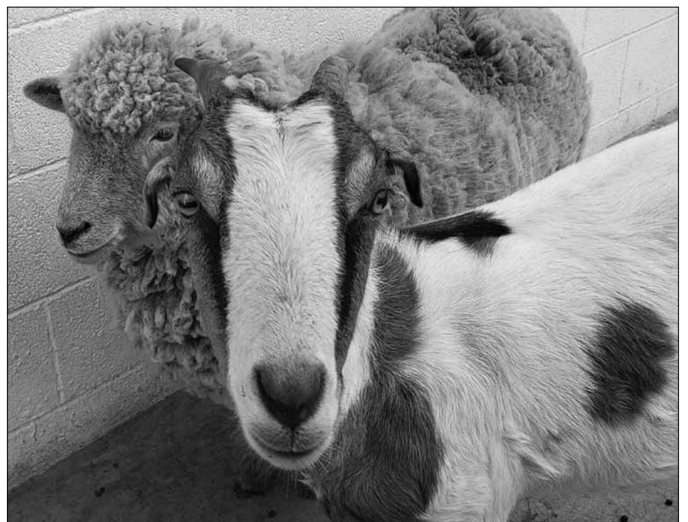
Benny and Joon

animals. Recently the shelter received a bonded pair, Benny & Joon who happened to be a goat and a sheep! No matter the creature, spcaLA South Bay Pet Adoption Center will care for them until it is time to find them a more permanent residence. In Benny and Joon's case, they are now happily living at a farm animal sanctuary. Help us help them! Please donate to spcaLA to help care for ALL the animals that come our way at spcala.com/donate . •