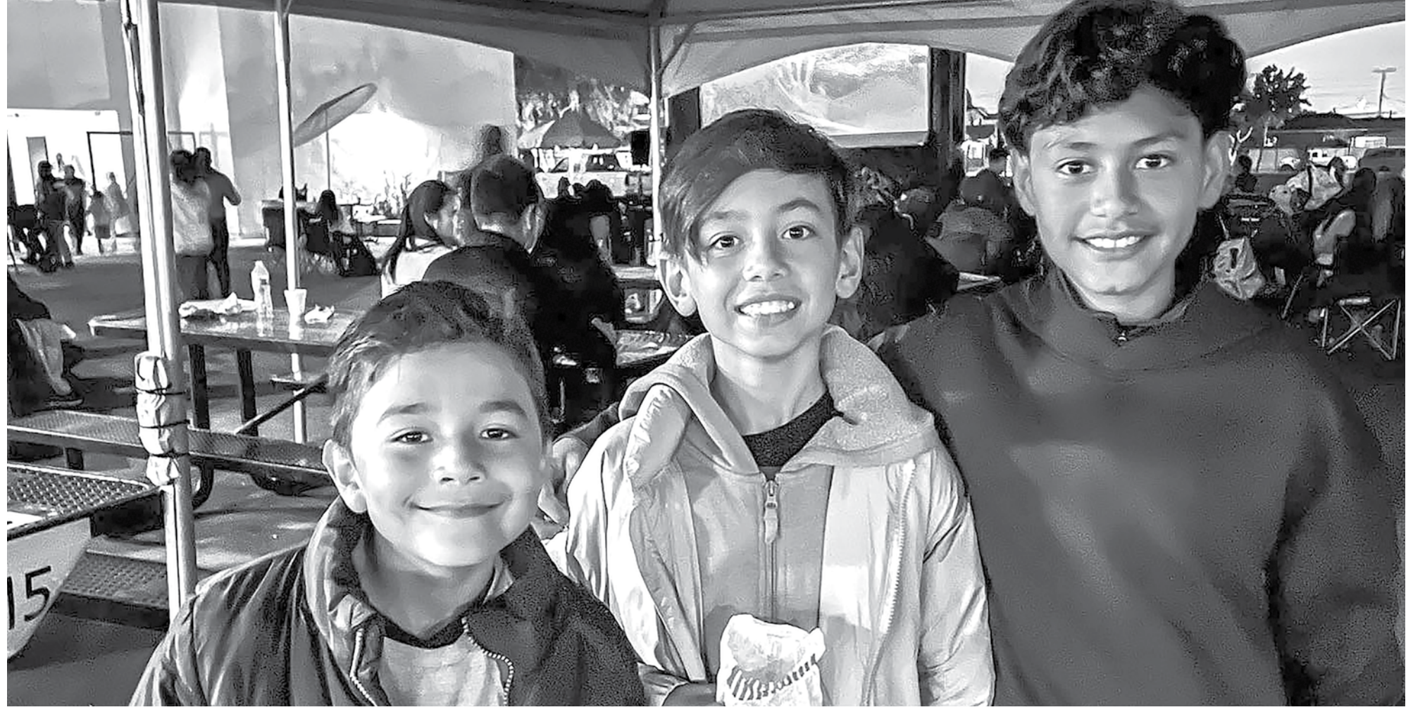
A big thank you to our Smith PTA and Staff for our 2nd Annual Family Movie Night. There was an amazing turn out by our cheetah families.