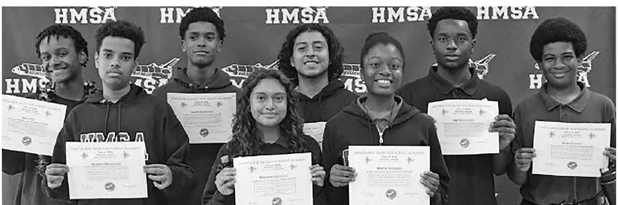
We are so proud to recognize our MARK award winners for their outstanding leadership traits at HMSA. Our MARK (Motivation, Accountability, Respect, Kindness) program was initiated to promote and recognize the development of such characteristics among our students.