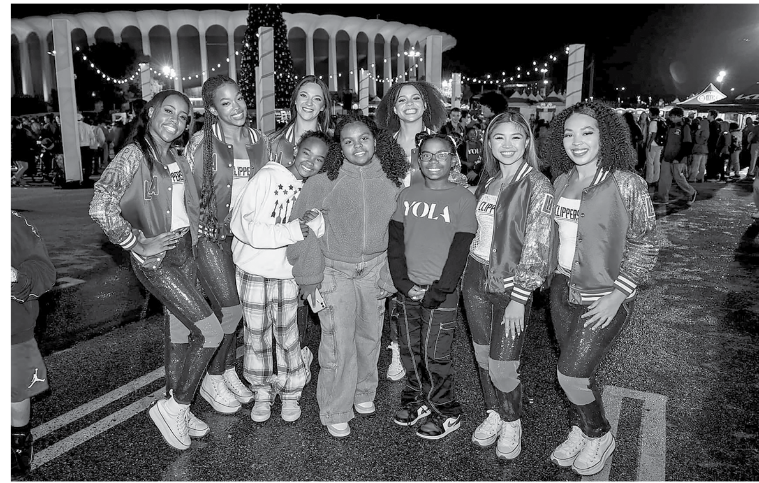
The night at the Kia Forum was filled with music, laughter, and heartwarming moments that spread cheer throughout the Inglewood community.