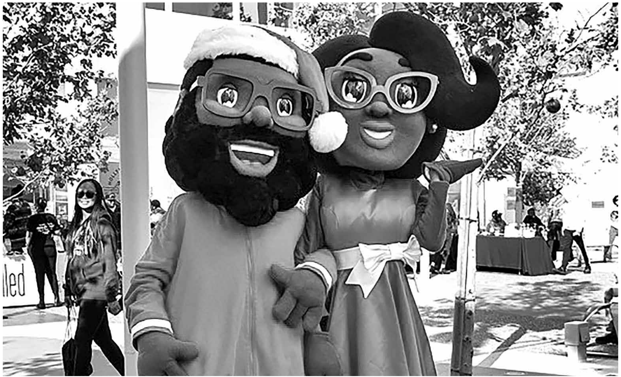
Spend the day meeting Black Santa, shopping local vendors, enjoying live entertainment, getting creative with holiday arts and crafts and so much more. The Farmers' Market with Farm Habit starts Saturday, December 2nd at 9:00 am and Winter Fest will start shortly after, at 11:00 am. More details are available at: https://hollywoodparkca.com/winterfest/.