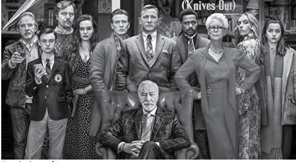
Knives Out

Knives Out offers a wildly entertaining escape from reality, like an Agatha Christie murder-mystery come to life. It does a wonderful job of introducing new twists --