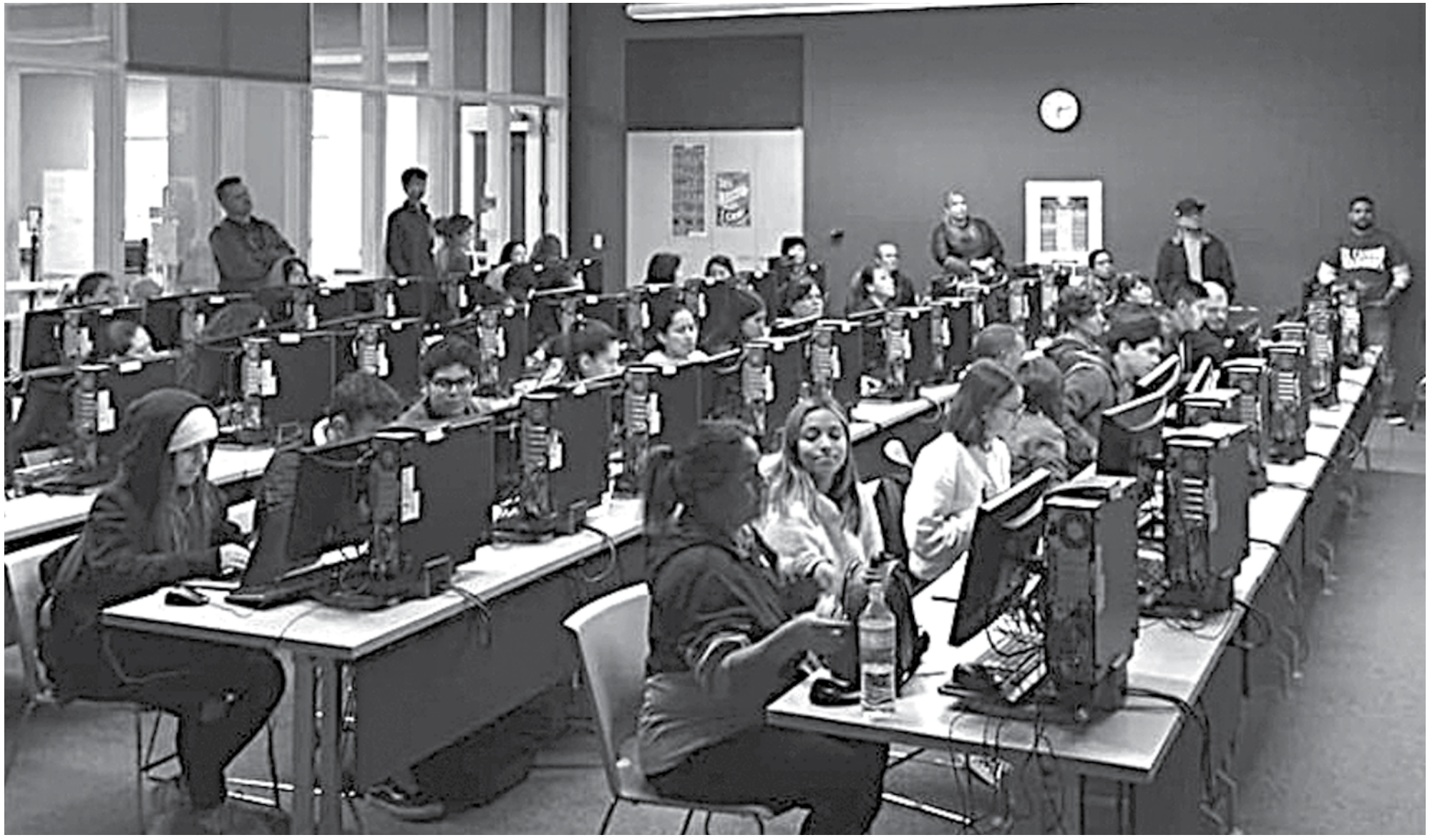
Lawndale's annual Family Financial Aid Night was a smashing success again! The rooms were packed with Lawndale High School senior families working with our counselors to get their piece of the pie! Go, Cardinals!