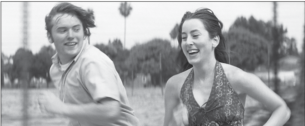
Cooper Hoffman and Alana Haim star in Paul Thomas Anderson's latest feature film, 'Licorice Pizza.'