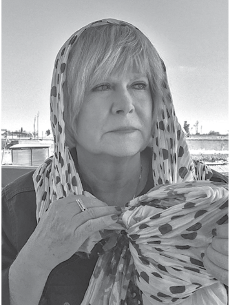
Modesty becomes her—At lunch, deep in the Medina.

We were wandering through the Souk in Marrakech one afternoon, when an American tourist exited from a shop, proudly showing off his new djellaba. The djellaba is a full-length, hooded and sleeved robe, worn by men since the dawn of North African civilization—except