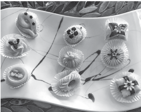
Marzipan in the Medina — If you love dessert and pistachios, the Souk is your sweet spot.

will spot the ornate early glimmerings of the future Spanish architecture—until you file into a Mosque and find a vast, empty, contemplative space free of all those Christian saints and