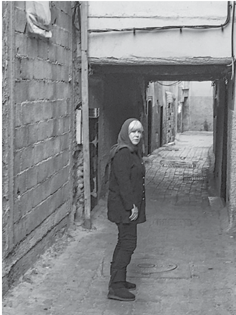
Hidden palaces in the Medina—Searching for our favorite Riad.