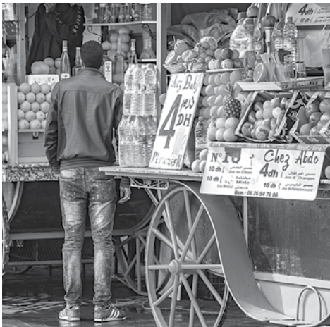
Colors everywhere, except on the orange salesmen themselves.

Atlas Mountains. Along the way, we will hopefully develop more of a taste for the cuisine. We didn't miss the bacon and pork chops, and it might just be us, but the celebrated local Tajine makes for a nicer kitchen ornament than a cooking implement. At least the way we've seen it, Moroccan cuisine lacks the angry kick of its neighbors in Tunisia and Algeria, much less the thrills and spills of the Lebanon and Istanbul. But as we say, it might just be our Asian and Francophone tastes outing us. In food, as in everything else about the country, Morocco isn't a place you digest in one quick and easy—or rude and insensitive—bite. As Mama used to say, you're your manners and leave room for seconds and dessert. Next up: In a Winter Wonderland—Travel in the Off-Season. Ben & Glinda Shipley, published writers and photographers, share their expertise and experience of their many world travels. If you have any questions or interest in a particular subject, please email them at web@herald-publications.com . •