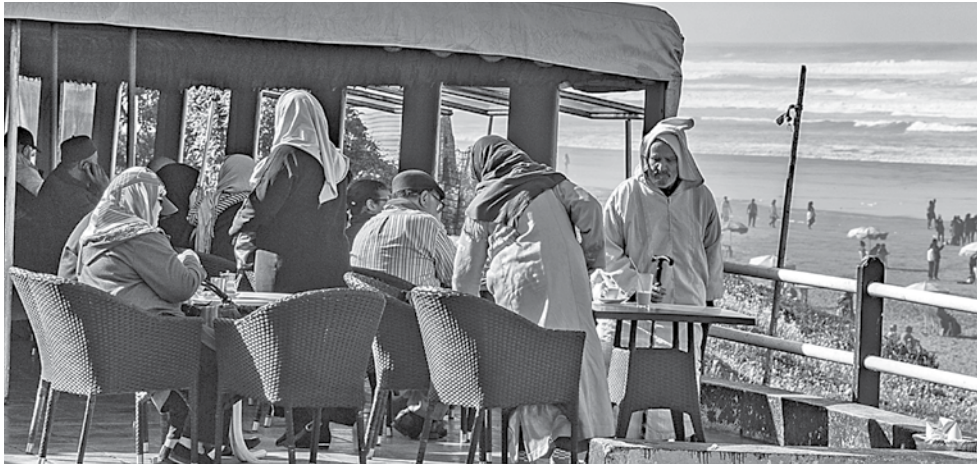
Spot the bikini — On the beach at Casablanca.