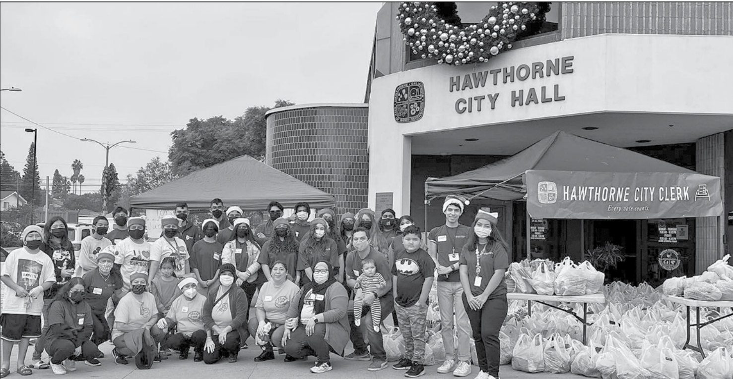
The City of Hawthorne’s City Clerk’s office held a produce and toy giveaway at City Hall last week. Families were offered a choice of a toy for each child and two bags of produce. Families even took Polaroid photos with a holiday backdrop. The “produce only” giveaway will continue every other Saturday from 10:00 am to 12:00 pm outside of City Hall.