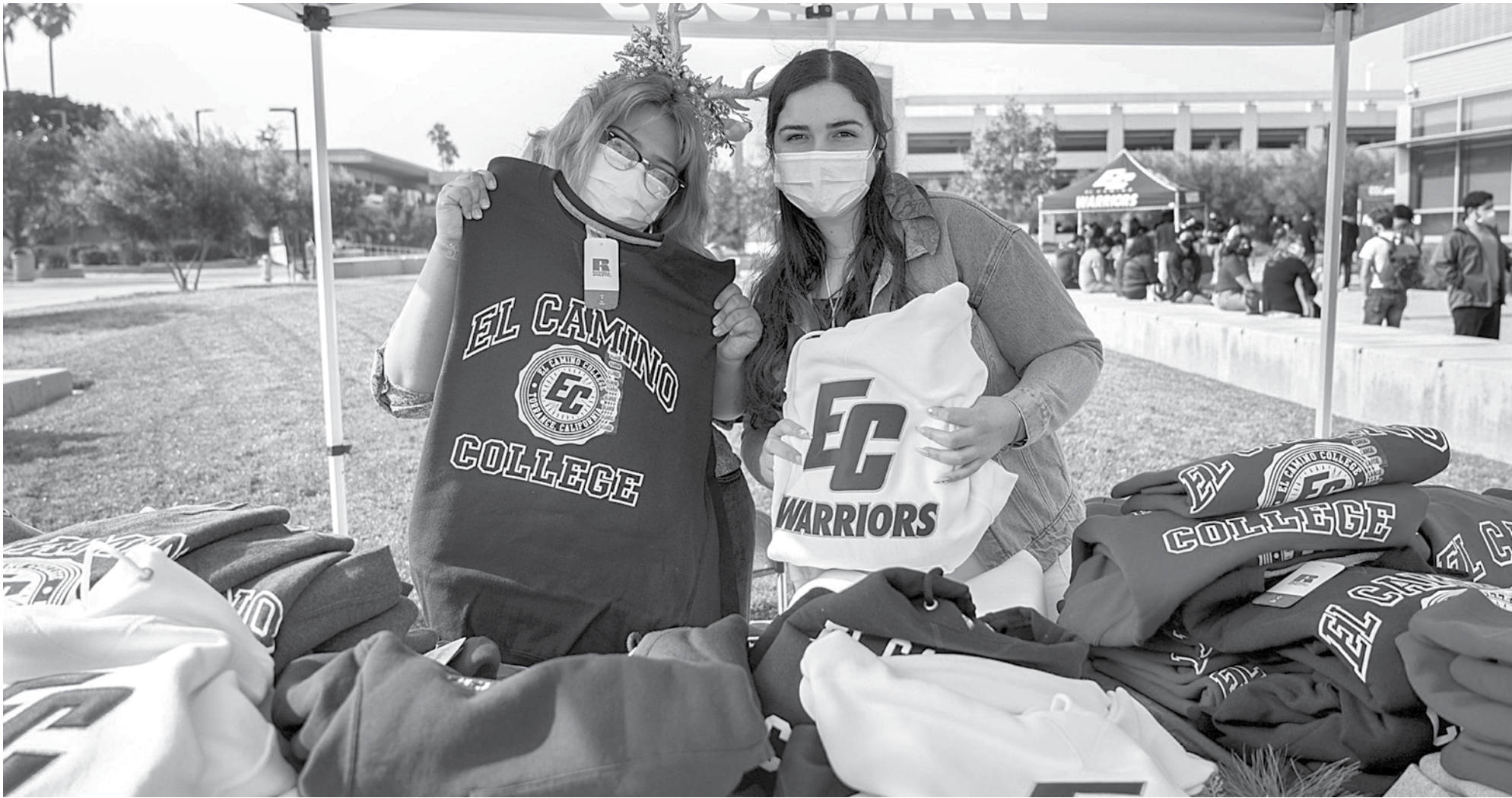
The “Vax Winter Festival” event hosted by the Associated Students Organization (ASO) and Student Health Services (SHS) was a blast. Attendees picked up free food and El Camino merch, played games along the plaza and got their COVID-19 vaccinations and boosters on-site. Reminder: El Camino College requires all students taking in-person classes, faculty, and employees, to be fully vaccinated against COVID-19 and upload proof of vaccination by January 3, 2022. Learn more at https://bit.ly/ecc-vaccine-mandate .