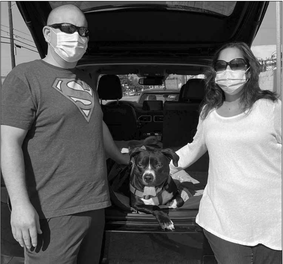
Congratulations to Oreo finding a new family.

For Armed Forces Foundation. spcaLA has partnered with AFAFF for almost ten years to offer no fee adoptions for military, typically twice a year – on Memorial Day and Veterans Day. That means a happy adoption for dozens of animals including Oreo. •