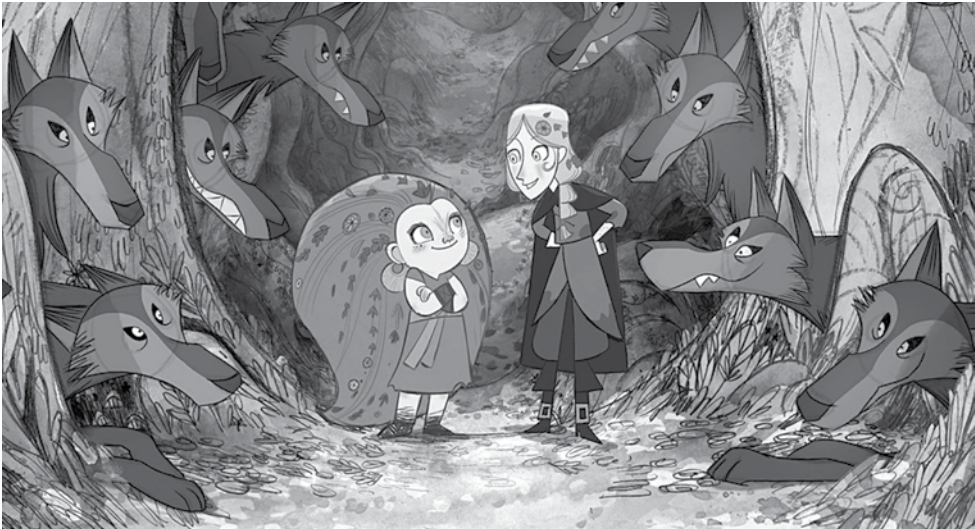
Wolfwalkers , courtesy of Cartoon Saloon

Wolfwalkers , the latest film from award-winning studio Cartoon Saloon, has a darker undertone than the typical "cartoon." Touching on topics like deforestation, man vs. nature, and spirituality, the film puts a child-like