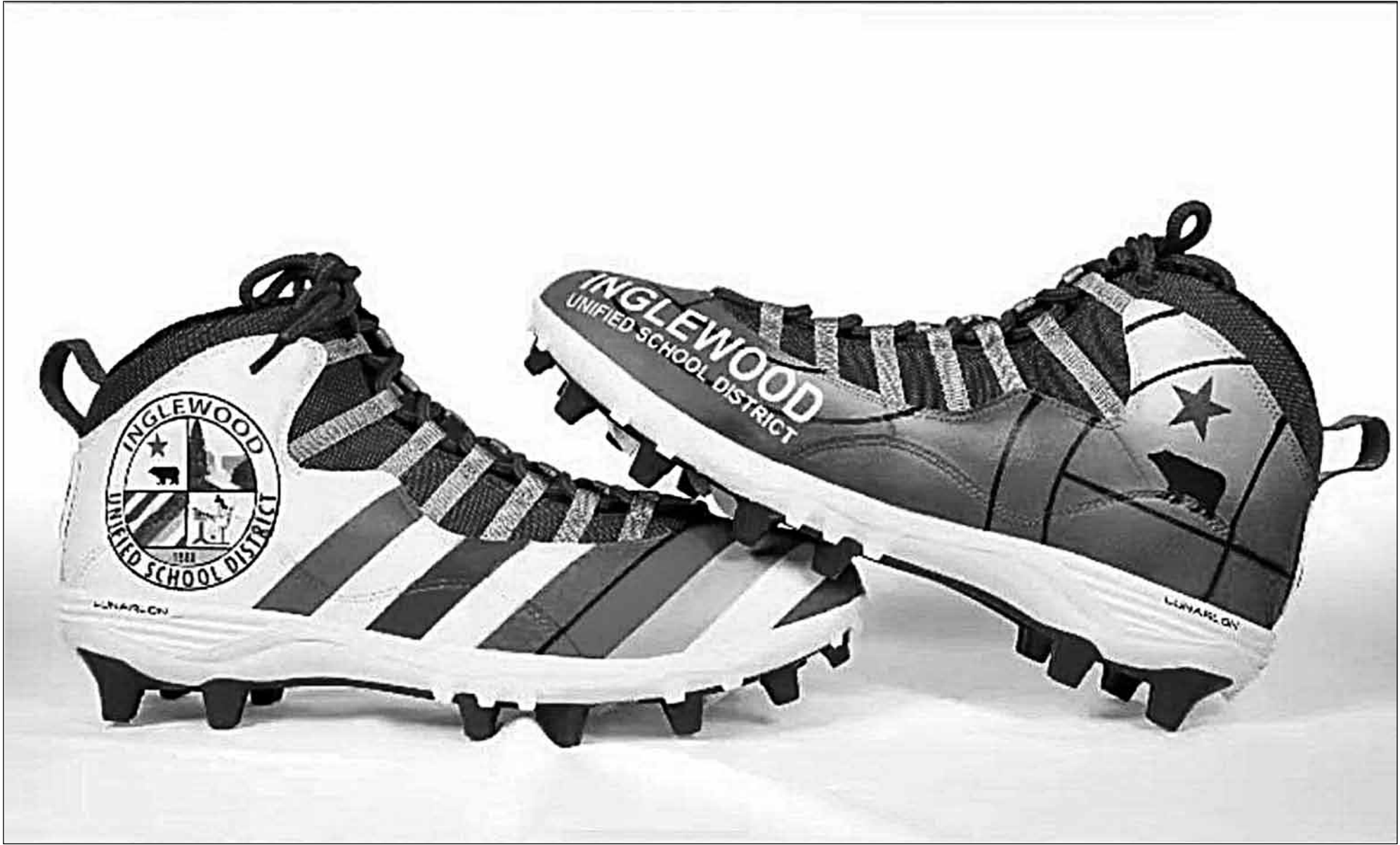
Thank you Jared Goff for selecting IUSD for the “My Cause My Cleats” initiative. Through the “My Cause My Cleats” campaign, which the league started in 2016, players can bend uniform guidelines and wear cleats designed to represent a cause of their choice. Inglewood is so excited and can’t wait to see Jared wear the cleats pictured on Thursday, December 10th when he plays against the Patriots. Having him represent our district and wear our colors at SoFi Stadium will be amazing. Go Rams.