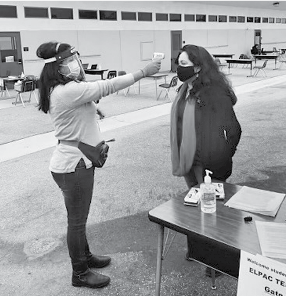
Twenty-eight students were brought in for in-person English Language Proficiency Assessments for California (ELPAC) testing. The ELPAC is used to identify and monitor English learner students’ progress toward English language proficiency. Thank you to the Special Projects team and the English Learner Instructional Resource Teachers for preparing Anderson Elementary to safely welcome students for testing. It was refreshing to see students in-person, even if just for a few hours.