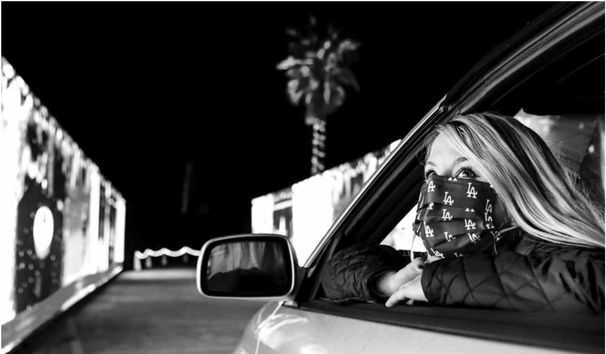
The 2020 World Champion Los Angeles Dodgers are hosting a drive-thru Holiday Festival, complete with a light show, LED video displays, fake snow and interactive displays honoring the Dodgers World Championship and celebrating the holidays. As part of the Dodgers Holiday Festival, Los Angeles Dodgers Foundation will be accepting the following donations in a contactless manner: new or gently-used baseball or softball equipment that will benefit Dodgers RBI, new toys that will benefit Raise A Child, and new pairs of socks that will benefit LA Family Housing.