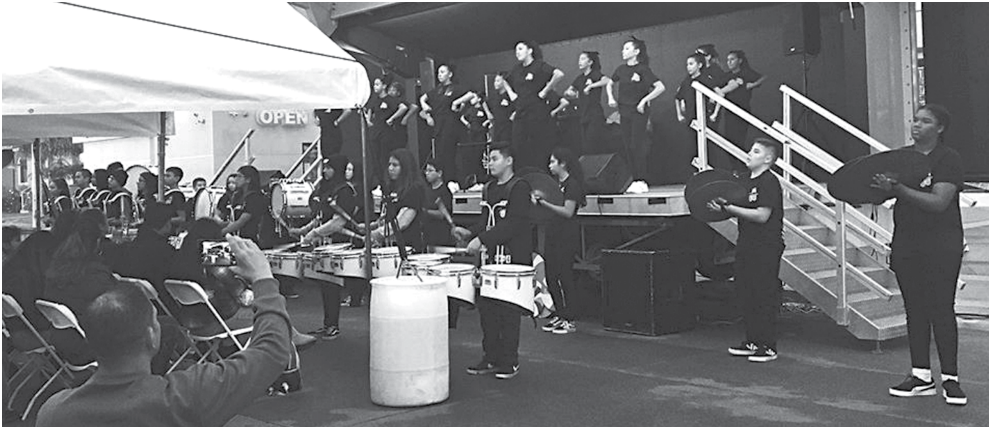
The Jane Addams Drumline and Cheer team performed admirably at the City of Lawndale's Tree Lighting Event last week.