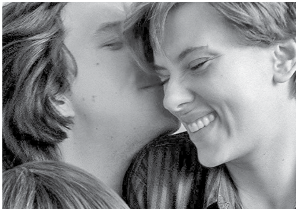
Marriage Story

Marriage Story is a master class in acting, with Driver and Johansson delivering a pair of performances that rank amongst the best of the year. Driver, who has collaborated with writer/director Noah Baumbach three times prior, plays both sympathetic and arrogant in a way that we want to slap him and hug him simultaneously. From the subtle lip quivers to the heartfelt rendition of Company's "Being Alive" at the piano bar, he is the embodiment of a man who, with nothing left to lose, begins to wear his