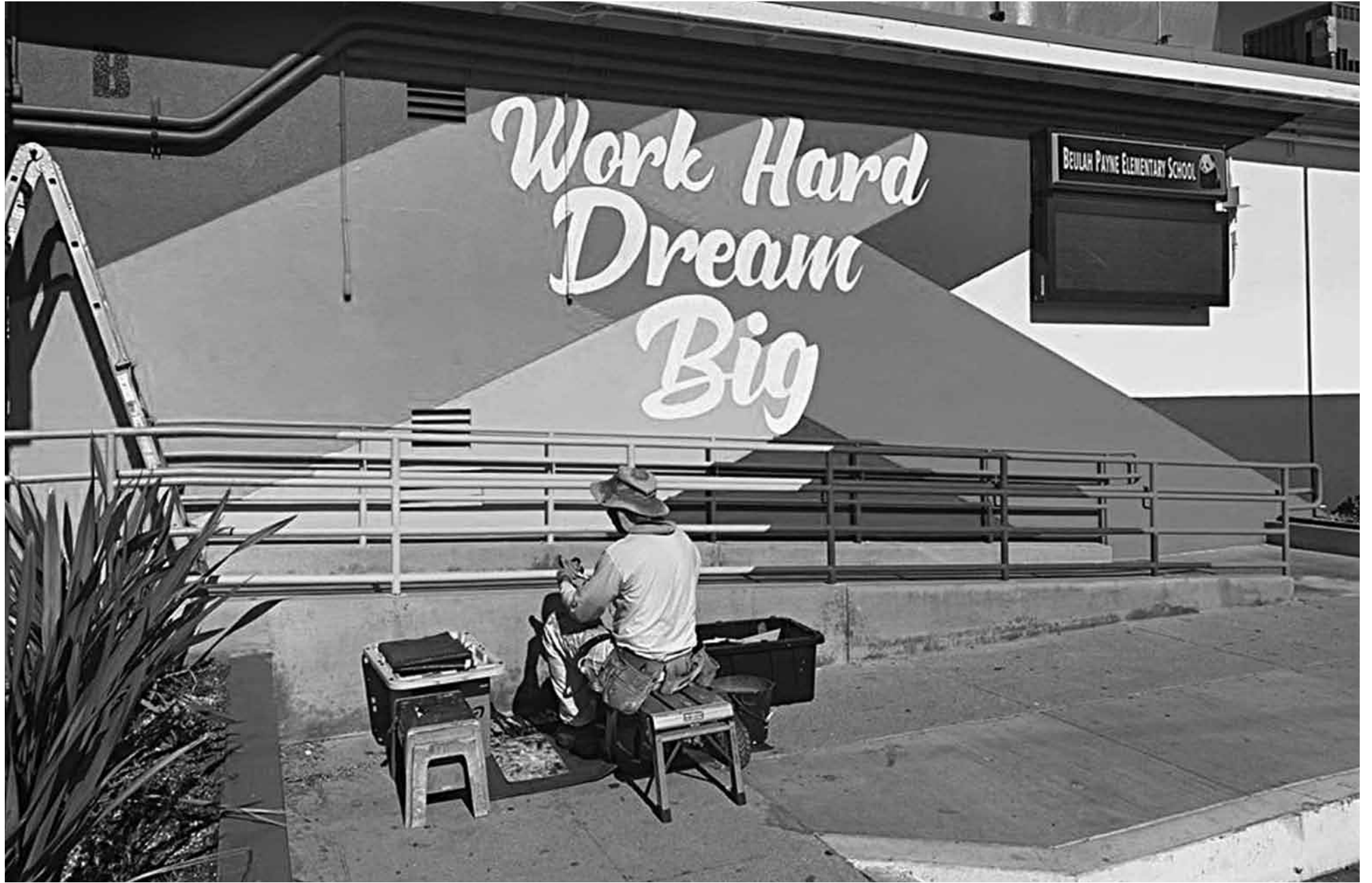
Inglewood's Beulah Payne P-8 STEAM Academy is inspiring students through its new campus mural!