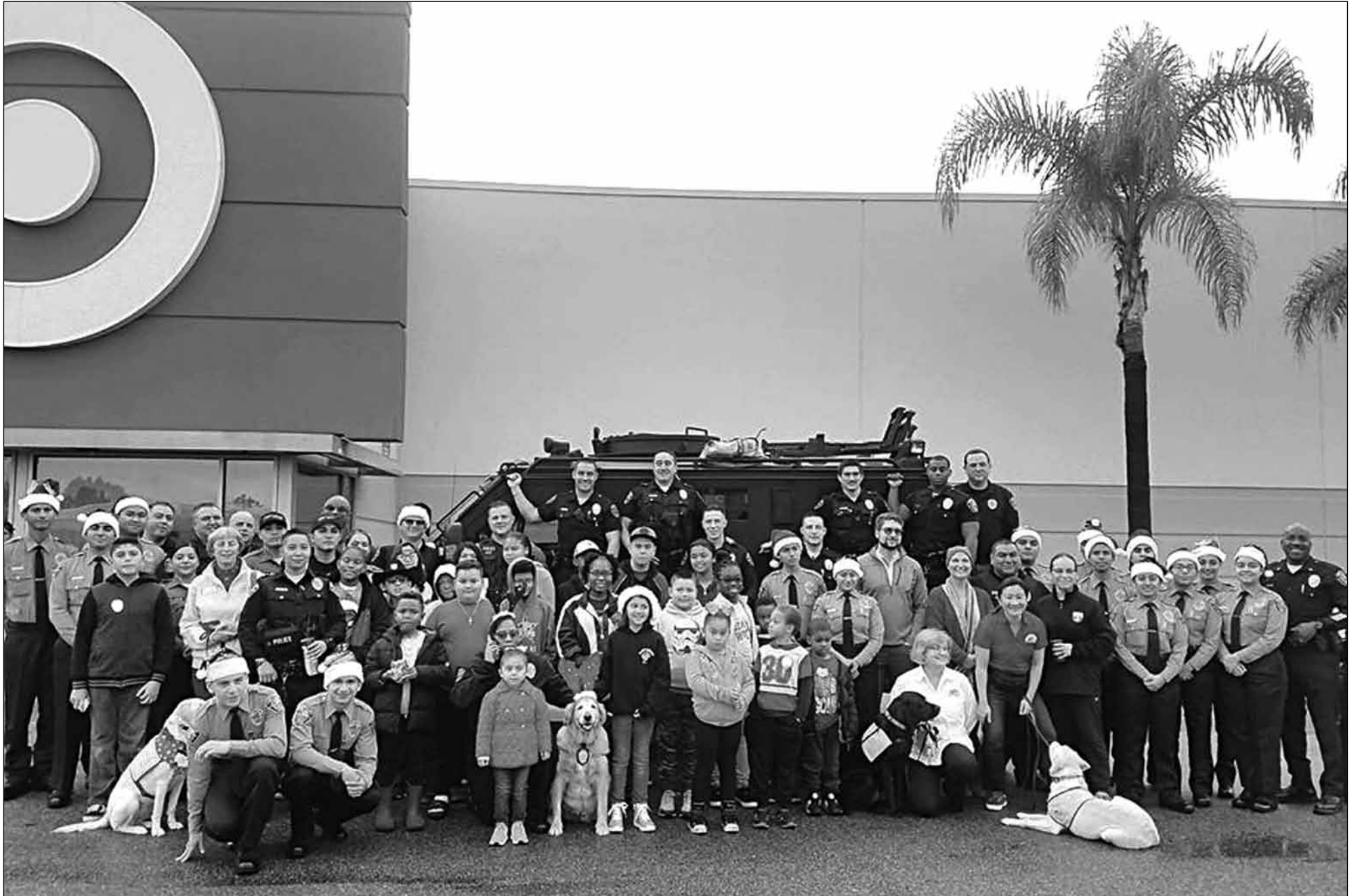
The community came out this past weekend for another successful Heroes in Blue Program held at Target.