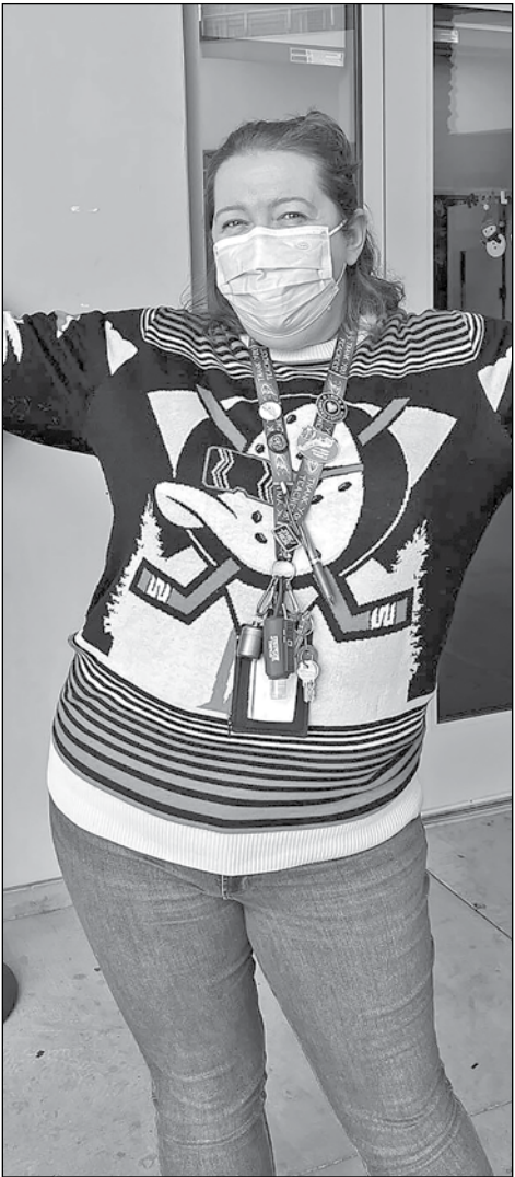
Cardinals took out their holiday gear to celebrate on the last week of school. Happy Holidays.