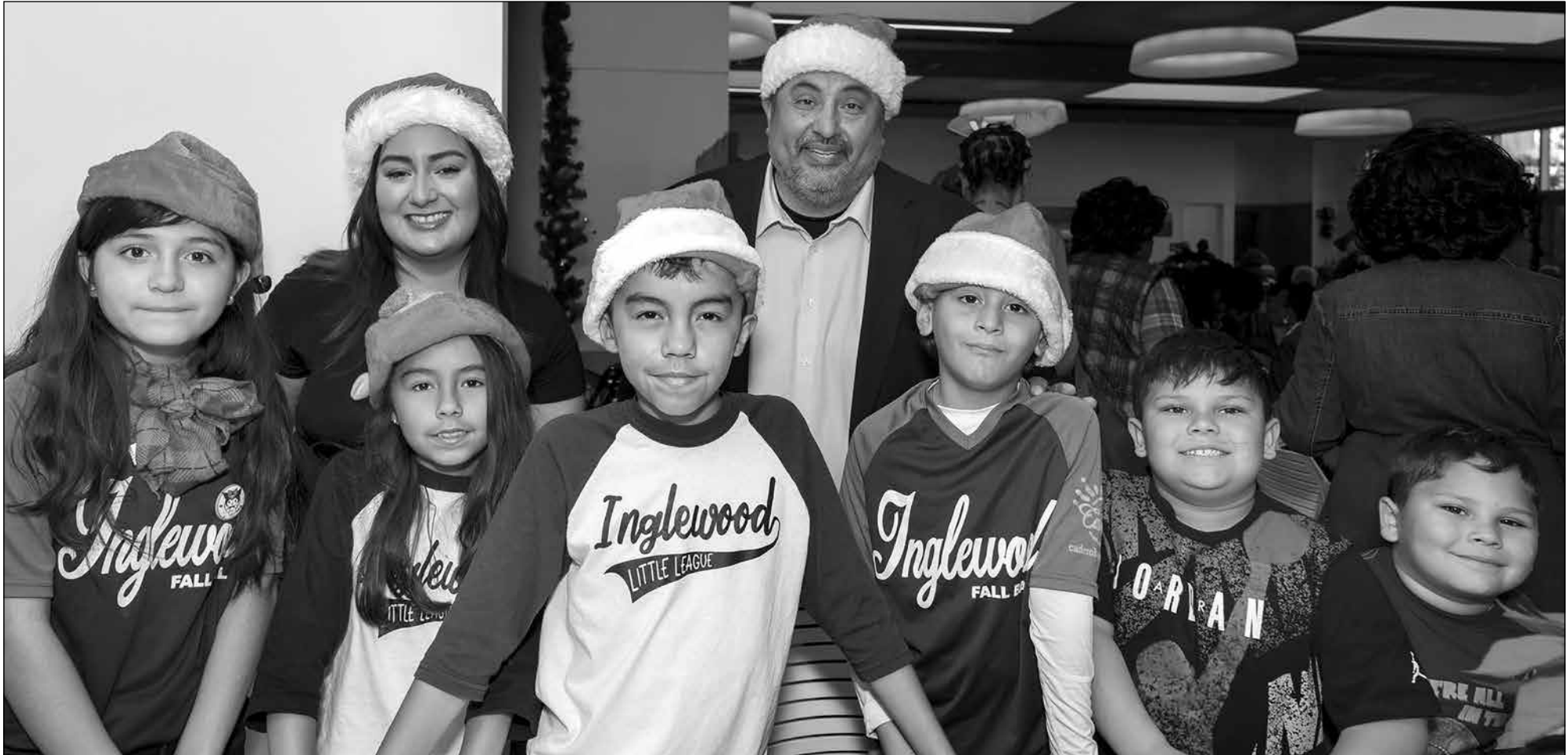
A festive gathering at the Inglewood Senior Center filled with delicious food, exciting raffles, and heartwarming performances by our talented local students. Cheers to celebrating the season and bringing joy to our incredible seniors.