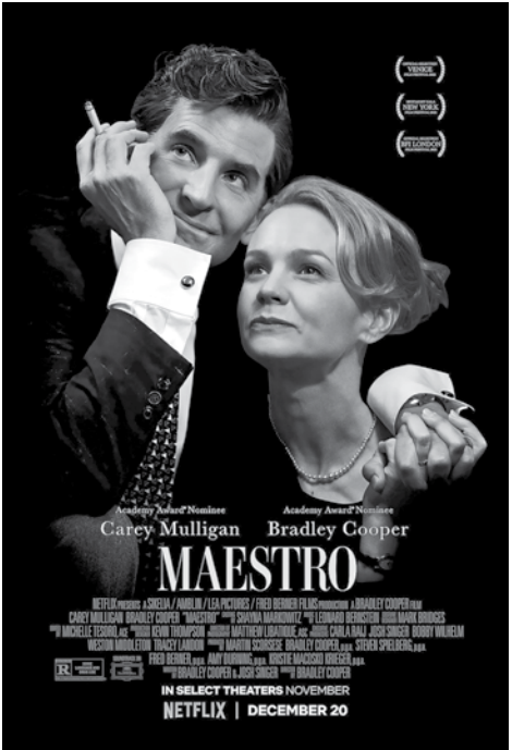
Maestro

A star was born in Bradley Cooper's directorial debut, and that star has matured into a force of nature in his sophomore feature, the Leonard Bernstein biopic, Maestro . The depth of beauty runs deep throughout the film's 129-minute runtime, as Cooper offers audiences a richly observed panoramic portrait of a misunderstood artist whose music contributed to some of the most unforgettable scores of all time. Starring as the multi-hyphenated conductor/