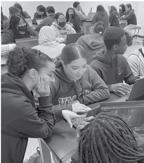
HMSA AP Classroom.