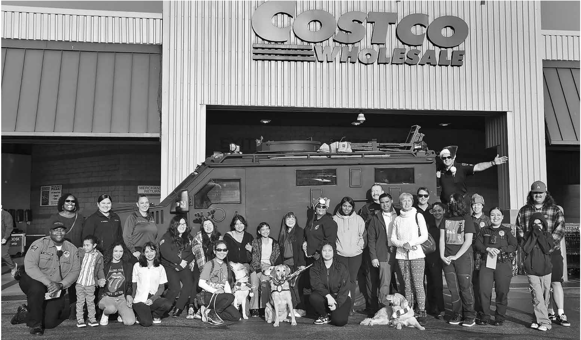
Needy and victim families from the community were selected to go on a shopping spree and given extra presents donated by our local businesses. Thank you so much for the continued support. Happy Holidays.