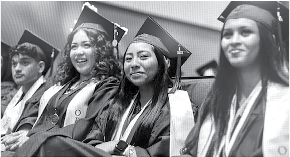
HMSA Commencement 2023.