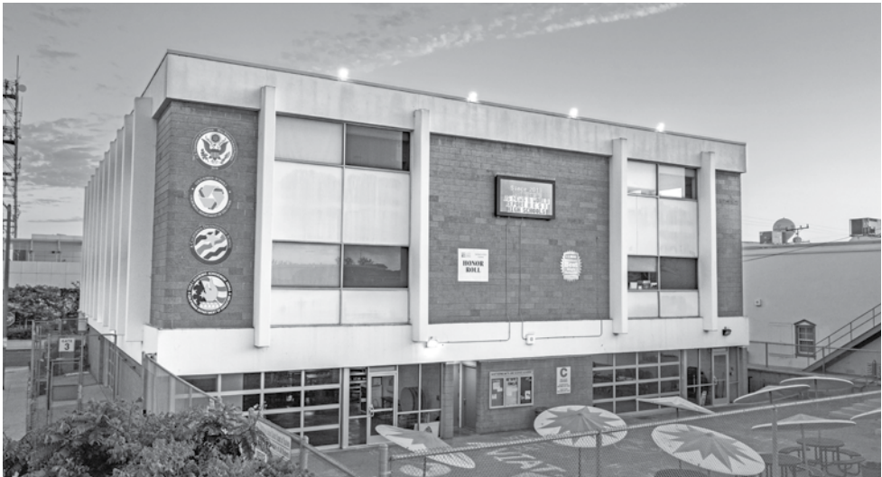
Hawthorne Math Science Academy.