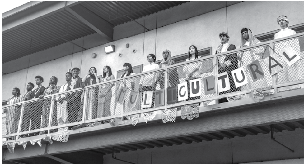
HMSA Multicultural Day.