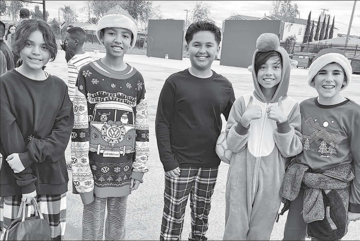
It was a fun spirit day on the last week before the Holiday Break. Everyone celebrated with Pajama Day at Smith Elementary. Happy Holidays.