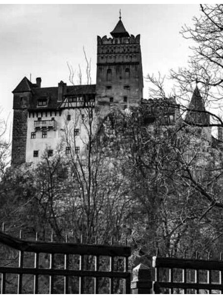
Bran, Romania — Count Dracula opts for photogenic, or at least

We don't know why more people don't love this movie. A wildly attractive cast in a wildly attractive Paris. No palaces, but an