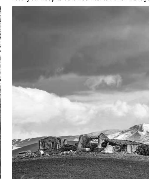
Corleone, Sicily—the road to The Godfather is lined with

Gedeck, but the cooking steals the show. Don't start this one when you're hungry, unless you keep a certified Italian chef handy.