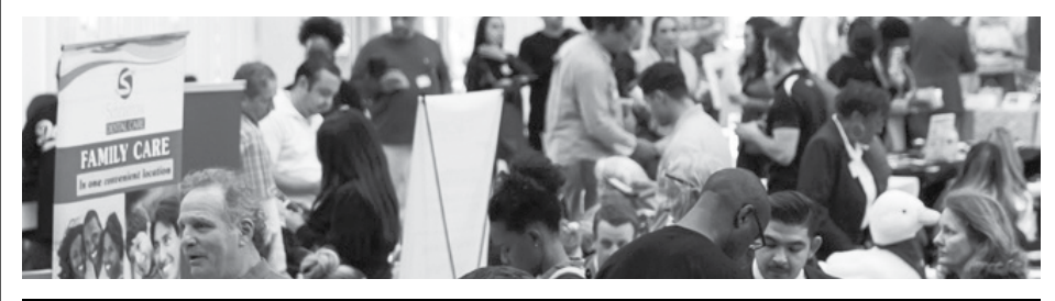
Los Angeles County Covid-19 protocols will be followed.

Our small business experts can help you start and/or grow your business at NO CHARGE! The El Camino College Small Business Development Center provides consulting, training and assistance with funding at no cost to help you succeed. Visit us at the Expo or online at www.southbaysbdc.org | www.facebook.com/SouthbaySBDC