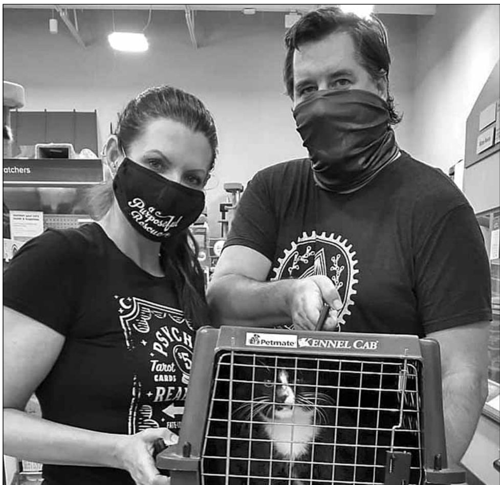
Congratulations to Phantom and his new family.

When you adopt a “pet without a partner”, you will forever make a difference in their life and they are sure to make a difference in yours. •