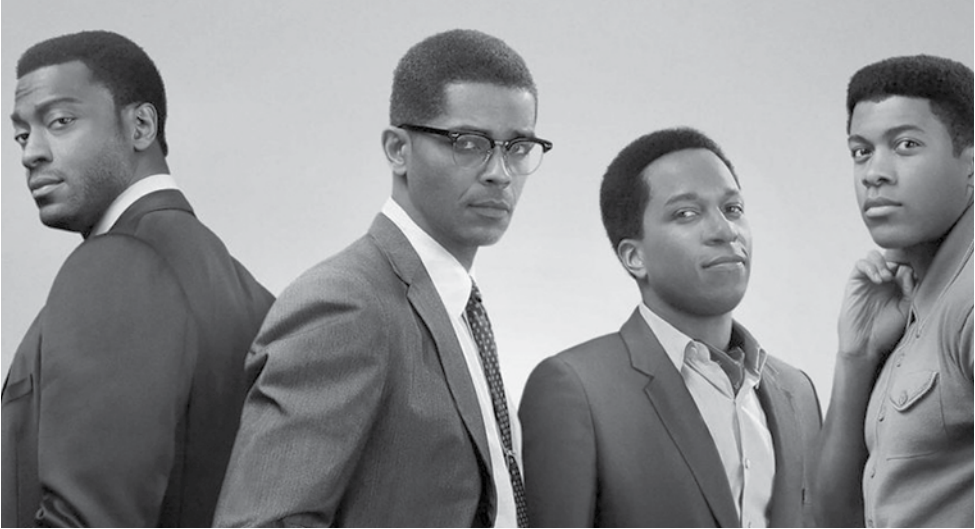
One Night in Miami, courtesy Amazon Studios.

Distributed by Amazon Studios, One Night in Miami is now playing in select theaters and