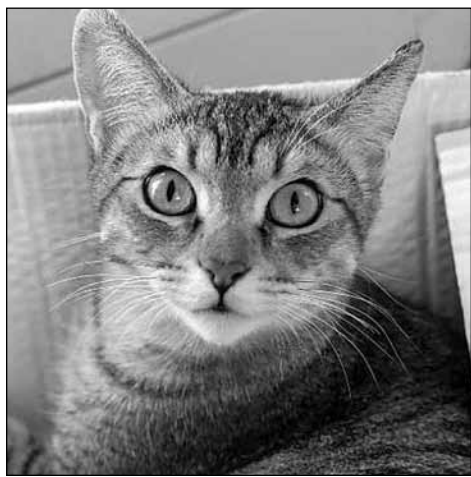
If you want a friendly, loving kitty that likes attention yet is not too needy, Allegra is your girl! Come and meet beautiful Allegra to see if she is the right kitty for you.

Allegra is a beautiful girl that loves head and chin rubs. She is a mellow kitty that likes to perch on the cat tree and bask in the sun or curl up beside her foster mom while she watches TV or takes a nap. Allegra is a bit shy when she meets new people but is not a skittish girl. The fastest way to earn Allegra's trust is through her tummy – she loves to eat wet food and yummy treats like shredded chicken.