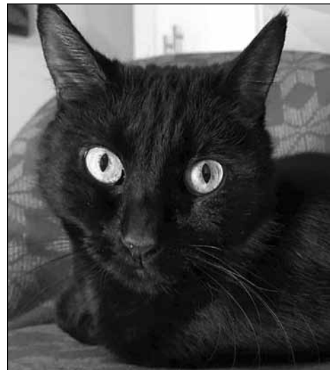
so Corsica would love to be adopted with his remaining sibling Crete.

Corsica and his six siblings were found in an abandoned house when a good Samaritan brought the family to us. Like all kittens, Corsica loves to play and wrestle with his siblings, and cause lots of mischief! He also loves playing with his toys and having fun with humans. Corsica is the more cautious kitten of the litter, but once he gets to know you, he enjoys spending time on your lap and playing. He is a climber and likes to hang out in high places. His kitty family is very bonded,