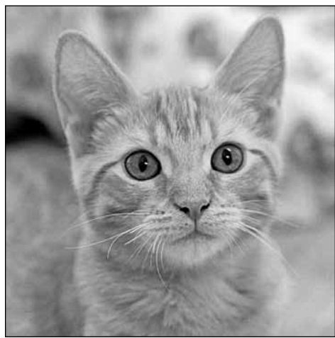
most vulnerable victims of the homeless cat crisis. We know that these are hard times for everyone. If you can give a little, it will go a long way. They are still counting on us during these difficult times. Your tax-deductible donations for the rescue and care of our cats and kittens can be made through our website or by sending a check payable to Kitten Rescue, 914 Westwood Blvd. #583, Los Angeles, CA 90024.

With our city and state shut down, we are faced with the delicate balance to protect our fellow humans from the spread of COVID-19 while continuing our mission of saving the