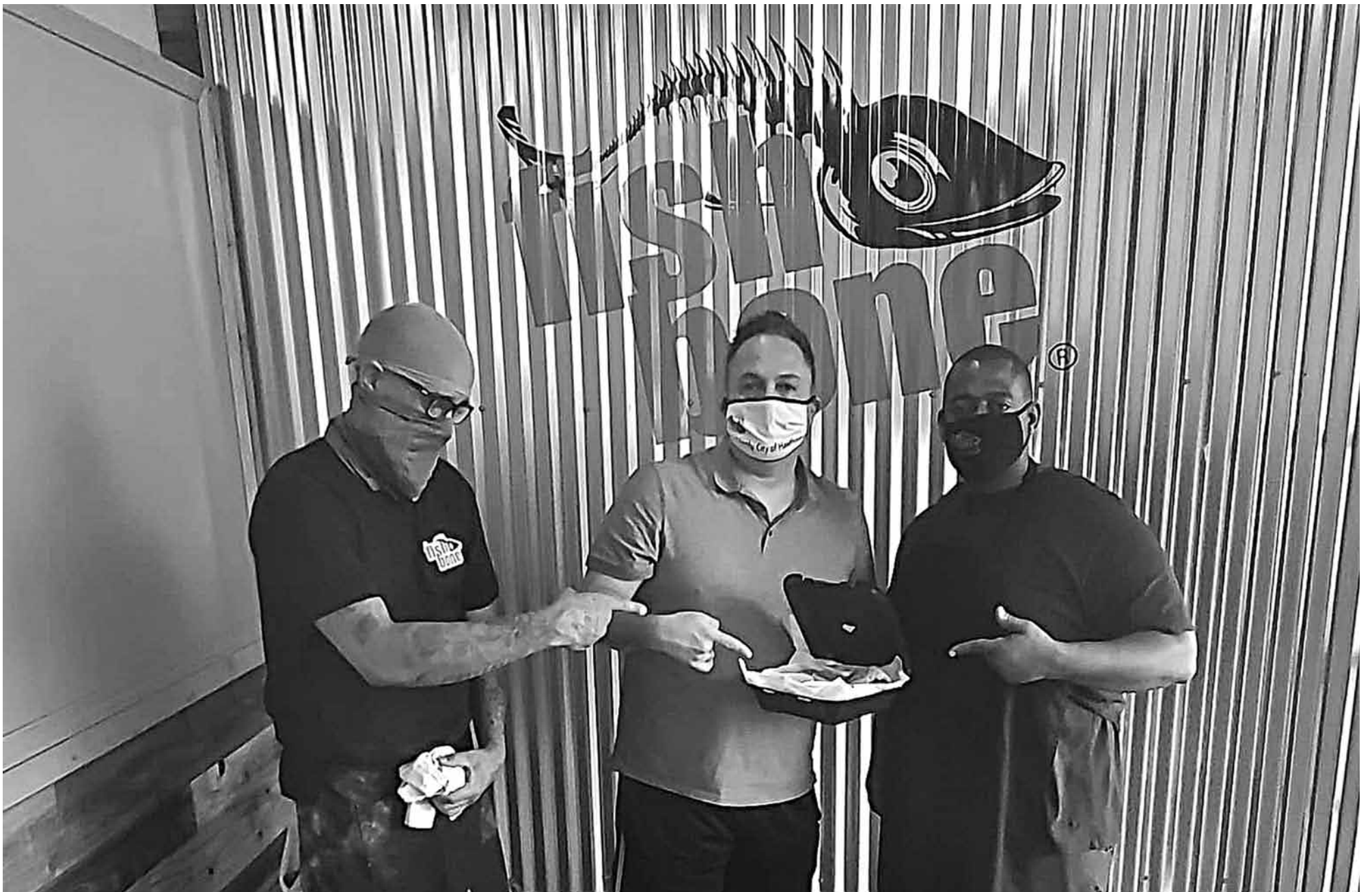
Hawthorne's newest addition to its culinary delight is Fishbone Seafood Restaurant. They serve good Cajun style seafood that is fried or grilled with a variety of choices for sides. Come down and support our new neighbor.