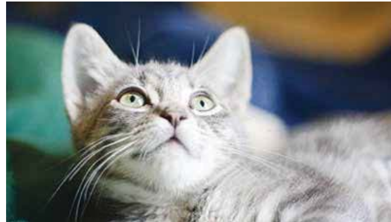
Glitch would love to come home and meet a new playmate.

Glitch's siblings have all been adopted and now it's her turn! She is an adorable, affectionate little tabby girl. Let her find her favorite place cuddled up close as possible to you, purring. Glitch is a playful, active