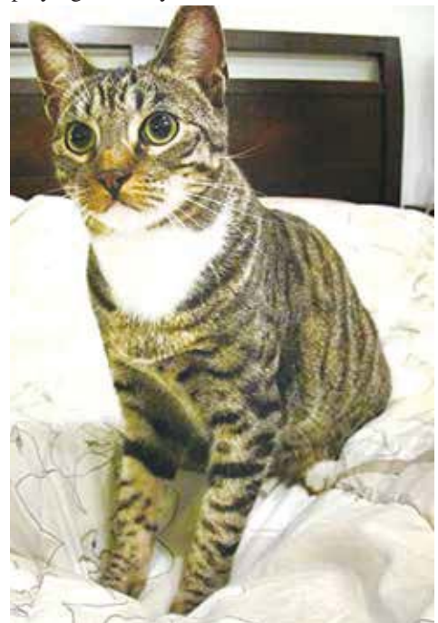
Q loves to be petted and brushed.

" Q " is a beautiful brown tabby boy. He and his siblings were abandoned as kittens and he was a little nervous with people when he was rescued. But once he got to know his foster family, Q showed his true colors as the friendly, sweet cat he is. He loves being petted and brushed (and even lint rolled!). Q will show his tummy and ask you for pets and playtime. Active and playful, he loves playing with toys and other cats!