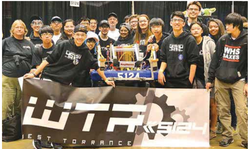
West Torrance High Robotics Club at the FIRST Robotics Competition.