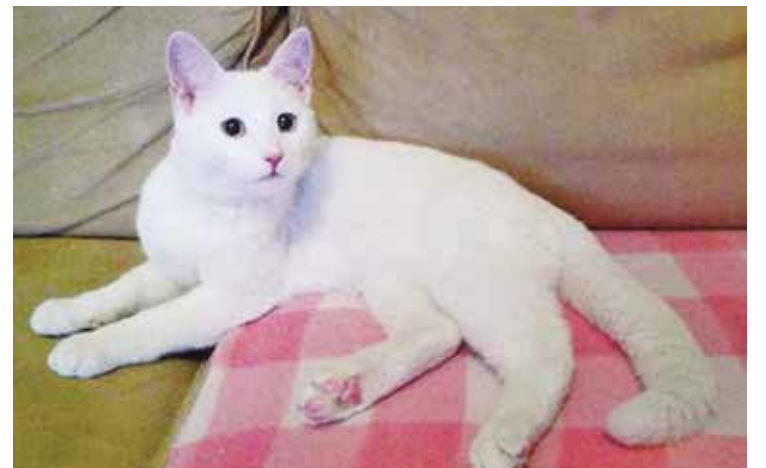
Casper is just a baby kitten who wants to play.

Be kind. Save a life. Support animal rescue. •