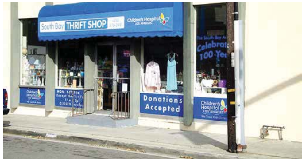
The Thrift Shop operated by the Auxiliary to Children's Hospital Los Angeles.