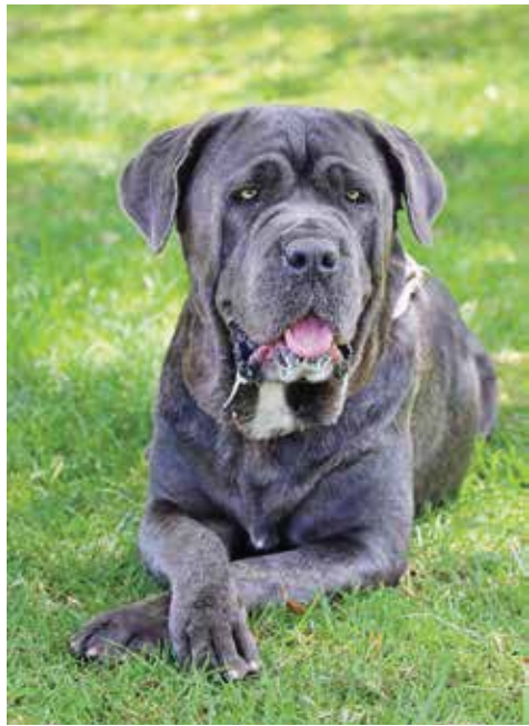
Bisha is so well mannered and needs a low-stress household.

Adopt a "Pet Without a Partner" and Give a Homeless Pet a Second Chance in Life