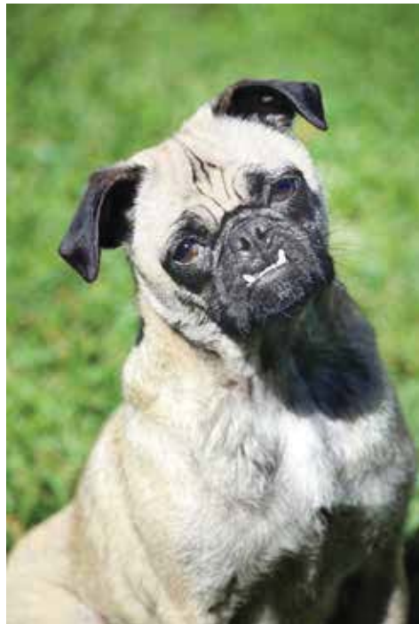
April loves to play and follow her friends around.

April is a sweet year old Pug with the cutest underbite. She is very playful and has a very sweet, loving personality. She is fine with all other dogs and is settling into her foster home well. April crates great at night, not a peep. She loves to chew on her nyla bone and will chase small stuffed toys when you throw them. As most Pugs do, she loves to be with you and will follow you from room