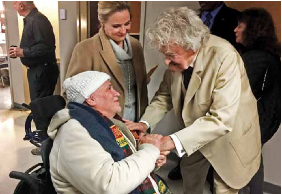
Ron Kovic and Hal Holbrook.