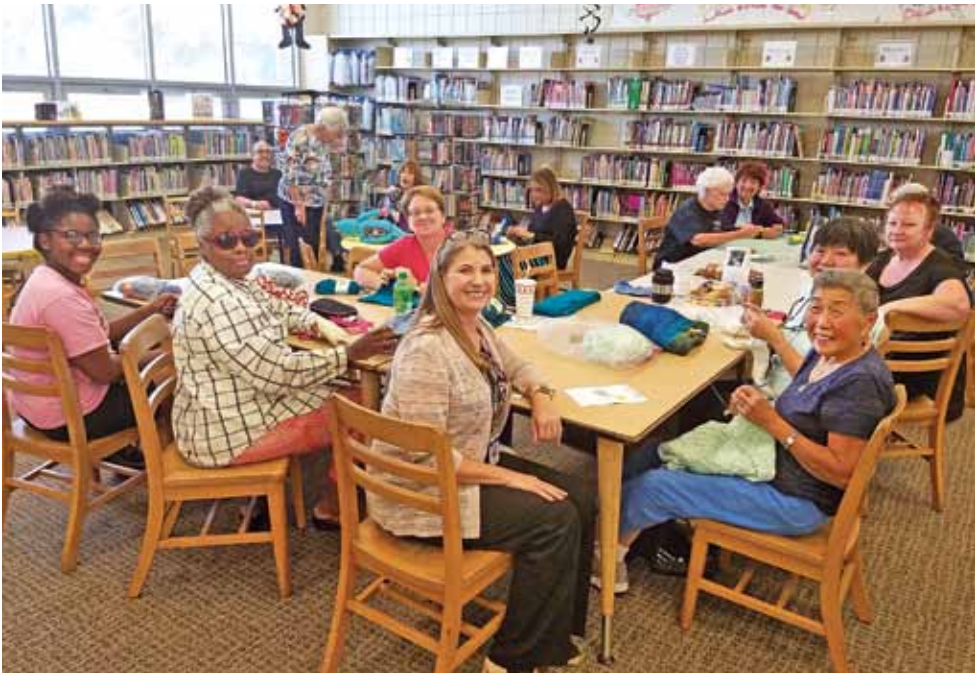
The Craft Delight Program at Isabel Henderson Library.