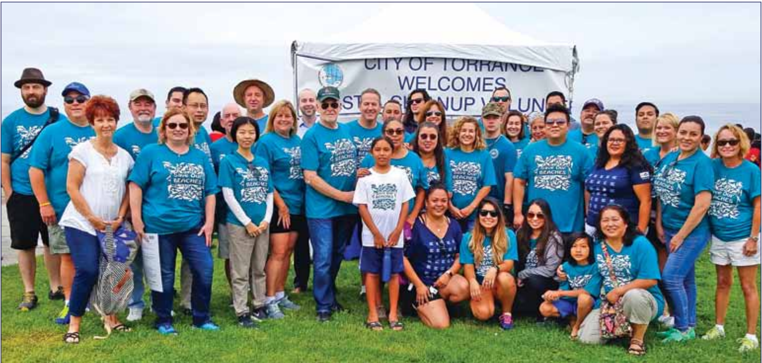
Coastal Cleanup Day 2017.