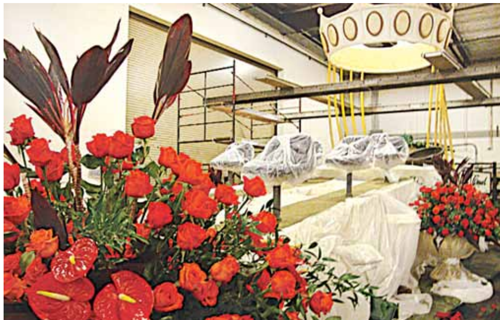
The Royal Court Float.

close as the final flowers, seeds, and beans are applied. Not only were we treated to an early peek of the Torrance float, but ten other floats being built in the barn would be available for viewing. How exciting!