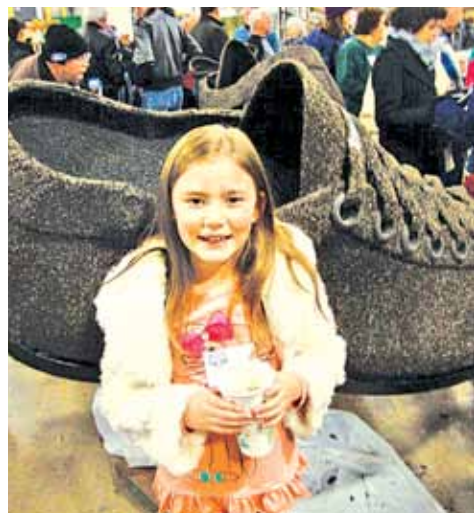
Shoes done in niger seed, poppy seed, onion seed and seaweed for the sole of the shoe.