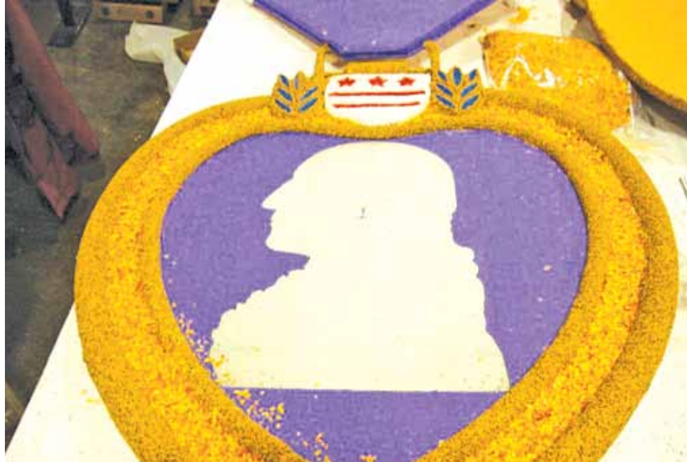
Purple Heart to be added to the Zamperini Float.

getted for the Torrance Rose Float Association so when I was on the board last year we were the first major fundraising board and we were lucky to have AYSO approach us to fund us.