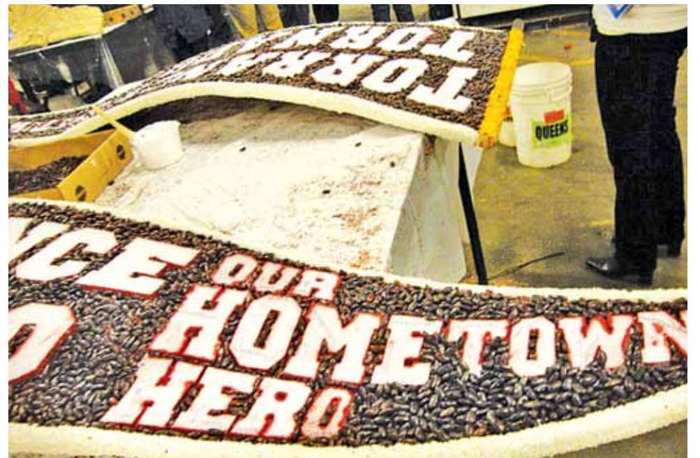
Close up of the signs to be placed on the Torrance Float.