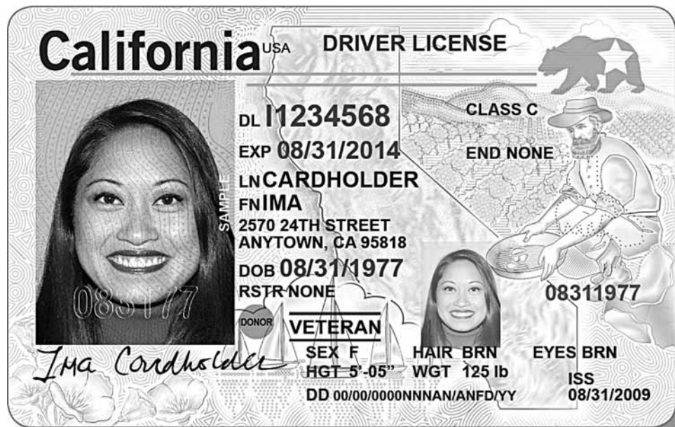
A federally compliant driver's license is optional at airports, though frequent flyers might want one by fall 2020.