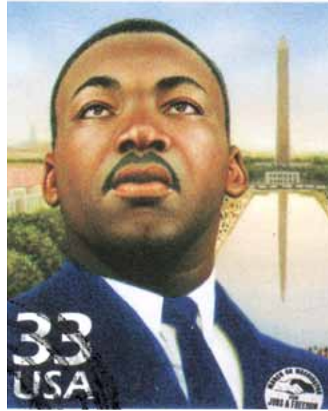
Dr. Martin Luther King, Jr. Stamp.