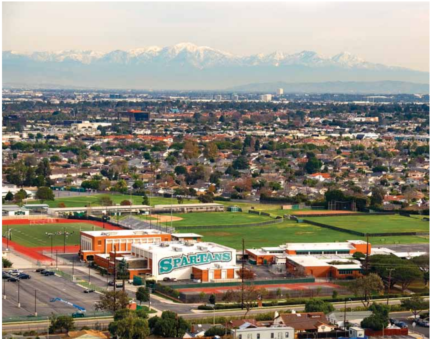
A view of South Torrance High in the foreground and snow-peaked Angeles National Forest/San Gabriel Mountains in the background.