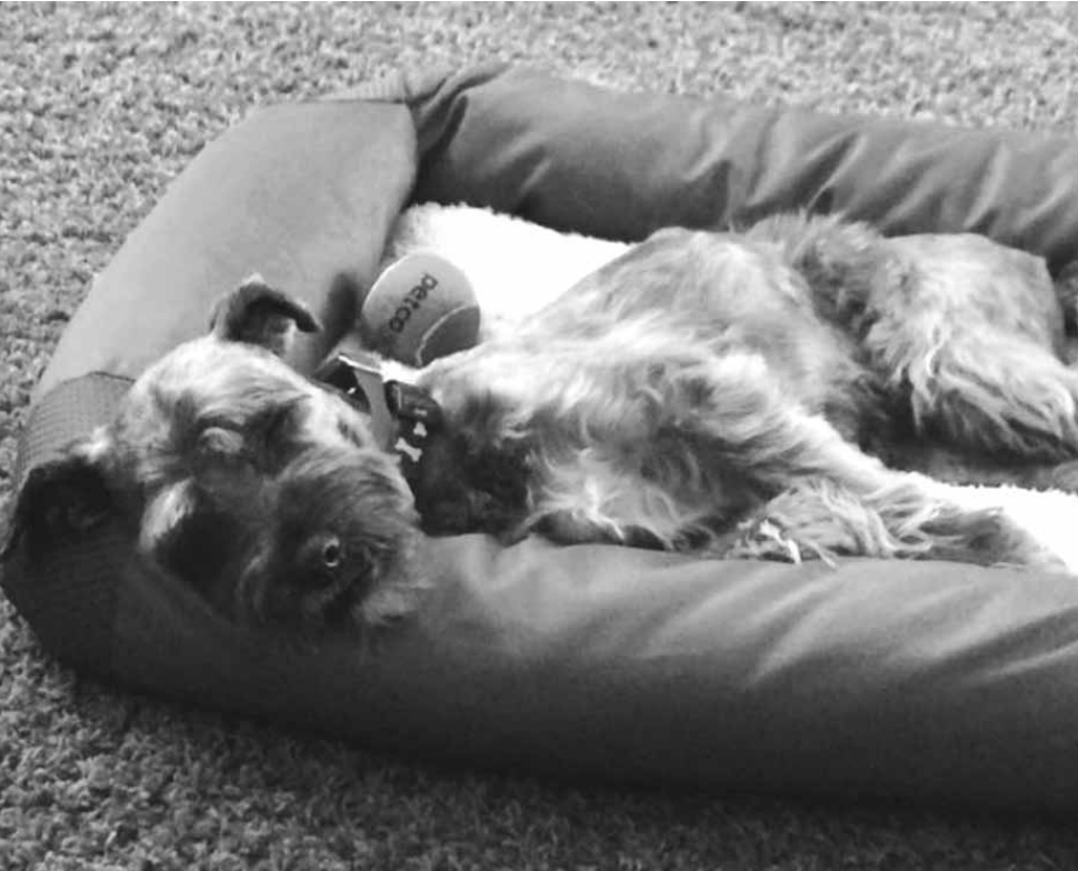
Nixon resting easy in his new home.

very fearful of strangers but has come around. It took some work but Nixon's a happy little guy who gives endless kisses. He joins a family of five and has his very own kids to play with and look after. What a great way to start the New Year! •