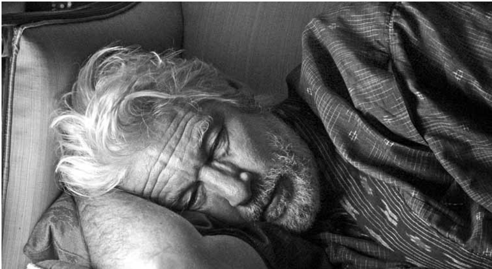
Richard Gere in The Benefactor.

Without prompting, in addition to securing Luke a job at the children's hospital he supports, Franny showers the young couple with lavish gifts. Olivia and James quickly