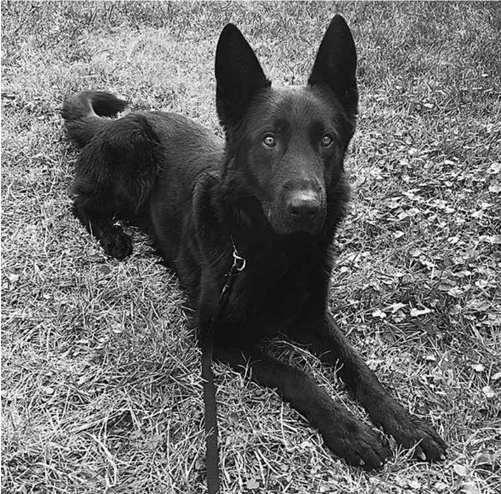
Torrance Police Department has a new K9 and his name is Kido. He is a 3-year-old German Shepherd from Germany. Kido and his partner will soon begin Basic Handler School. Thanks to the support of the Torrance Police Foundation, the City of Torrance will now have three K9 teams for the first time in 30 years.