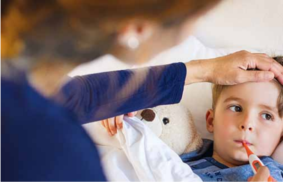
I don't feel well...