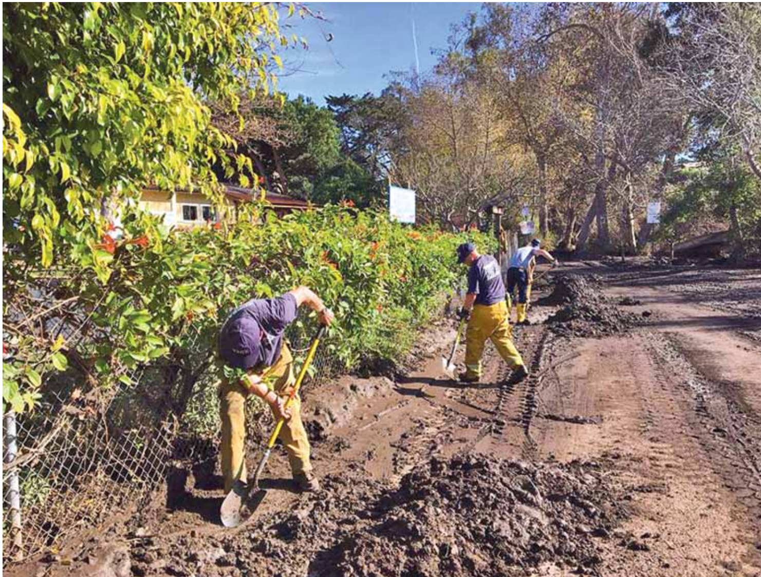
Torrance firefighters were part of the South Bay Area G Strike Team that went to Carpinteria to perform secondary searches, a debris search down Carpinteria Creek, and to assist at an elementary school removing mud.