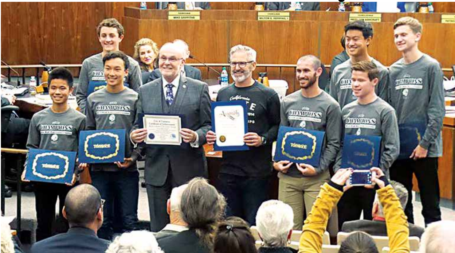
At last week's Torrance City Council meeting, members of West High School's boys cross country team and coaches received special recognition for winning the CIF State Division III championship.