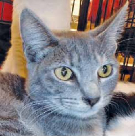
Aurora is looking for a home with other cats.

NaNa was found walking down the street in Long Beach as a very small kitten. NaNa is still a bit timid with humans moving around, likely from her time spent on the mean streets of Long Beach. She loves to snuggle on your legs when you are on the couch, and will even ask for pets when you are in bed. NaNa loves to play with toys, so if you sit down and get out a wand toy she will come