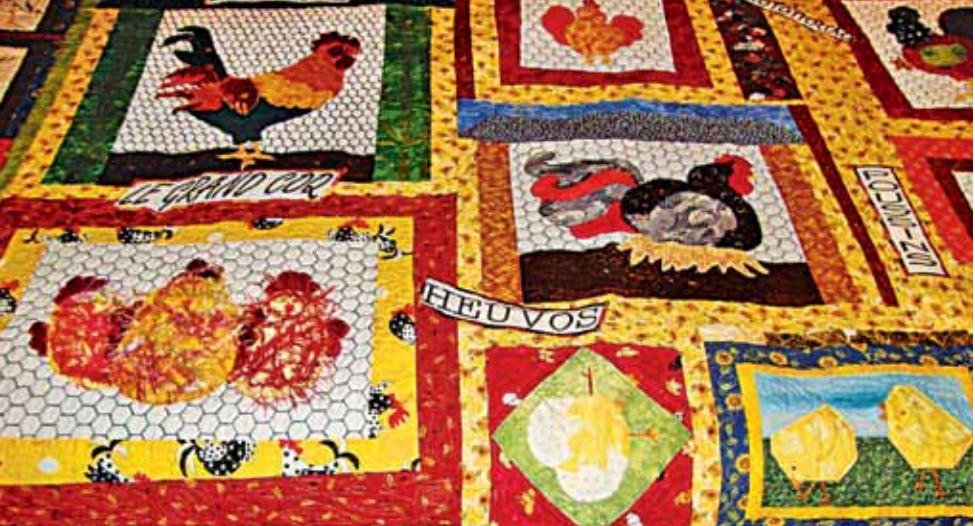
Pierre and Friends - the chicken quilt.