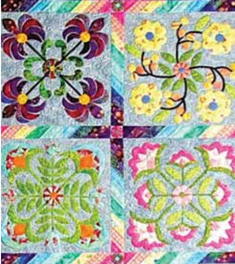
Mom's Sunday Garden.