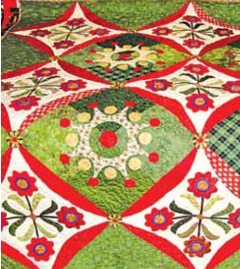
Winter Dance will be shown at the show.