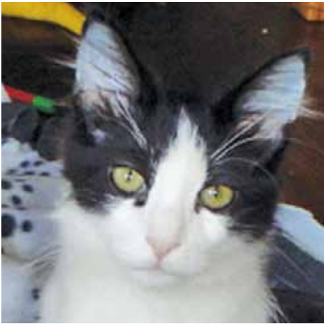
Rascal loves to chase toys and cuddle!

Looking for your purr-fect match? Kitties of every color and size waiting to meet you.