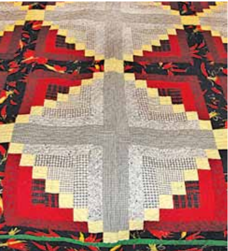
Log cabin quilt.