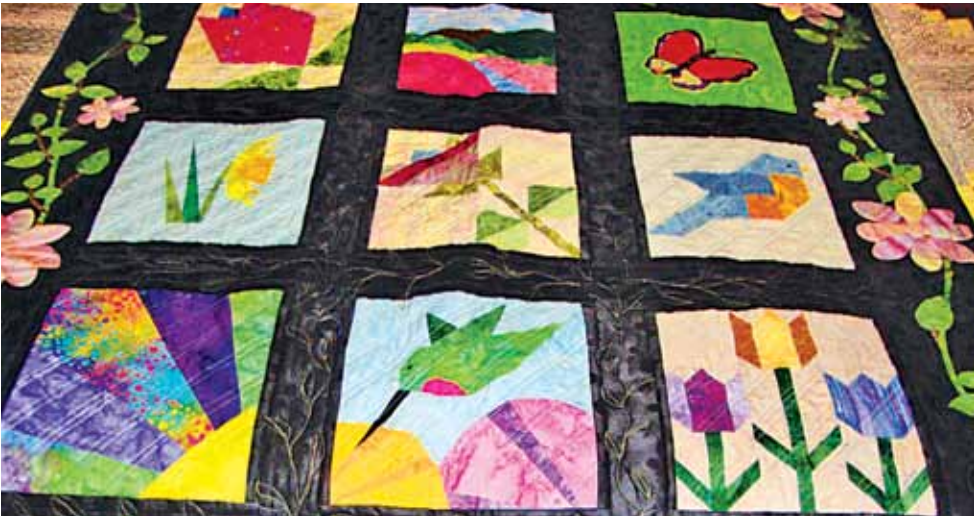
A block quilt done by Sue Glass.