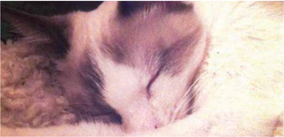
NaNa needs a calm environment.

right over for some fun. She also really likes treats and will just about take them from your hand! NaNa loves other cats, but would be ok as an only if you are home a lot as well as she is very independent. Teenagers who are calm and understanding of her timidity would be ok, but she likely would do best in an adult home. NaNa is a very special, sweet girl who deserves a loving home who will cherish her.