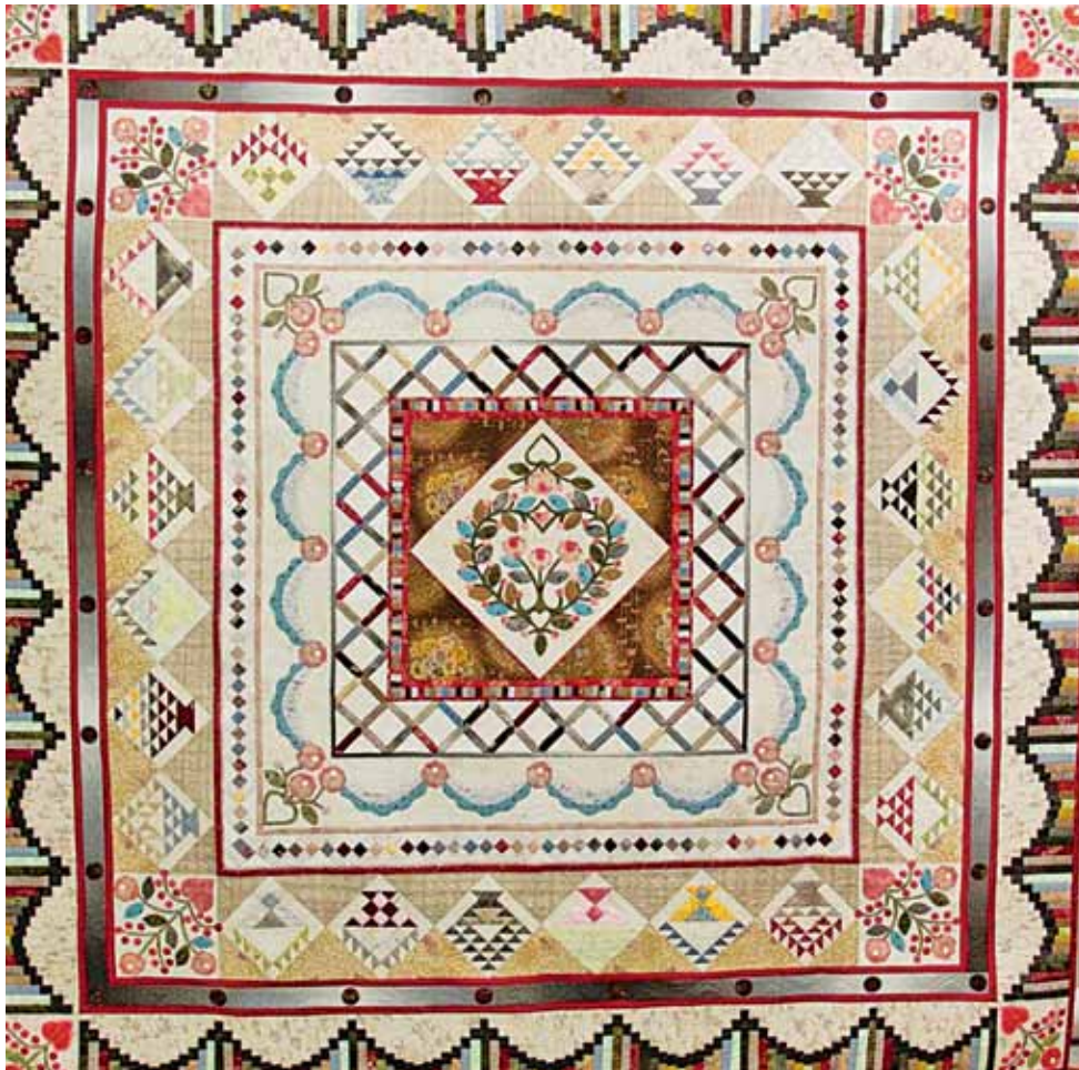
Sue's Ruffled Roses.