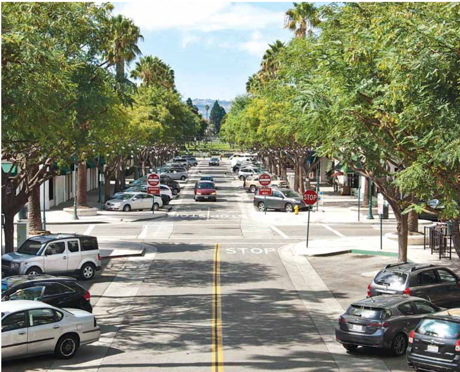
The view of El Prado Avenue from Sartori Avenue.