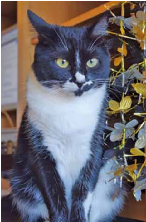
Connie is confident and intelligent.

and she doesn't scratch the furniture. Connie loves to be in the room with you while you work on your computer or watch TV. She'll sit next to you, keep your legs warm, and be your sweet and intelligent companion for hours on end. Like a dog, Connie shows a remarkable degree of responsiveness and will come and hop up on the couch with you when called. Rascal is an adorable little boy with a ton of energy and plenty of goofy antics to go along with it. From the tip of his adorable tail to the end of the hair curling out of his ears, this fluffy boy is a silky bundle of love and cuddles. He loves to romp and play with the other kitties, ignoring their grumbles in favor of batting at their tails until they give in and love him back. Rascal loves to suckle