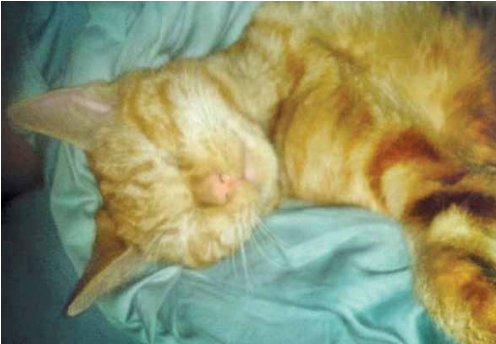
Hugo is fun and affectionate.

Be kind. Save a life. Support animal rescue.