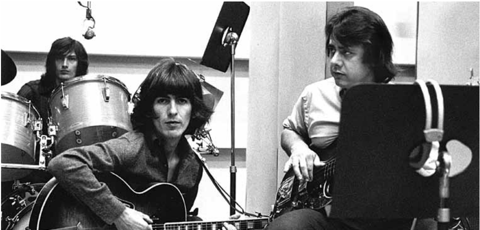
George Harrison and Joe Osborn in The Wrecking Crew , a Magnolia Pictures release.

to the sounds of this golden age of music, everything from Rock n' Roll to Pop and R&B to Soul, are quickly recognizable. What wasn't known, however, were the people who actually performed these songs on the records. The Wrecking Crew is as much a