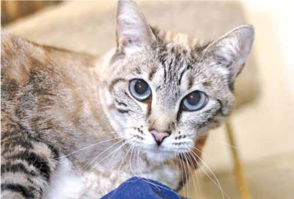
Isabella is super affectionate.