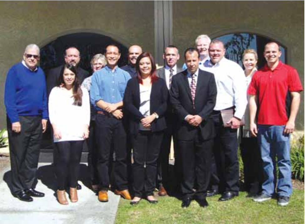
TPD Awards & Appreciation Luncheon Committee.

310.540.5858 or shatera@torrancechamber.com. For tickets and more information access www.torrancechamber.com . This is one event I can't wait to attend. See you there to help support the men and women who put their lives on the line to protect us all. They serve with excellence extraordinaire, never settling for the status quo. •