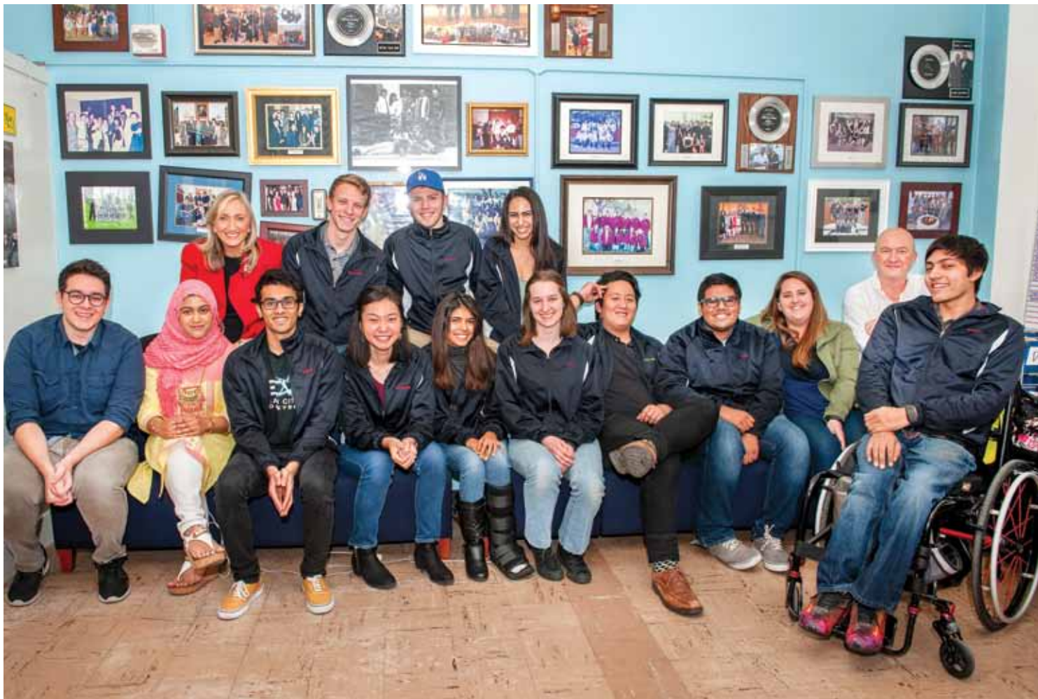
The El Camino College debate team, pictured above, recently returned from a successful showing at the Spring Championships as the top-ranked community college in the nation. The rankings, determined by the National Parliamentary Debate Association (NPDA), also ranked El Camino College fourth among four-year colleges and universities. Photo Provided by El Camino College. •