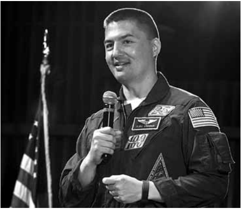
Dr. Kjell N. Lindgren.

Nearly 1,000 South Bay youngsters visited El Camino College's annual Onizuka Space Science Day on March 11. NASA astronaut Dr. Kjell N. Lindgren delivered the keynote address in Marsee Auditorium and was also available for a question and answer session. A "chemical magic show" satellite demonstration, space "bugs" discussion, and a paper airplane contest were just a few of the activities students enjoyed. The free event was open to the public and sponsored by ECC, the Astronaut Ellison S. Onizuka Memorial Committee, and American Honda Motor Company.