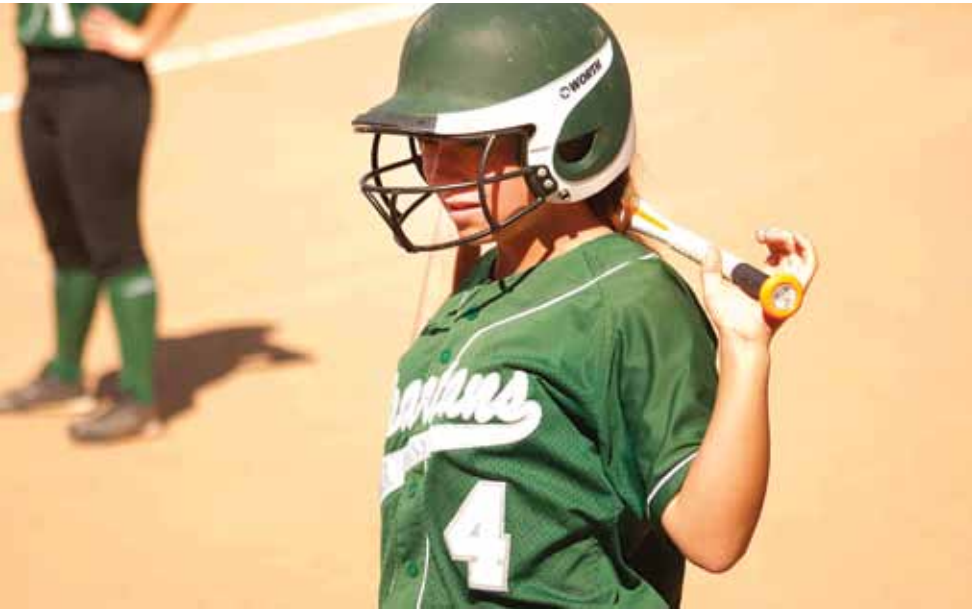
South High Spartan #4 waits to be called up to bat.