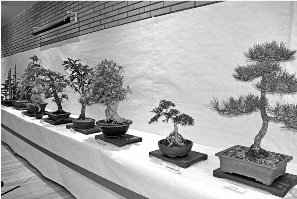
The Bunka Sai festival included flower arranging displays (ikebana) along with demonstrations of Japanese dance, koto and shakuhachi music, traditional vocal music, taiko drums, shodo calligraphy and origami. Okinawan taiko and a dance exhibition and martial arts performances were also featured.