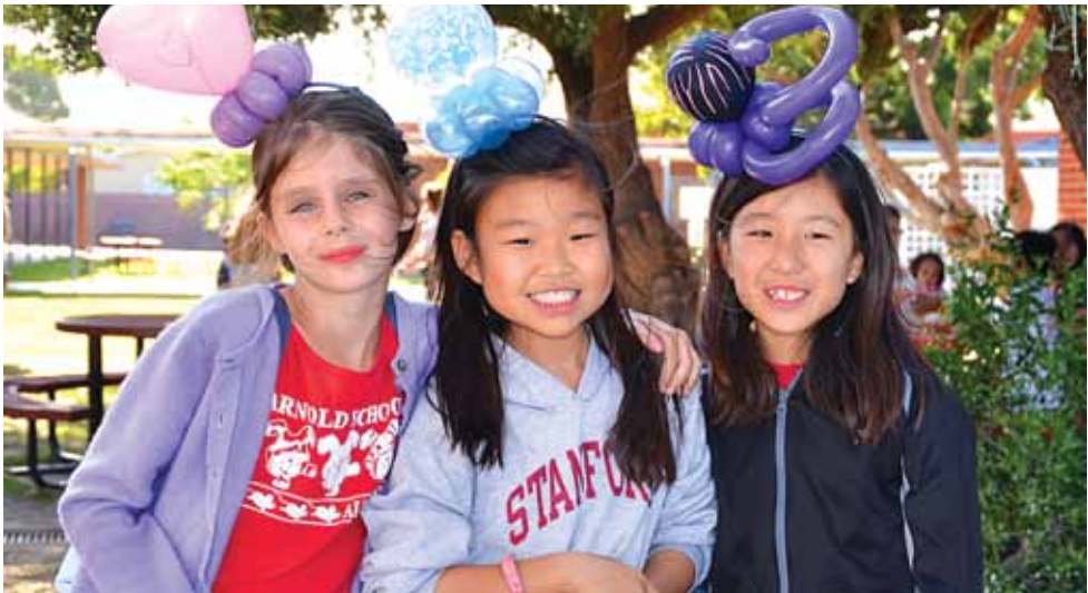
Joseph Arnold Elementary third graders.