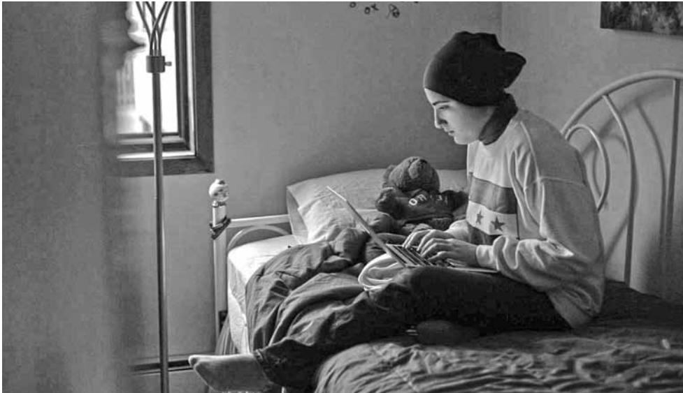
#chicagoGirl -- The social network takes on a dictator.

Unfortunately, as optimistic as all this sounds, the government is still in complete control, and sadly the Syrian regime has been much more difficult to topple than any contemporary uprisings. The film doesn't shy away from the casualties of the revolution: we are emotionally swept by this documentary. We learn that cameramen are often the first people to be targeted in shootings due to