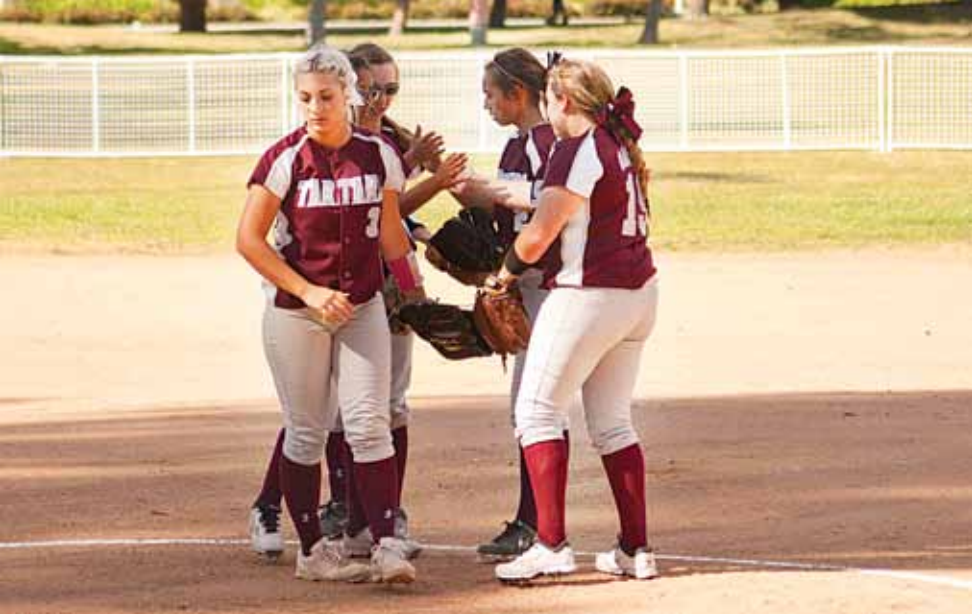
The Torrance Tartars huddle before the 5th inning.