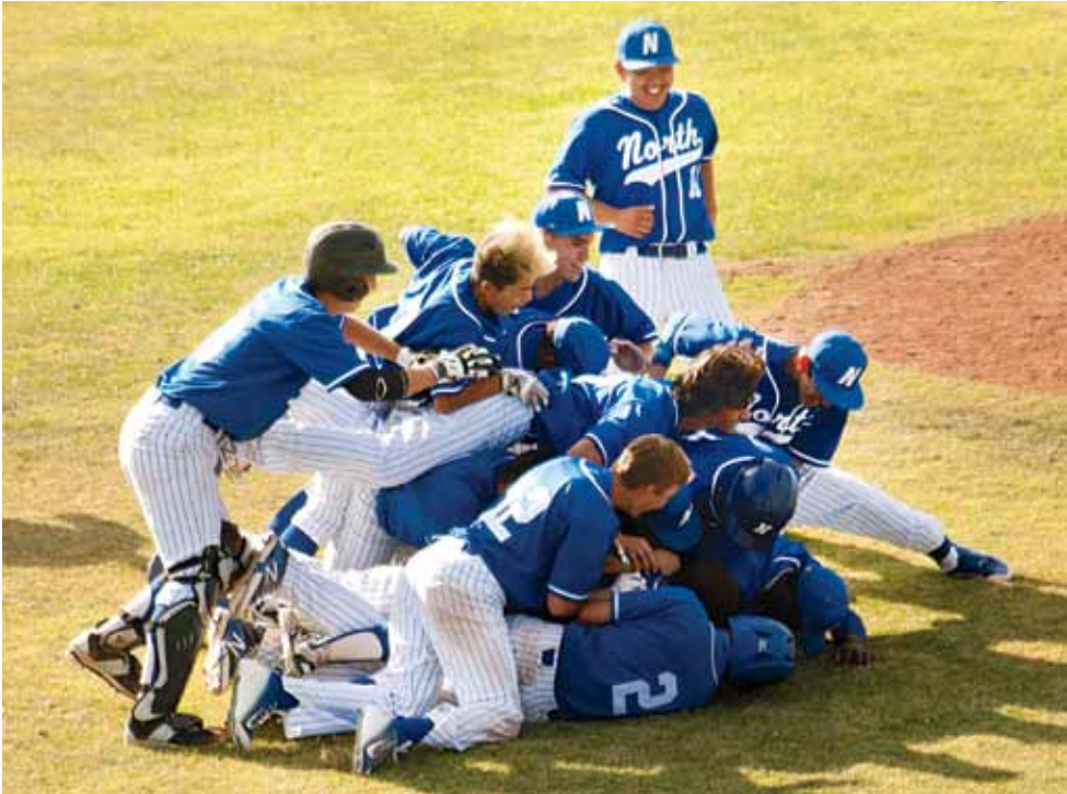
The North High Saxons celebrating a close victory against the Torrance Tartars.