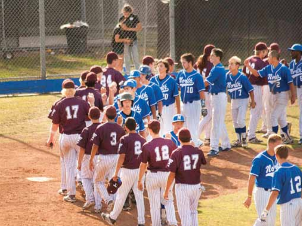
The Saxons and Tartars at the end of the game after a winning upset by the North High Saxons.