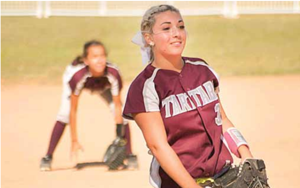
The Torrance Tartar's pitcher after a successful strike out.