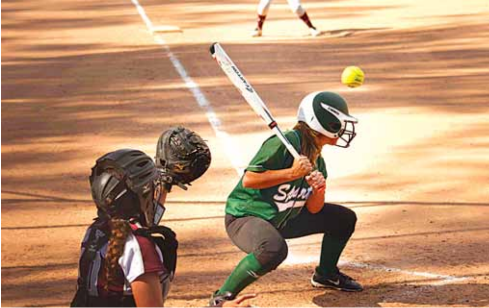
A South High Spartan has a close call with a high pitch.