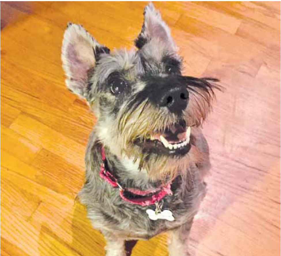
Suzy-Q is now the ruler of the roost in her new Cypress home.

Be kind. Save a life. Support animal rescue.