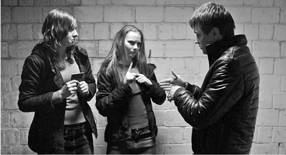
The Tribe.

themselves. His hard work has definitely paid off ten fold. Most of the scenes are shot in a one take, making the actors the sole focus. What's more, the lack of dialogue makes the performances feel much more heightened. Our eyes bounce around frame as we are more observant in trying to pinpoint just who our attention should be focused on. If there was any film that fits the criteria of "performance driven," this is it— like an intimate dance between lovers, friends, and enemies. I can't think of the last movie I went to that left me physically uneasy, and I say that