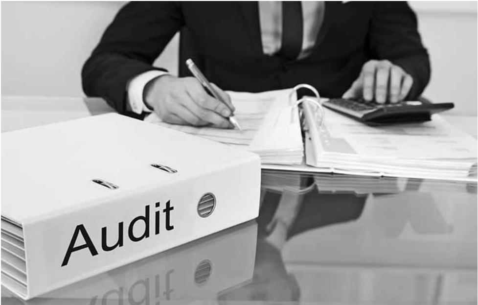
Preparing for the audit.

bers. My son asked me, after I told him I was being audited, "Gee, mom, what about your account in the Caymans?" To which I replied, "What account?" "Exactly!" he said, "So don't worry about it." He had a point. Realizing I am not alone in being audited, I have some advice. Make it a point to keep all receipts, log books, and important papers gathered by year in a safe place because you never know when you might get a friendly letter from the Internal Revenue Service informing you of a completely random audit. Sleep soundly. And remember; When you open the mail and find a surprise - from the IRS, right before your eyes - double-checking figures becomes second nature; as you rethink purchases, write offs, donations, and wages. Don't think it can't happen, for as soon as you do - a random notice will come out of the blue just for you. Relax and remember there is nothing to fear - unless you indeed have hidden some cash somewhere, dear. •