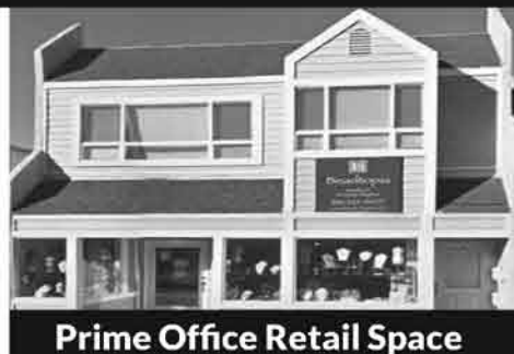
Prime Office Retail Space