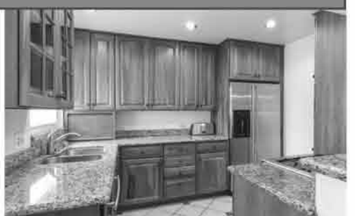
8836 Croydon Ave. Westchester • 3 BEDS/2 BATHS • REMODELED KITCHEN • PRIVATE BACKYARD Offered at $1,089,000 • 2 CAR GARAGE • 1,922 SF. • 1,922 SF.