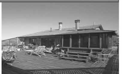
414 W. Walnut Ave. El Segundo • 4 BEDS/4 BATHS • UPDATED KITCHEN • SECOND STORY DECK Offered at $1,650,000 • 3 CAR GARAGE • 2,943 SF. • Lot: 6,699 SF.