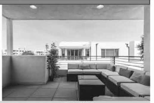
5560 Palm Dr. Hawthorne • 4 BEDS/3 BATHS • POOL & SPA • PATIO HOME • CABANAS • PRIVATE BACKYARD W/DECK Offered at $1,299,000 • 2,423 SF.