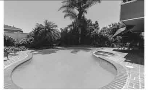
1510 E. Maple Ave. El Segundo • 5 BEDS/ 4.5 BATHS • CUSTOM GOURMET KITCHEN • POOL Offered at $1,699,000 • 3,015 SF. • 2.5 CAR GARAGE