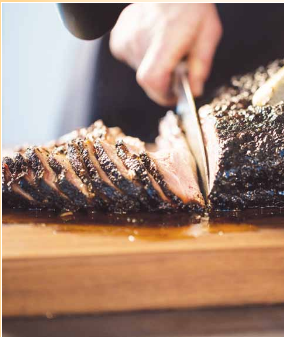
Recipe by omahasteaks.com, provided by BPT.