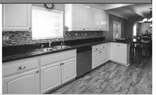
400 Bungalow Dr. El Segundo • 6 BEDS/ 4 BATHS • 2,943 SF. / Lot: 4,948 SF. Offered at $1,499,000 • 2 CAR GARAGE • NEW HARDWOOD/UPGRADED BATHS • UPGRADED BATHS NEW CARPETING UPSTAIRS