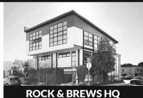
ROCK & BREWS HQ