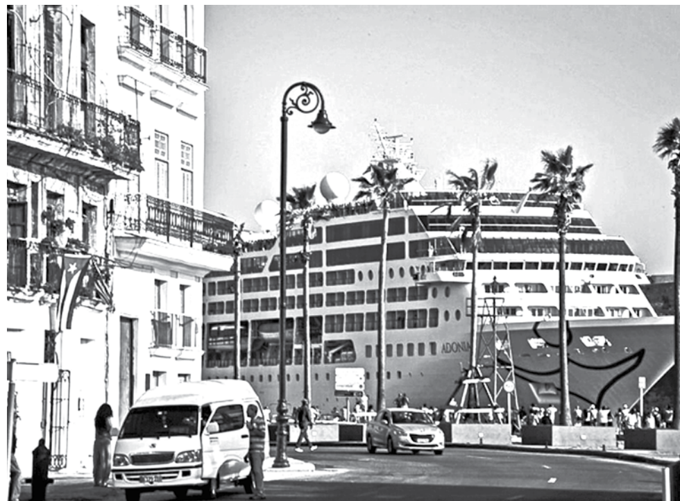
The first U.S. cruise ship reached Havana on May 2, and flights carrying Americans are next.

Passengers need a visa to travel to Cuba