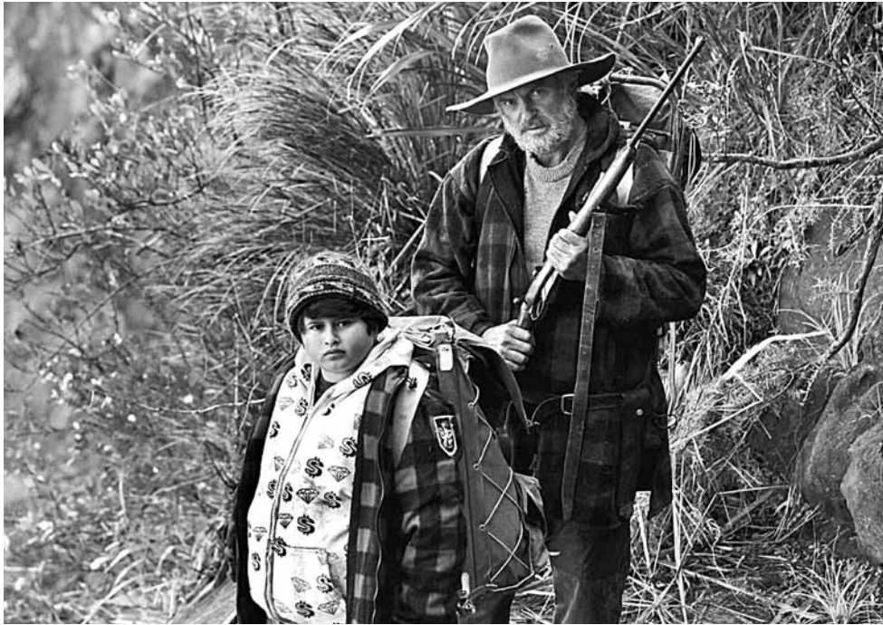
Julian Dennison, as Ricky, and Sam Neill, as Hec, in "Hunt for the Wilderpeople."

Coming off of his 2014 little seen but well-received New Zealand vampire mockumentary "What We Do in the Shadows," writer/director Taika Waititi fleshes out his cheeky brand of deadpan humor in his follow-up comedy "Hunt for the Wilderpeople." This fun adventure story bursts with laughs, surprisingly