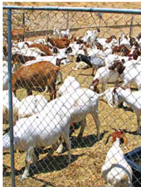
Goats in their pen.