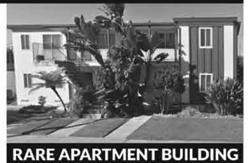
RARE APARTMENT BUILDING