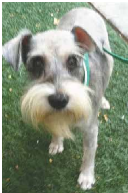
Kristy has been mistreated and needs a new loving family.

Hi there, it's me, Flanagan , and I'm a playful 2-year old male Miniature Schnauzer mix. We are guessing that I may have a bit of Doxie in me since I am low to the ground, only weigh 14 pounds and have a wiry coat. Everyone says that I am cute as a button and smart as a whip. It's hard to believe that I was turned in to a LA county shelter as a stray. It was almost three weeks and I was running out of time when MSFR came to my rescue. I love to go to the dog park, play ball, go for hikes and I'm happy just being with my family. I'm a likeable youngster who gets along well with other dogs. In fact, I think I