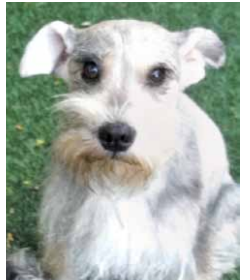
Misty was also mistreated and left alone; she could use some love.

Bonjour! I am a 4-year old, female “Schnoodle” (a Schnauzer/French Poodle mix), named Paris . I had been at a high kill shelter for several weeks and it appeared that no one wanted me. Then a large number of dogs were brought into the shelter because of the July 4th holiday and I knew that my days were truly numbered. The MSFR volunteers