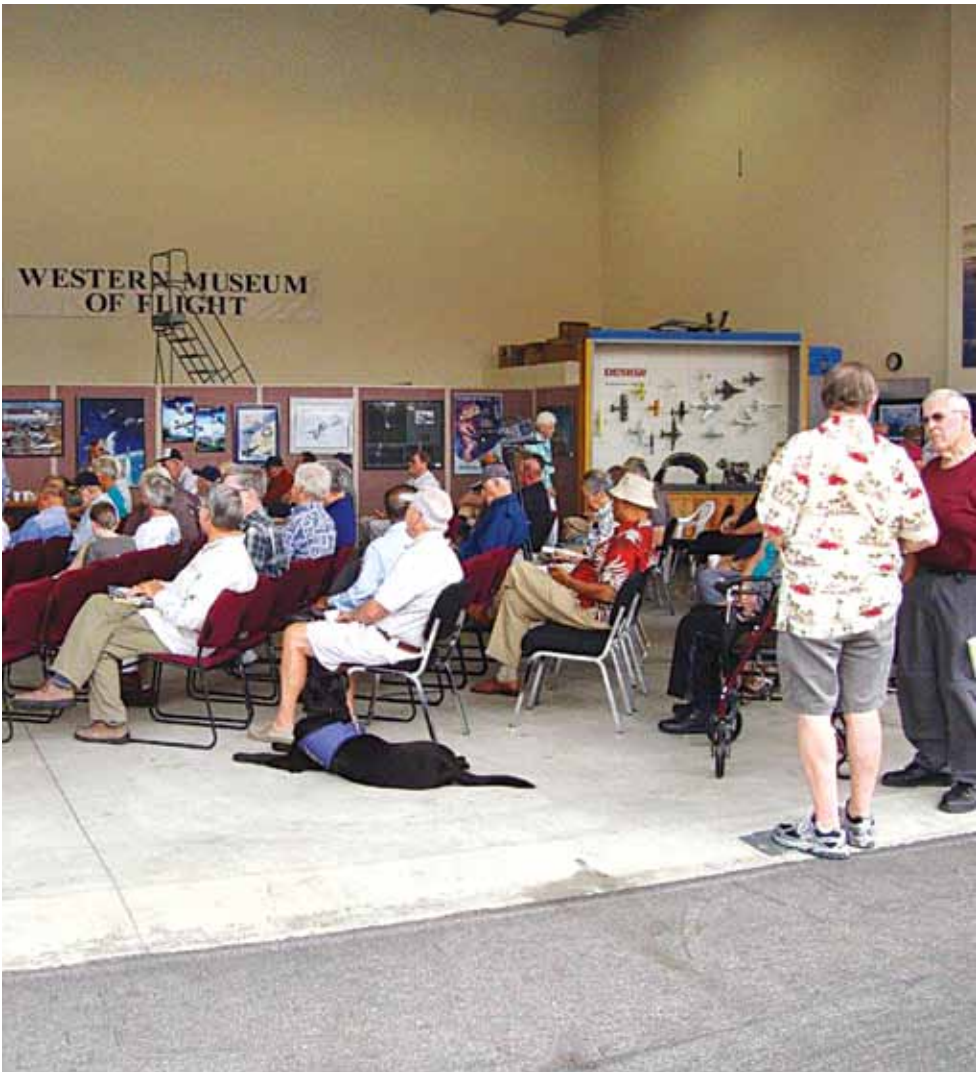
Gathering for the lecture at the Western Museum of Flight.