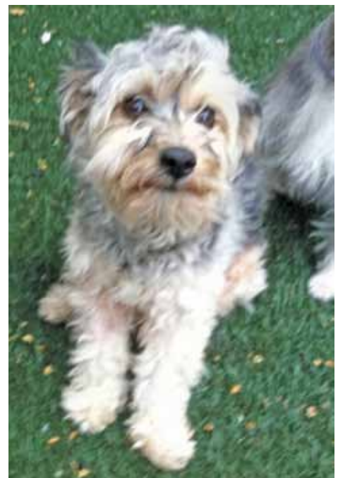
Paris is a loving dog who would cuddle up with an owner.