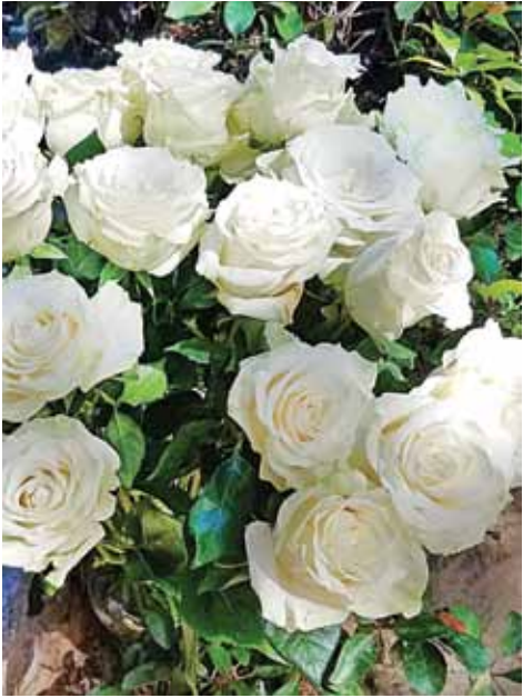
A plethora of roses.

When I arrived home, my two beautiful Fragrant Cloud rosebushes were planted. You would have thought it was Christmas! No matter that I still have to dig a moat around each bush and provide feed and deep water. I was just so happy seeing the roses back where they belonged--in the ground. Actually, truth be told, the new bushes were much healthier, stronger, bigger and better looking than the old bushes.