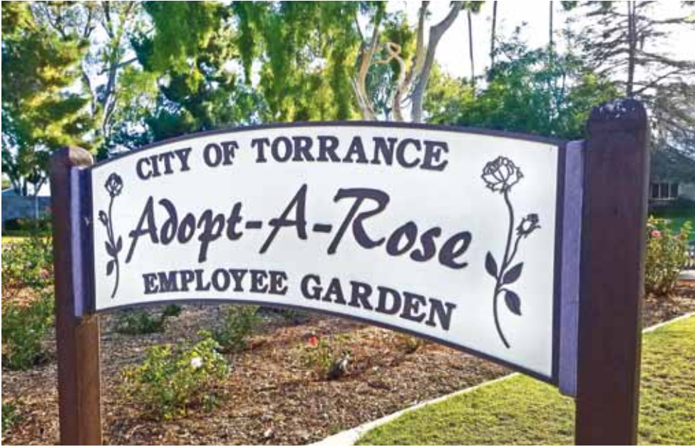
The City of Torrance Adopt-A-Rose Employee Rose Garden.

May I suggest you take a look at your own garden, no matter how small, and tend to it a little? Torrance is a beautiful place and all the home gardens I noticed have special plants and flowers. We are so blessed with our summer sunshine. Let's not waste an opportunity for beautifying our wonderful city of Torrance. •