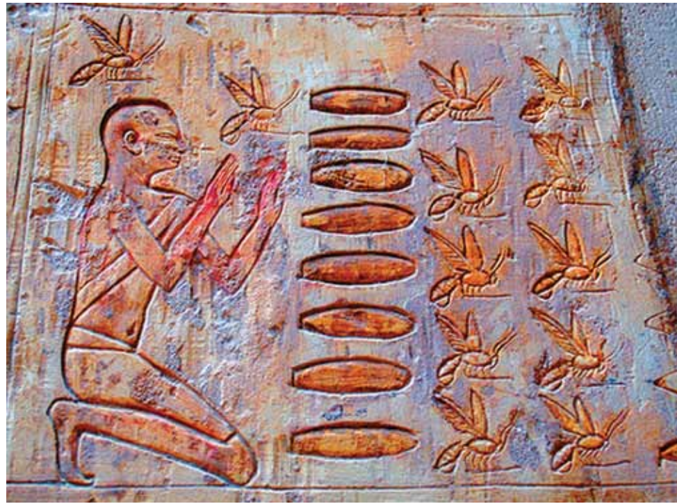
Part of an ancient Egyptian beekeeping relief at Pabasa's tomb.

"This year was really good for the beekeepers because all the rain brought out vegetation. There is a colony collapse disorder which beekeepers and scientists haven't pinned down the exact cause, but having rain and a lot of vegetation really strengthens the hive. Hopefully, when they do research into the neonicotinoids [pesticides], they can find out if that is a major contributor because