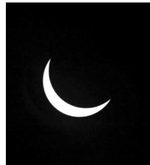
The moon is crossing over in front of the sun, creating a crescent sun.