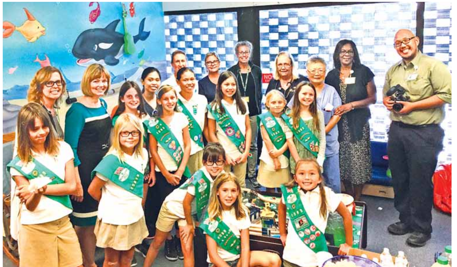
Torrance Girl Scouts used a portion of their cookie sale proceeds to host a special party to celebrate Torrance Memorial Medical Center pediatric nurses for all the care and compassion these wonderful professionals provide to help children overcome illness. Nurses were gifted "survival kits" to bring cheer to those who have the big job of caring for Torrance Memorial's young patients. In the photo, Torrance Memorial Medical Center staff and clinicians pose with Girl Scout Troop 1095 during the appreciation visit. •