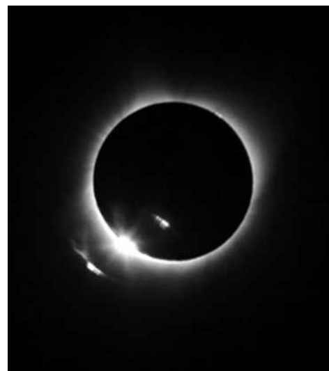
Baily's beads, or Diamond ring effect.