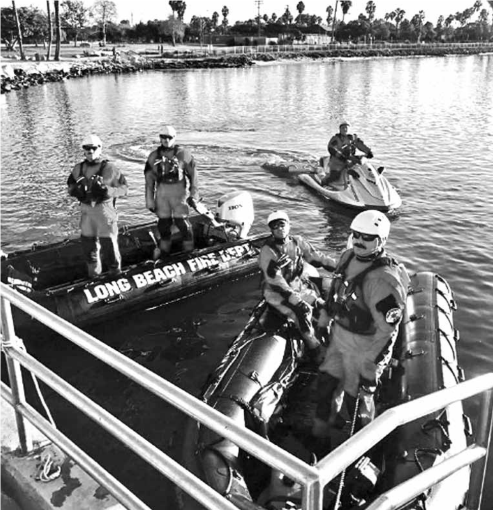
A Long Beach expo held Saturday featured disaster-readiness tips and rescue demonstrations for South Bay residents. The above photo is from last year’s program.

down for the public’s safety. Southern California calamities aren’t like the hurricanes in the Gulf and Atlantic, which follow a season and come with a warning to flee or ride out the storm. Local disasters come on suddenly, with a sonic boom or a shaking of the ground. Clear thinking isn’t always possible when the building is rumbling and