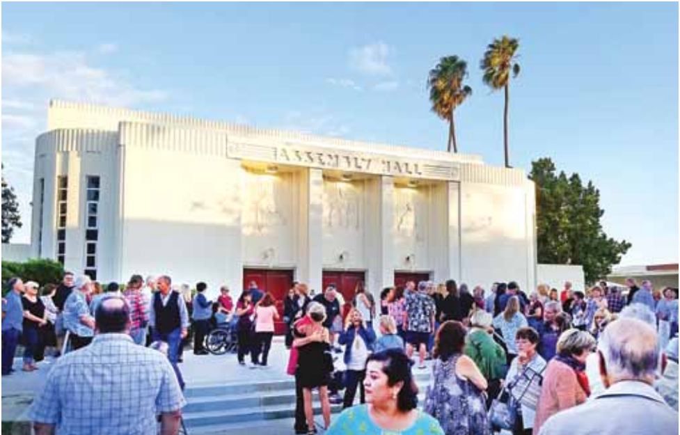
Before the Concert of the Century.

What makes a night special? Some say it's the event. Some say it is the music. But on this Saturday night, September 9, in Torrance, California, it was all the above plus a lot of love. Performers took time from their busy lives for rehearsals so they could give the Concert of the Century , and gave a gift not only for the celebration of