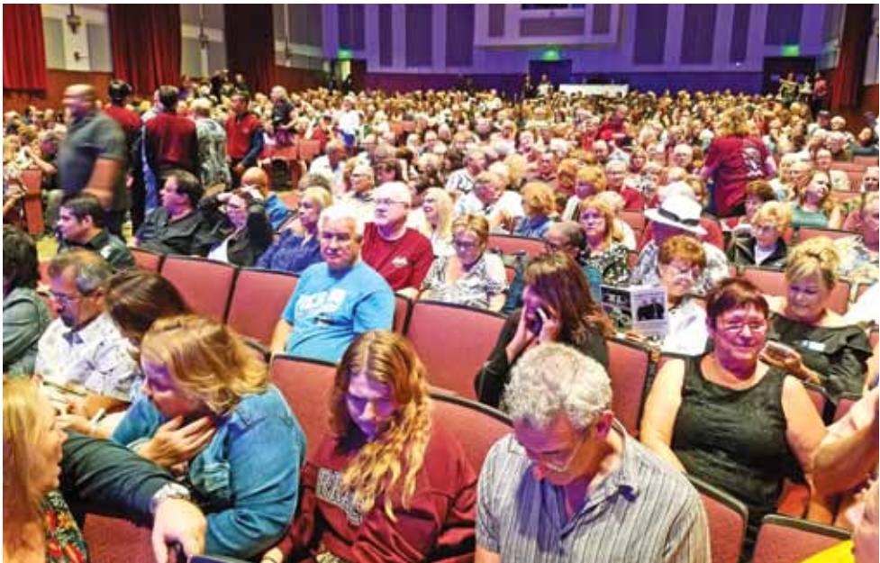
A packed house.