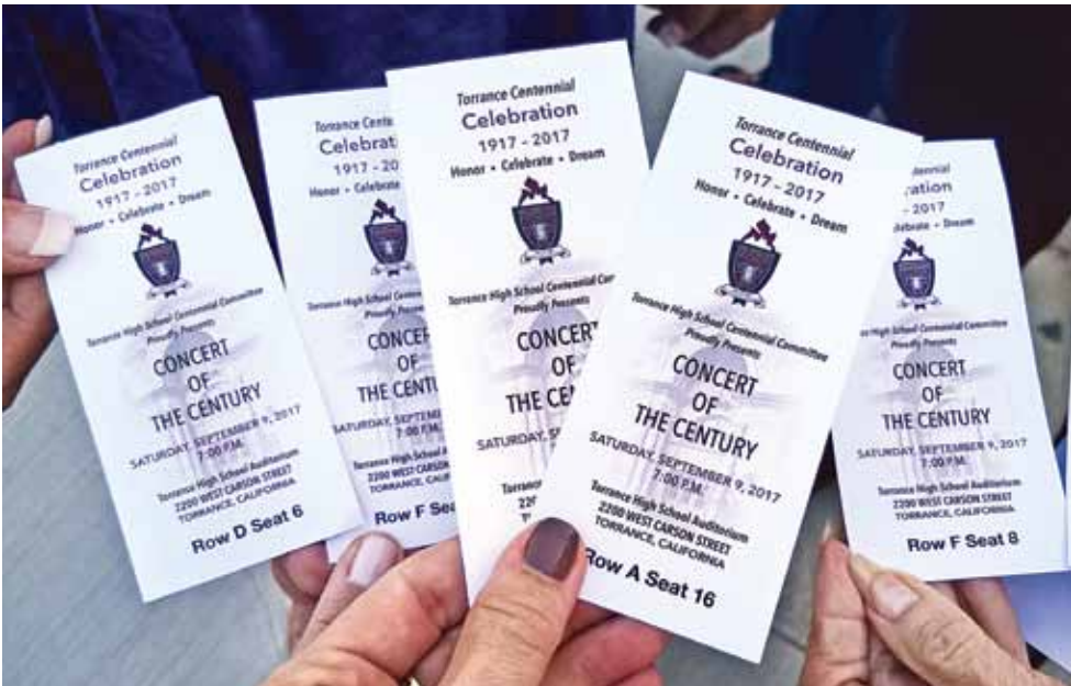
Tickets to the Concert of the Century.

Torrance High School's 100 years, but to the memories of high school days gone by. Memories held in hearts tightly locked up, but on that special night, unleashed in pure joy. Truly, a night to remember. Happy 100 th birthday, Torrance High School! In 100 years, it will be difficult--if not impossible--to top this! •