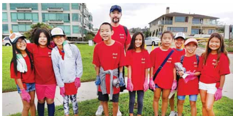
Team Honda children volunteers.

If you live in Torrance, or even if you don’t, and want to help with Coastal Cleanup Day next year in 2018, just mark your calendar for the third Saturday in September. Meeting friends and making new ones while cleaning up our beach is fun. Not only will you be blessed with the clean air and sunshine in a gorgeous park and beach, but you also help the sea animals that can’t distinguish between little bits of trash and food. See you next year at Coastal Cleanup Day 2018! •