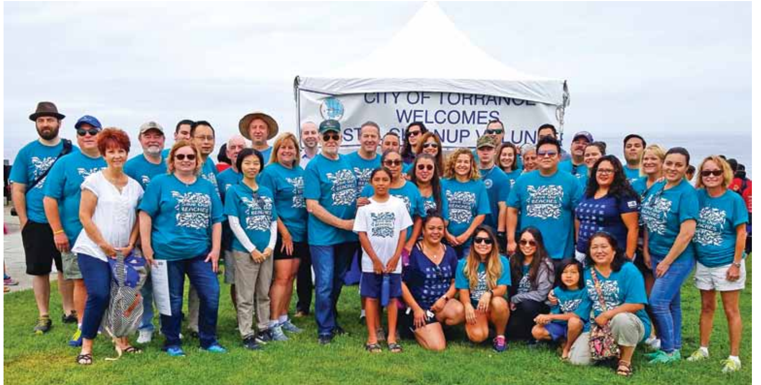
The turnout was strong for Coastal Cleanup Day on Saturday, September 16 with members of the residential and business communities on-hand along with City of Torrance and regional officials. The photo shows Team Torrance getting ready to "save our beaches." •