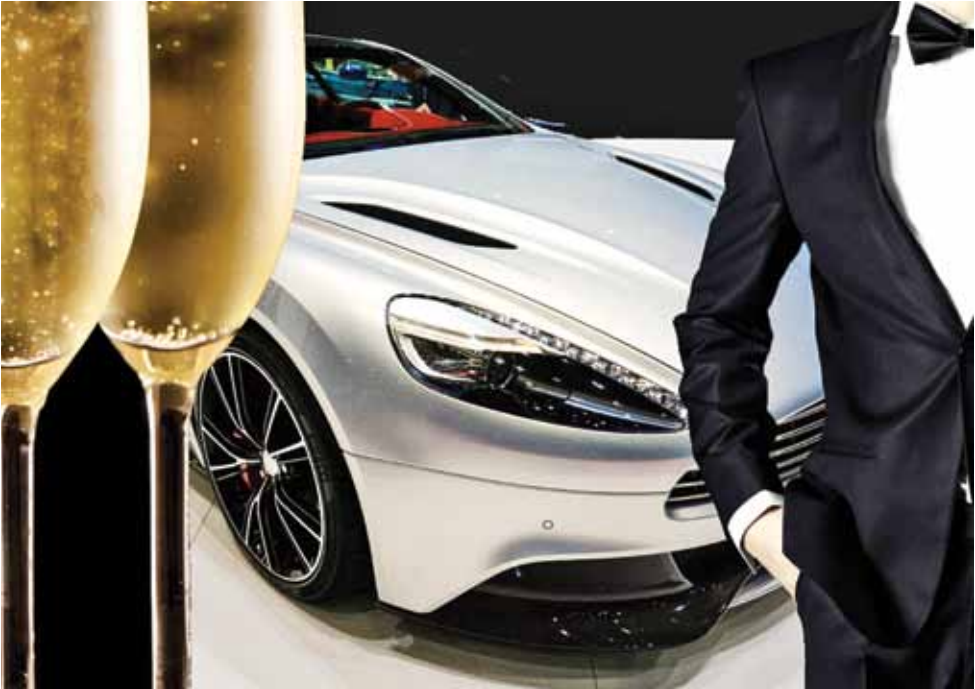
Bond, James Bond.

As I asked more and more people in Torrance about their favorite Bond, I found I could just about pick who their favorite choice would be by their generation. Most of the time, the Bond they first saw was their favorite and answers ranged from "Who?" to "What Bond?" The results proved Sean Connery and Daniel Craig were the leaders in my very unscientific survey. In the end, who played James Bond is not earth-shattering in the least. However, right now, this week, somehow it provided me with a respite of frivolity and pause, reminding me there are wonderful people who do amazing things every day. Like James Bond who works tirelessly protecting the world from evil, I think we need to remember what love can do and how blessed we are, no matter how much we are shaken or stirred. •