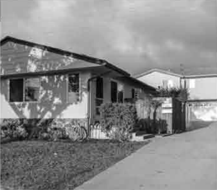
520 Washington St. El Segundo 4 CAR GARAGE, REMODELED 2016