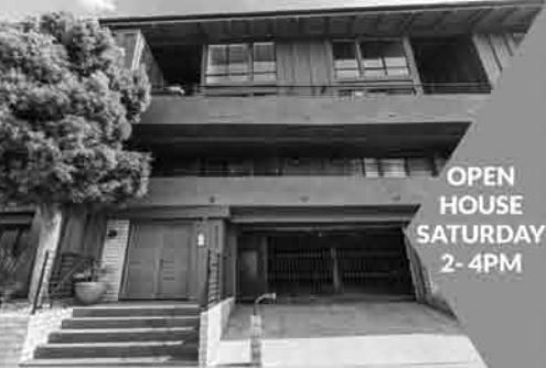
6505 Esplanade # 2 Playa del Rey $1,349,000