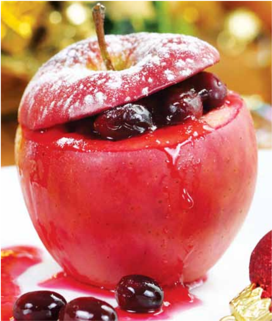
Recipe by Frontier Co-op, provided by BrandPoint.

Prep time: 10 minutes | Cook time: 20 minutes | Makes 4 servings