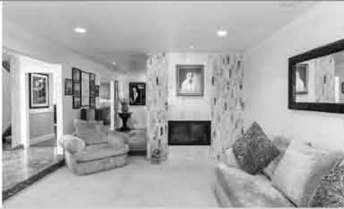
710 Redwood Ave. El Segundo Offered at $ 1,449,500