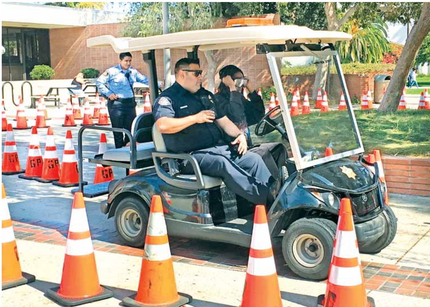
El Camino College held its 16th Annual DUI Awareness Fair on Oct. 25, to spread community awareness and discourage drunken driving. The fair included demonstrations that mimic the effects of being under the influence. Participants were allowed to wear special "DUI goggles" or "marijuana impairment goggles," that simulate being under the influence while driving a golf cart.