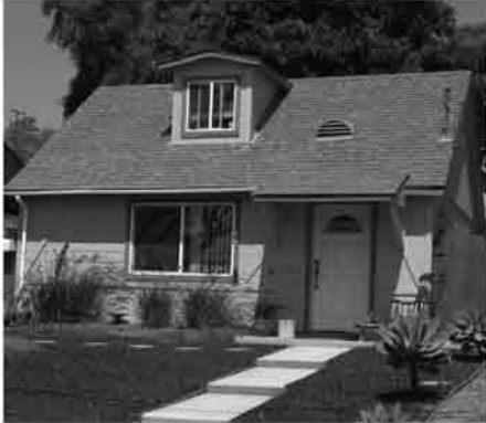
409 E. Oak Ave. El Segundo