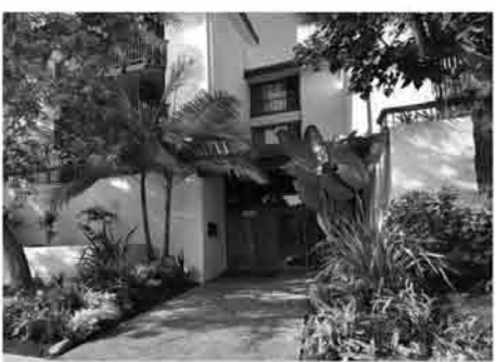
8515 Falmouth Ave # 423 Playa del Rey $ 659,000