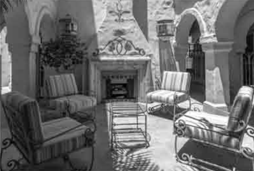
6220 Pacific Ave #101 Playa del Rey New Price $1,095,000