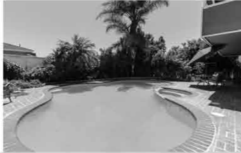
1510 E. Maple Ave. El Segundo Offered at $1,599,000