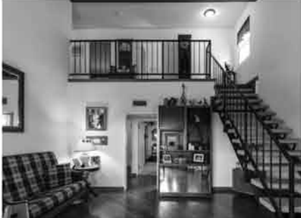
754 Hillcrest St. El Segundo $1,488,000