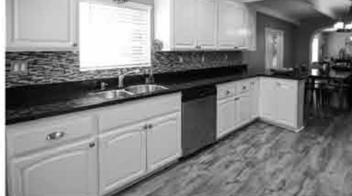
400 Bungalow Dr. El Segundo Offered at $1,499,000