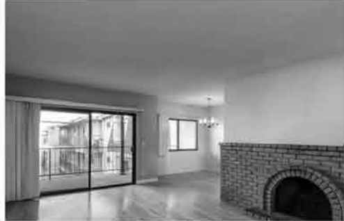
738 Main St. El Segundo #302