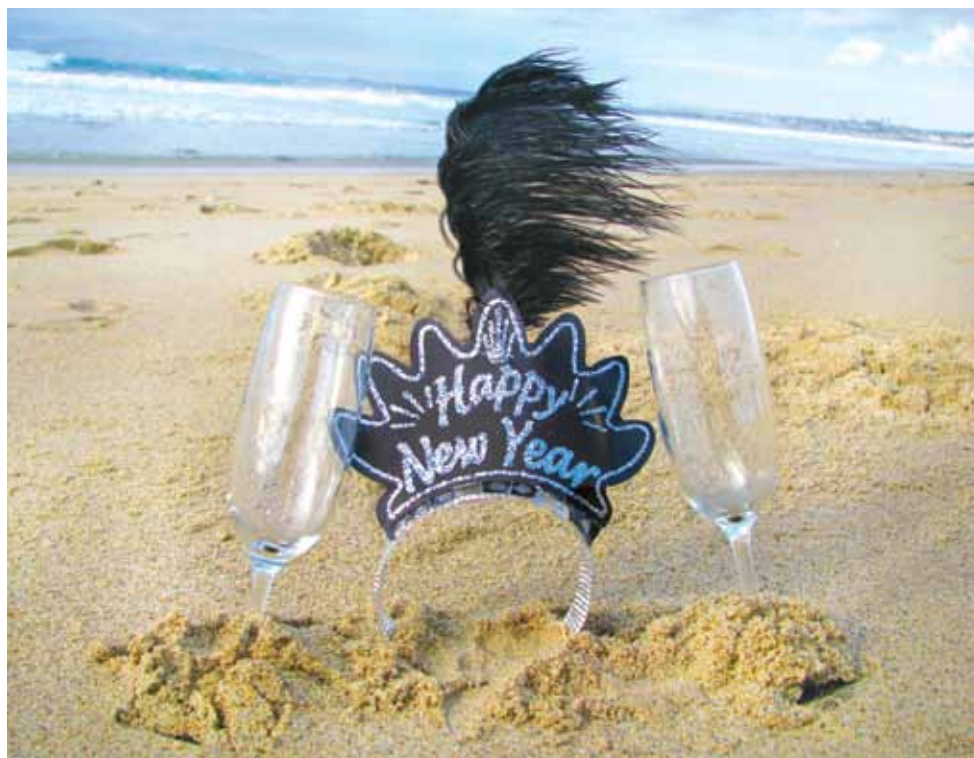
Happy New Year 2018!