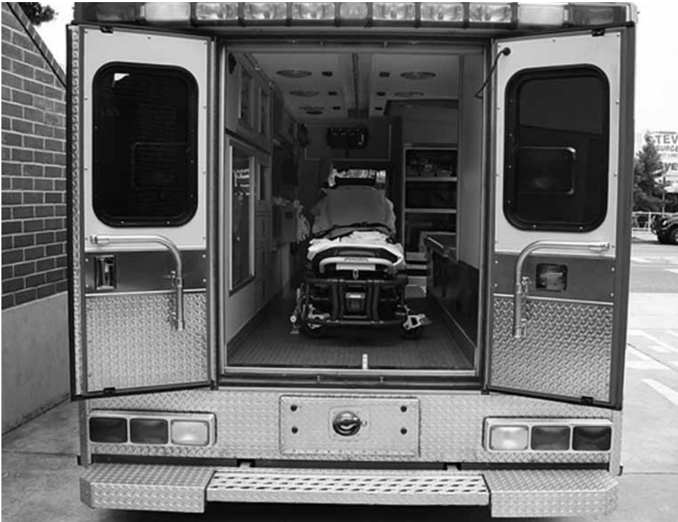
The six-month-old law didn't stop surprise medical bills for ambulance services.